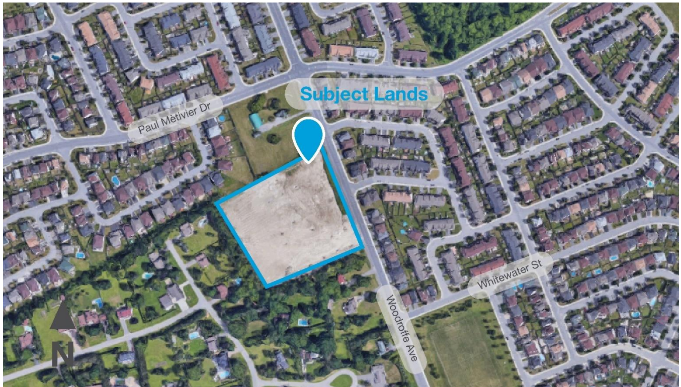
Figure 1: Subject Lands Key Map

The approximate 2.3-hectare subject lands are located on the south-west side of Woodroffe Avenue and Cresthaven Drive/ Paul Metivier Drive in Barrhaven, City of Ottawa. The subject lands are bounded to the east by Woodroffe Avenue, an existing major collector road with commercial and residential uses.