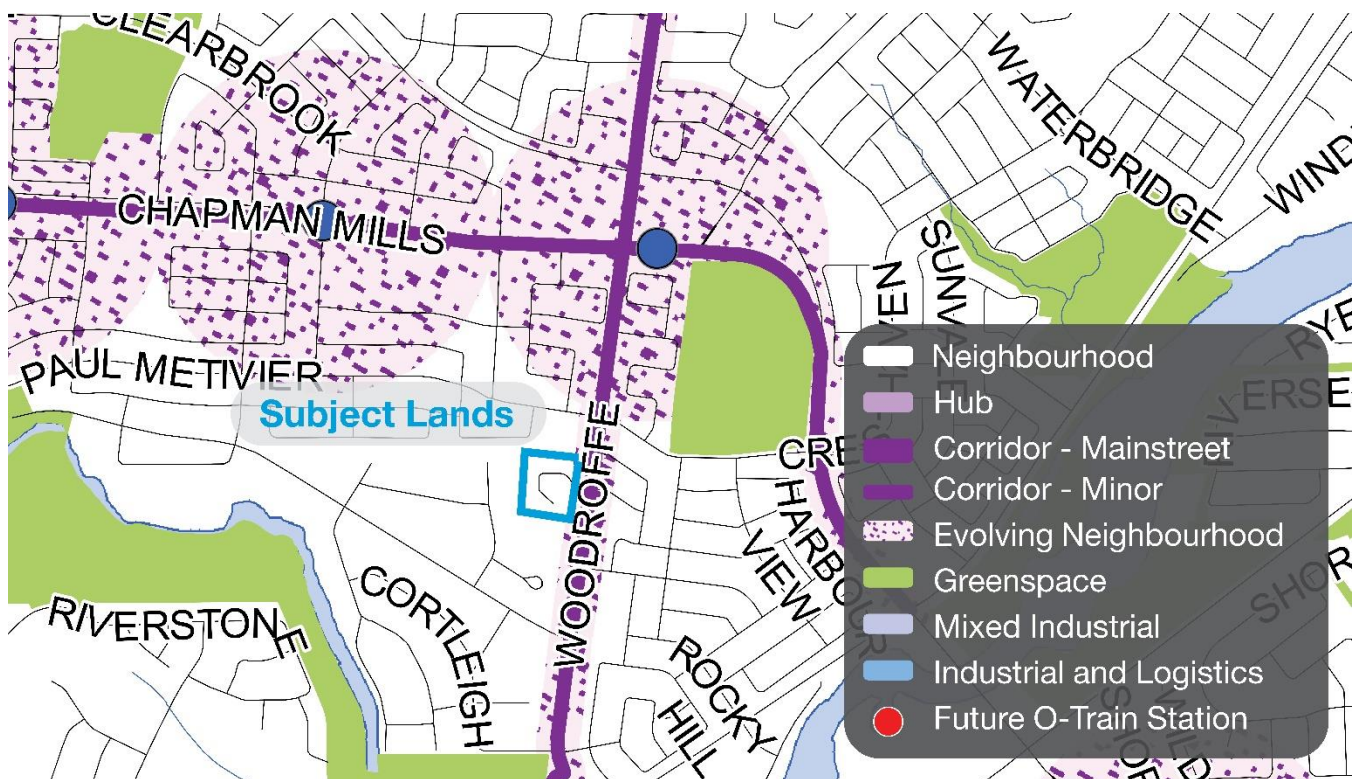
Figure 2: Schedule B6 - Suburban Transect (Southwest)

The subject lands are located in the Suburban Transect as outlined on Schedule A – Transect Policy Areas. The Suburban Transect is characterized by a suburban pattern of built form and site design, consisting predominantly of detached houses, with a significant amount of semi-detached and townhouses. The new Official Plan recognizes the traditionally suburban pattern of built form and site design while supporting intensification that aids in the evolution towards 15-minute communities.