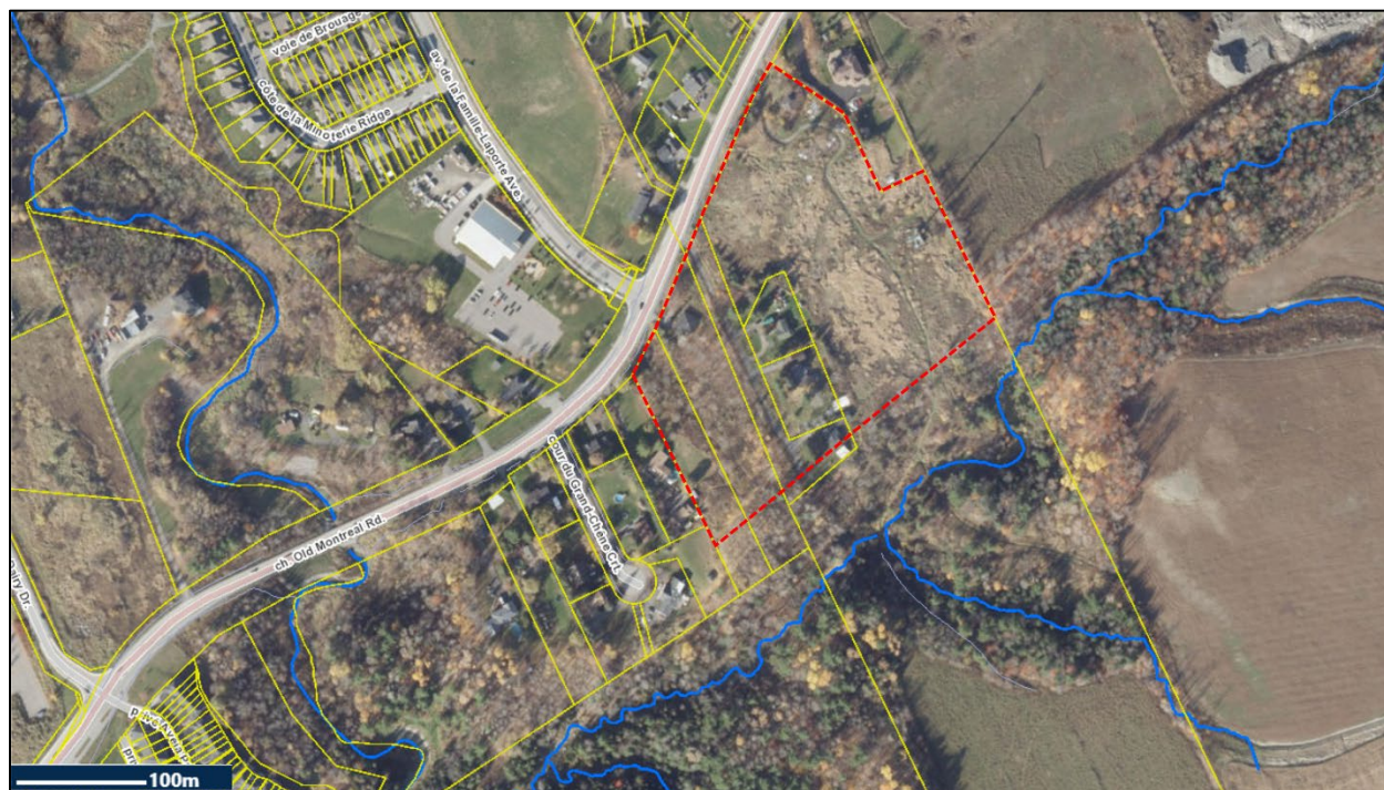
Figure 1. Site context

This report is an Environmental Impact Statement (EIS) prepared by Kilgour & Associates Ltd. (KAL; Appendix A) on behalf of Phoenix Homes in support of their proposed development of the properties on Old Montreal Road, Ottawa, Ontario. The subject properties (Cumberland; CON 1 PT LOT 27, 28 OS; PIN 145260027, 145260023, 145260026, 145260024, 145260025) are located at 1154, 1180, 1172, 1176, and 1208 Old Montreal Road and cover approximately 18.5 ha. The proposed development area (herein the “Site”) will include approximately 5.3 ha on the northern half of the properties (Figure 1).