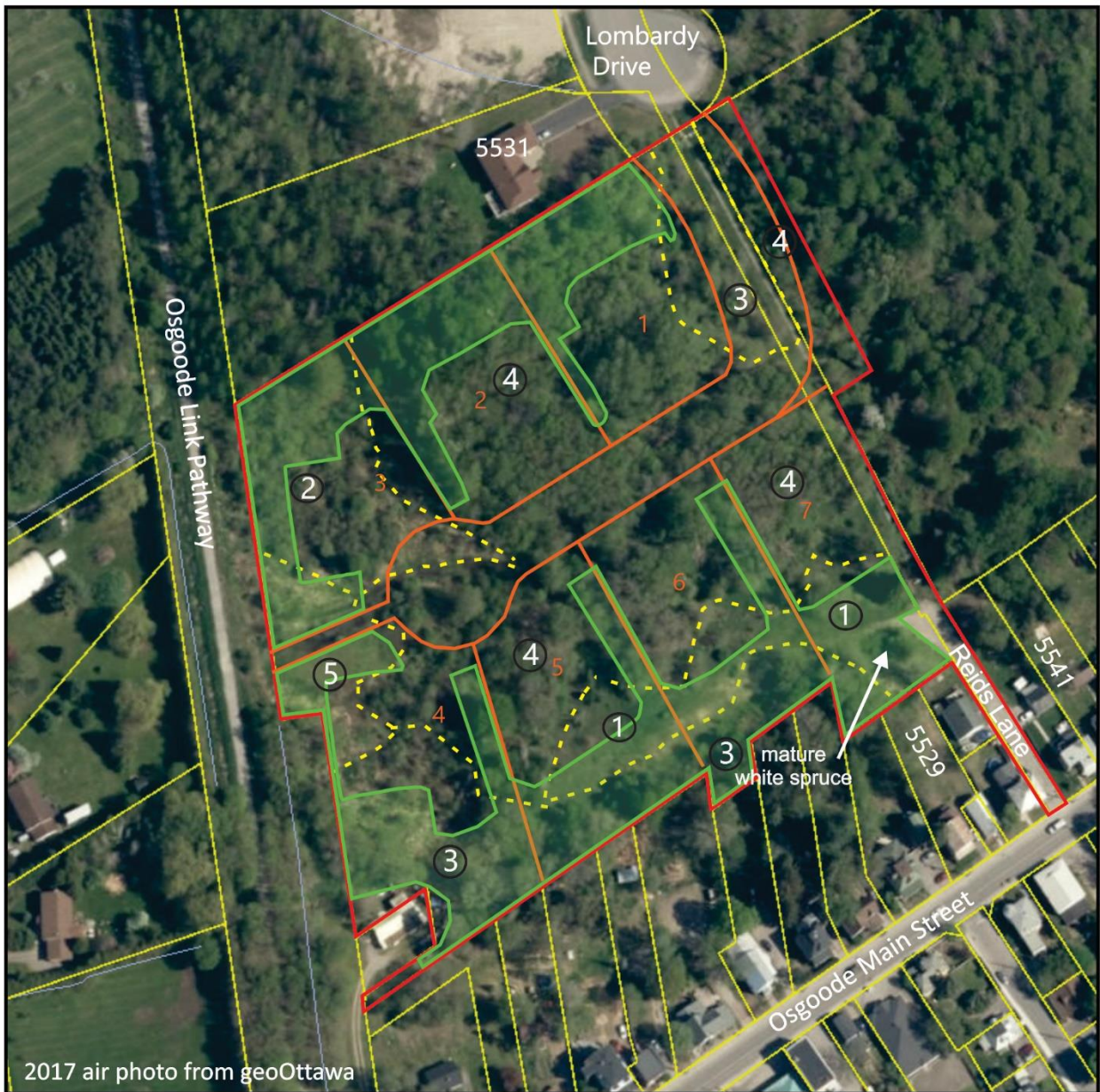
2017 air photo