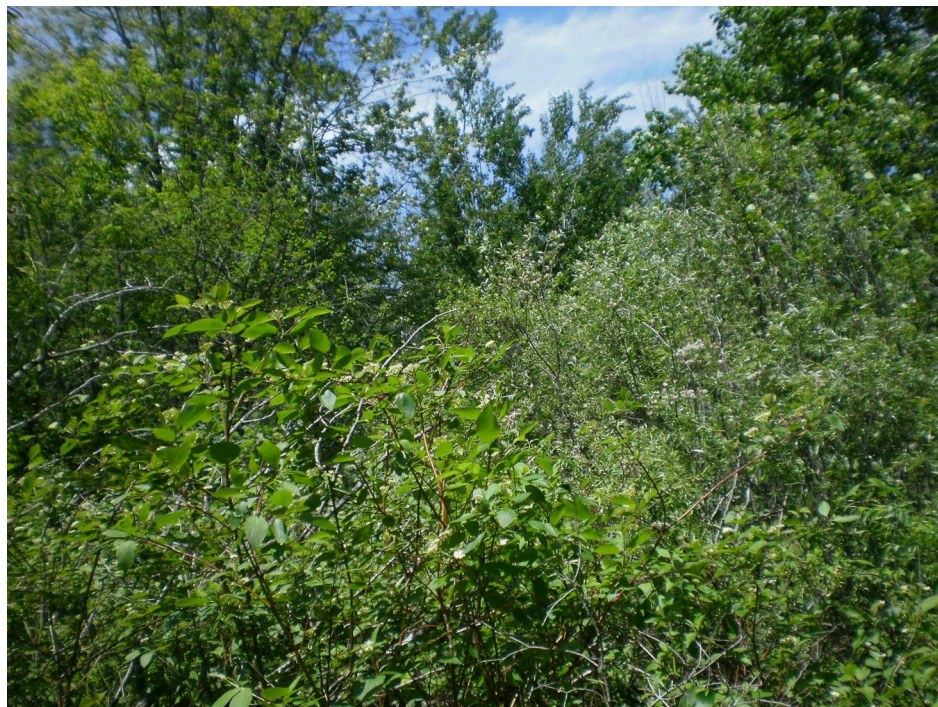
Photo 3 – Cultural thicket in the northwest portion of the site. View looking north (June 12 th , 2019)