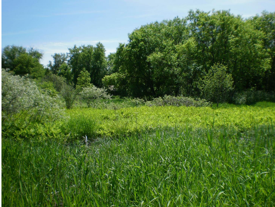
Photo 6 – Reed canary grass meadow marsh, with purple loosestrife common, along the central-west edge of the site. View looking southeast from recreational pathway (June 12 th , 2019)