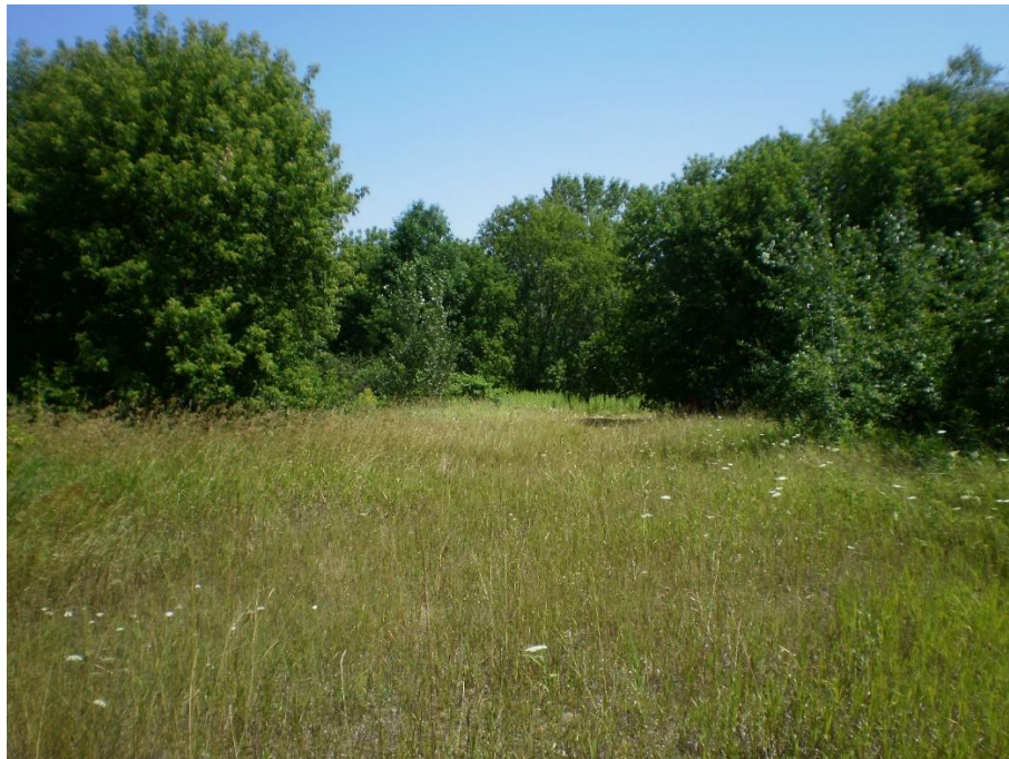
Photo 1 – Small area of cultural meadow habitat in the southeast portion of the site. View looking east (August 8 th , 2019)

Wildlife observed during the surveys included American crow, turkey vulture, red-tailed hawk, black-capped chickadee, yellow warbler, common yellowthroat, great-crested flycatcher, least flycatcher, grey catbird, American robin, northern cardinal, common grackle, blue jay, American goldfinch, song sparrow, red squirrel, and grey squirrel. No stone fences or larger trees with potential wildlife cavities were observed. A 20cm dbh snag with small woodpecker holes was noted in the southwest portion of the site and will be retained.