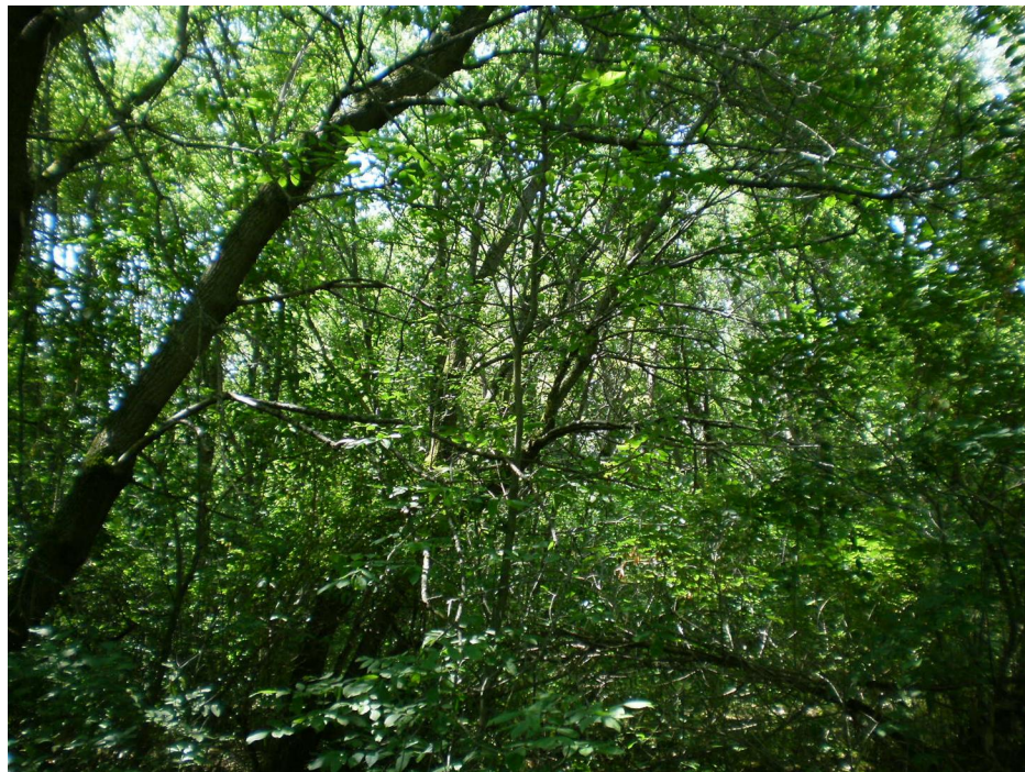
Photo 5 – Upland deciduous forest in the central-east portion of the site. View looking west (August 8 th , 2019)