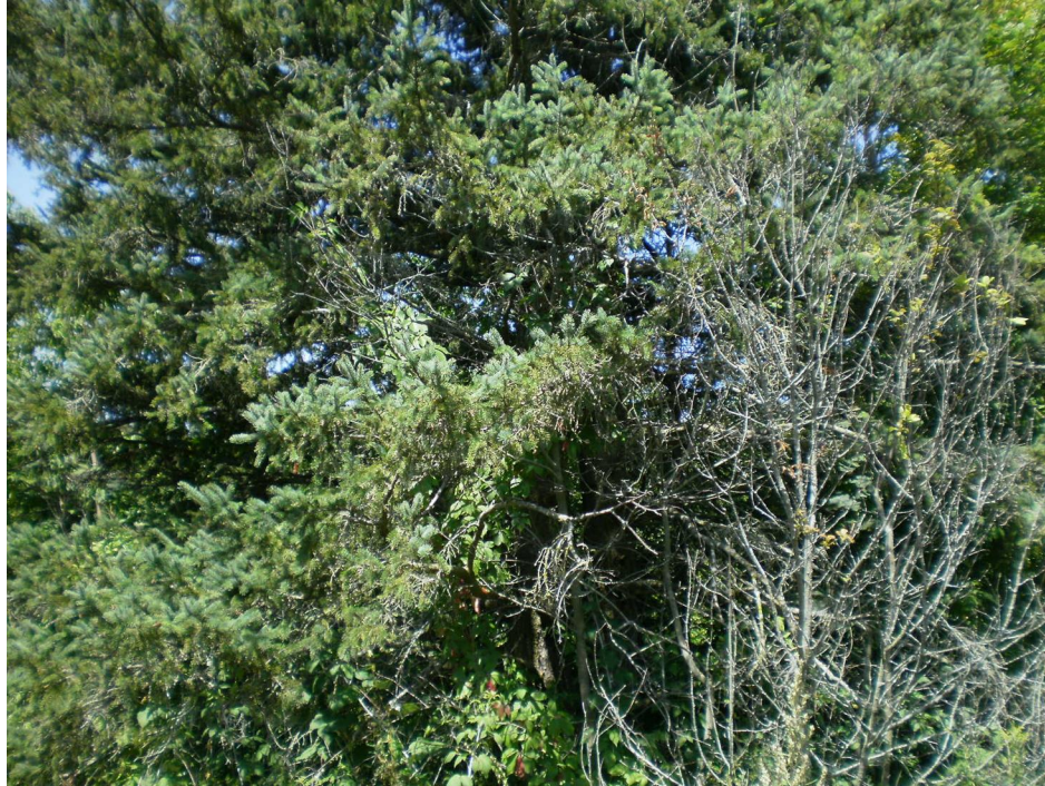
Photo 2 – Mature white spruce in the southeast corner of the site. View looking north (August 8 th , 2019)