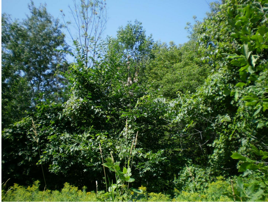
Photo 4 – Cultural woodland in the northeast corner of the site. Note ash tree with very little leaf-out. View looking west (August 8 th , 2019)