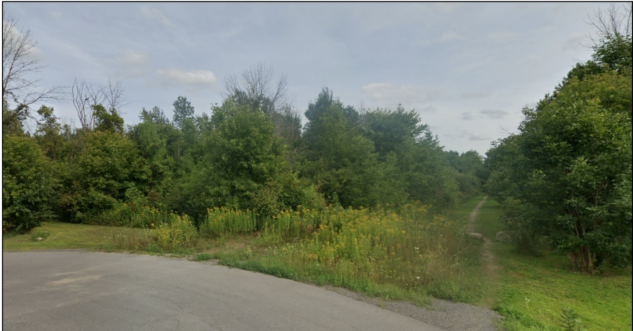
Figure 4. Woodlot East of the Subject Property

West: Immediately west of the Subject Property is the Osgoode Link Pathway. Further west is a residential subdivision and agricultural lands.