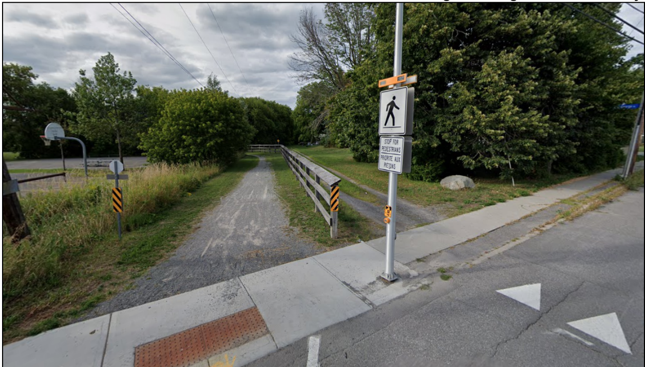
Figure 5. Osgoode Link Pathway

West: Immediately west of the Subject Property is the Osgoode Link Pathway. Further west is a residential subdivision and agricultural lands.