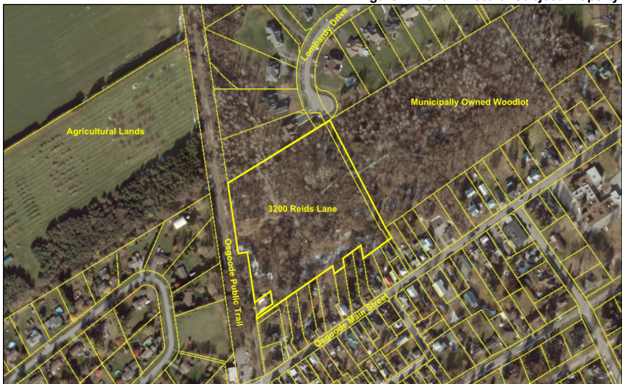
Figure 1. Aerial Photo of Subject Property

3200 Reids Lane is located in Ward 20 (Osgoode) of the City of Ottawa. The Subject Property is legally described as Part of Lots 27 & 28, Concession 1, Osgoode, and Part of Lots 50 & 51, Registered Plan 393, Ottawa. The Subject Property includes a portion of an adjacent eastern parcel that has been used historically as an informal walking trail connecting Osgoode Mainstreet and Lombardy Drive. The adjacent eastern parcel is legally described as Part of Lot 28, Concession 1, being parts 3 and 4 on Plan 5R1527, Osgoode.