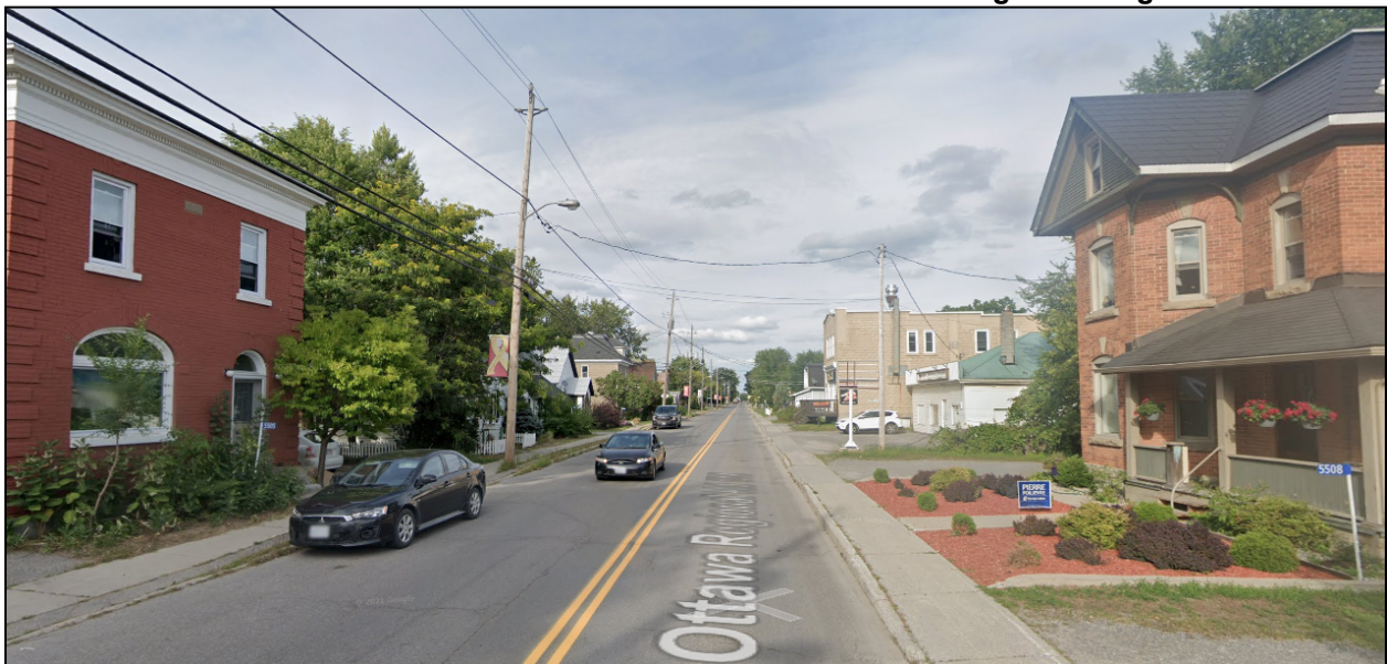
Figure 3. Osgoode Mainstreet

South: South of the Subject Property are properties that front onto Osgoode Mainstreet. There is a mix of residential and commercial uses along Osgoode Mainstreet. South of Osgoode Mainstreet are residential subdivisions.