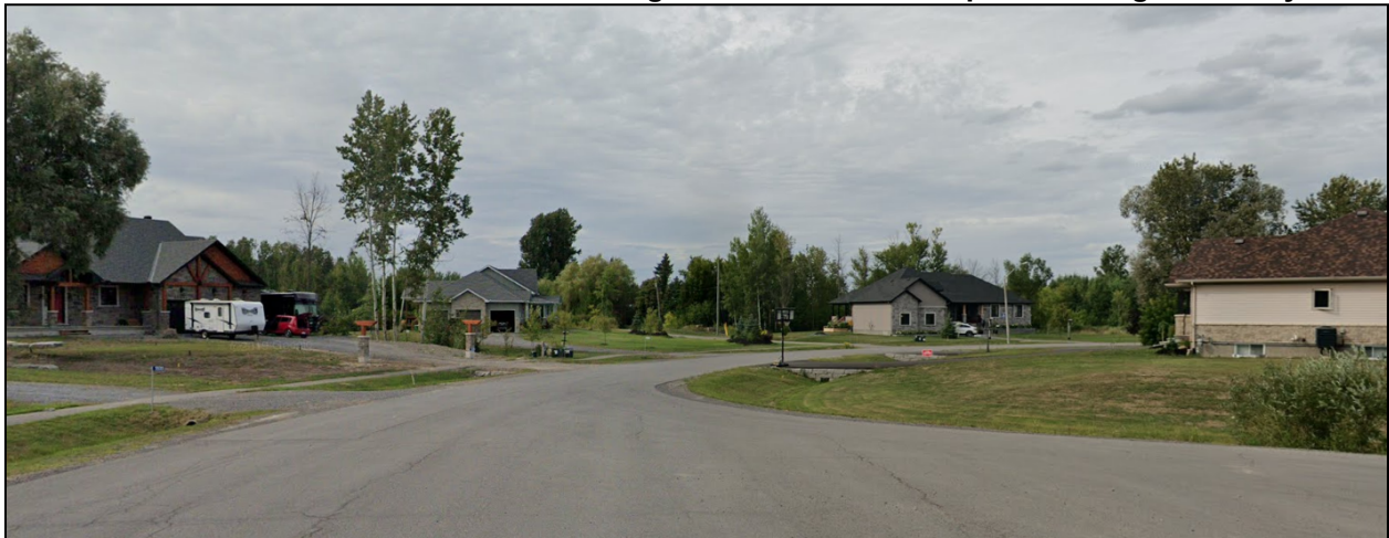
Figure 2. Residential Properties along Lombardy Drive

South: South of the Subject Property are properties that front onto Osgoode Mainstreet. There is a mix of residential and commercial uses along Osgoode Mainstreet. South of Osgoode Mainstreet are residential subdivisions.