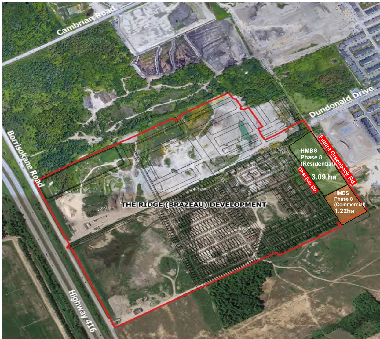
Figure 1: Key Plan of 3718 Greenbank Road Development Area

The development land is approximately 4.31 ha in area consisting of 1.22 ha commercial area and 3.09 ha residential area comprising 19 blocks of townhouses with a total of 228 units. This functional servicing report covers only the residential portion of the site and will demonstrate that the subject site can be freely serviced by existing municipal water, sanitary, and storm services while complying with established design criteria recommended in background studies and City of Ottawa guidelines. A draft site plan is included in Appendix B .