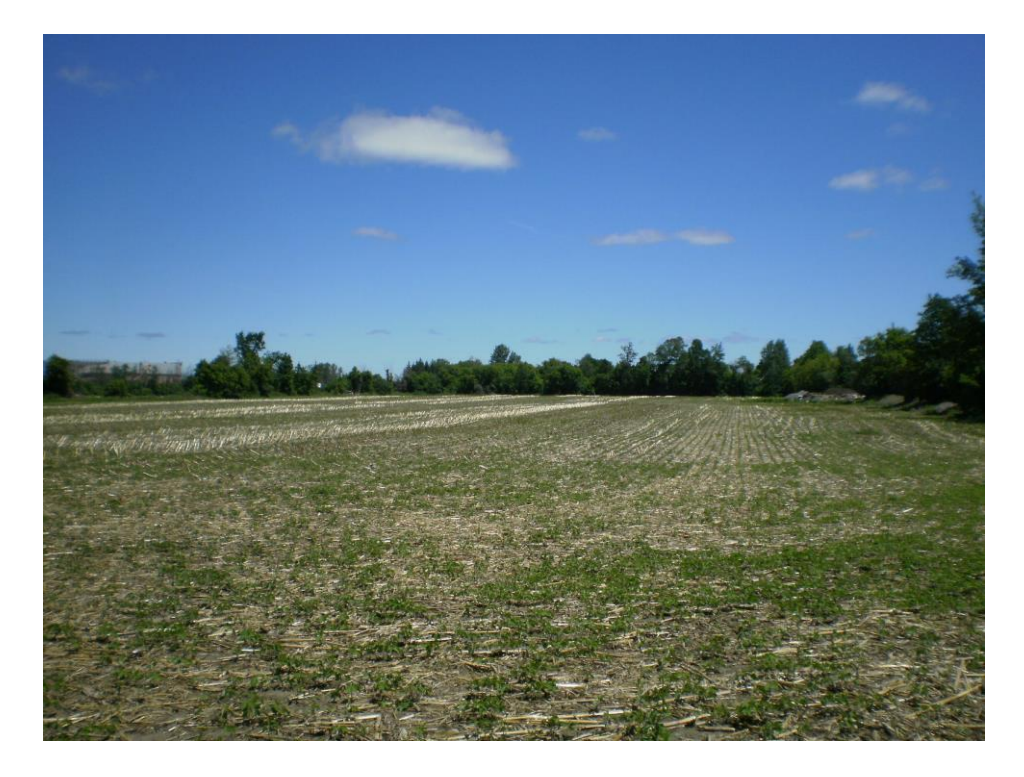
Photo 1 – Soybean fields dominate the east portion of the site. This is the south field with view looking east to cultural woodlands owned by others to the west of Huntmar Drive (June 10<sup>th</sup>, 2016)

Reed canary grass was dominant in portions of the cleared areas, along with Canada goldenrod, cow vetch, orchard grass, brome grass and common dandelion. Scattered remaining trees included white elms in the 20 - 30cm dbh range, red maples between 22 and 46cm dbh, green ash between 18 and 24cm dbh and trembling aspen up to 44cm dbh.