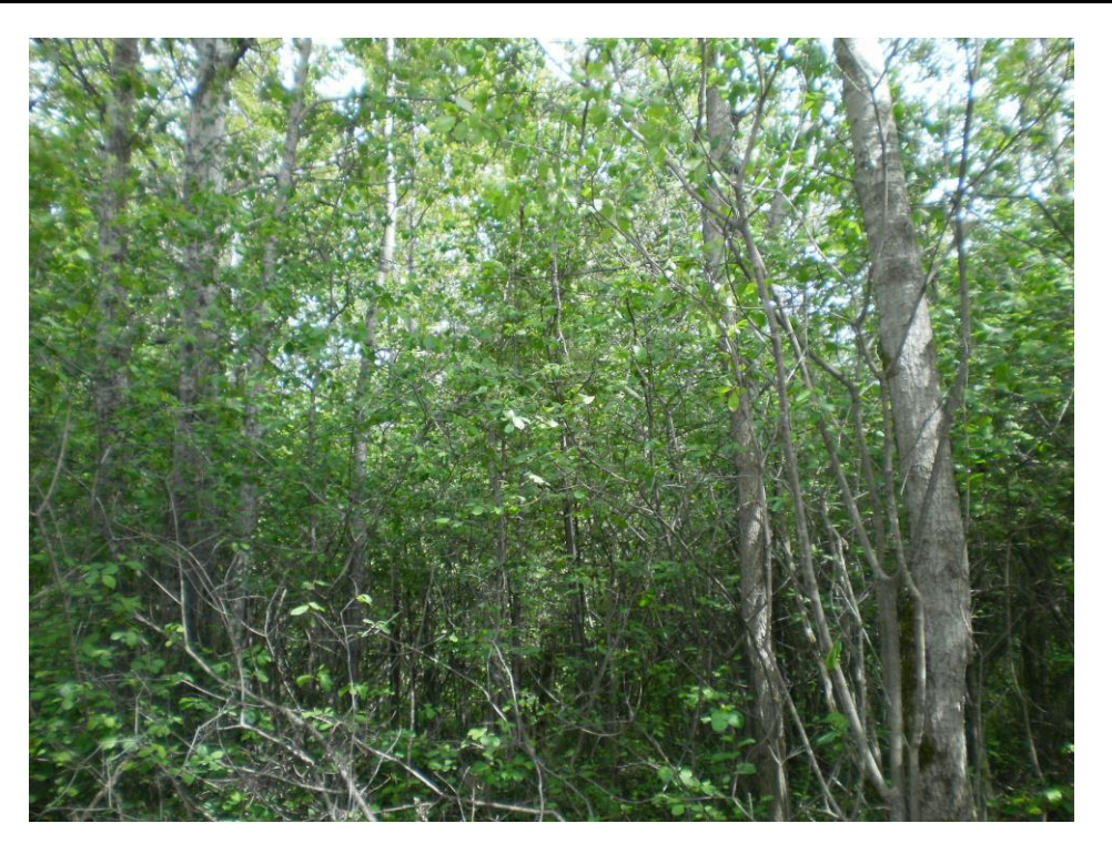
Photo 11 - Poplar deciduous forest in the northeast portion of the site (June 10<sup>th</sup>, 2016)