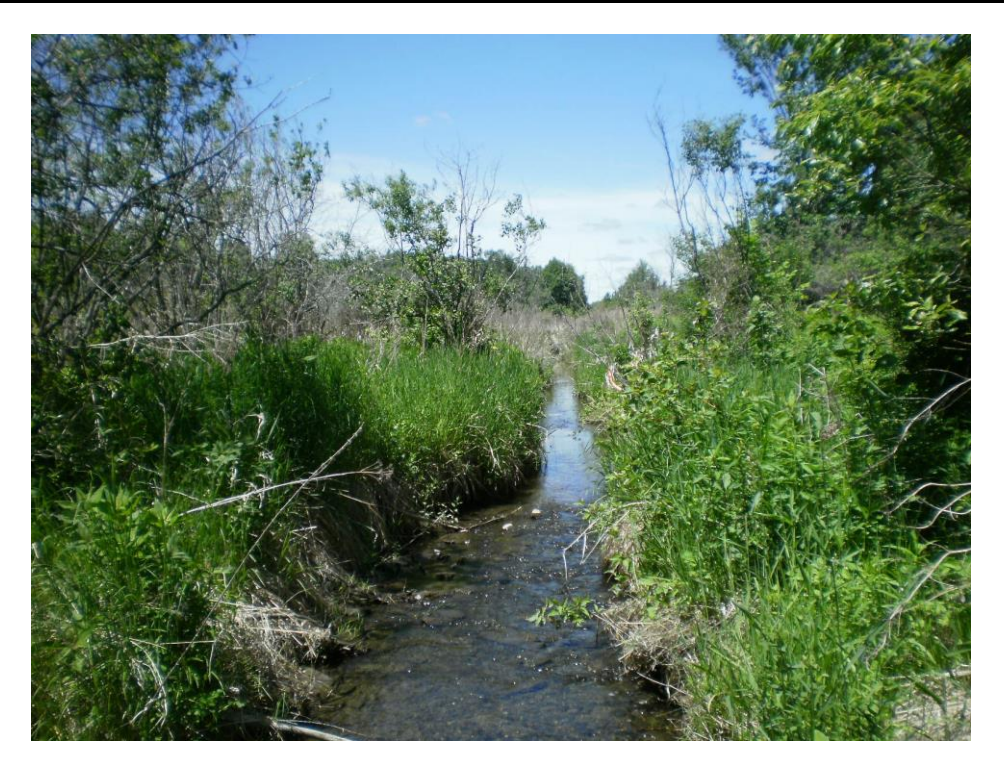
Photo 12 - Feedmill Creek along the unopened road allowance immediately west of the site. View looking north from west of the west-central property edge (June 10<sup>th</sup>, 2016)