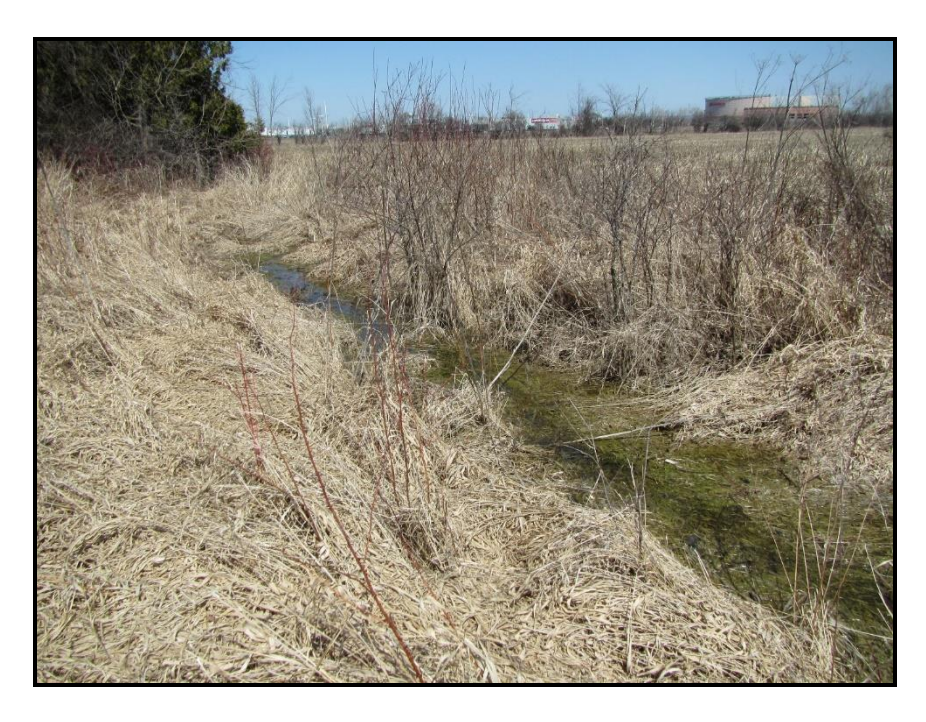
Photo 15 - East Swale on April 15<sup>th</sup> in the south-central portion of the site. View looking north