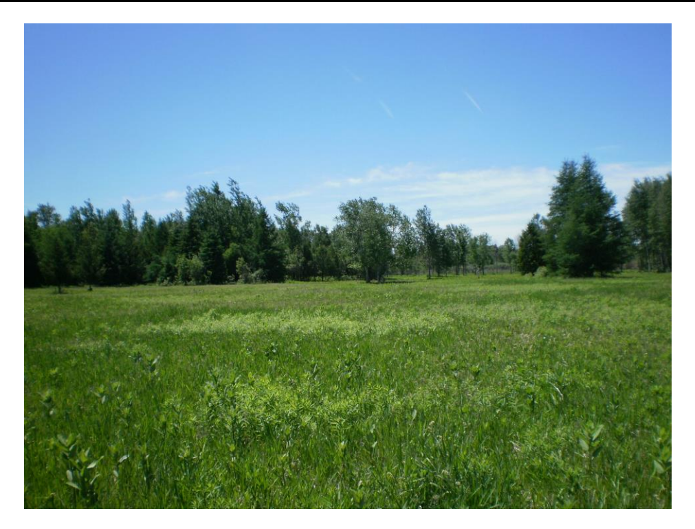
Photo 2 – Cultural meadow habitat in the central-west portion of the site. View looking west from central point of meadow (June 10<sup>th</sup>, 2016)