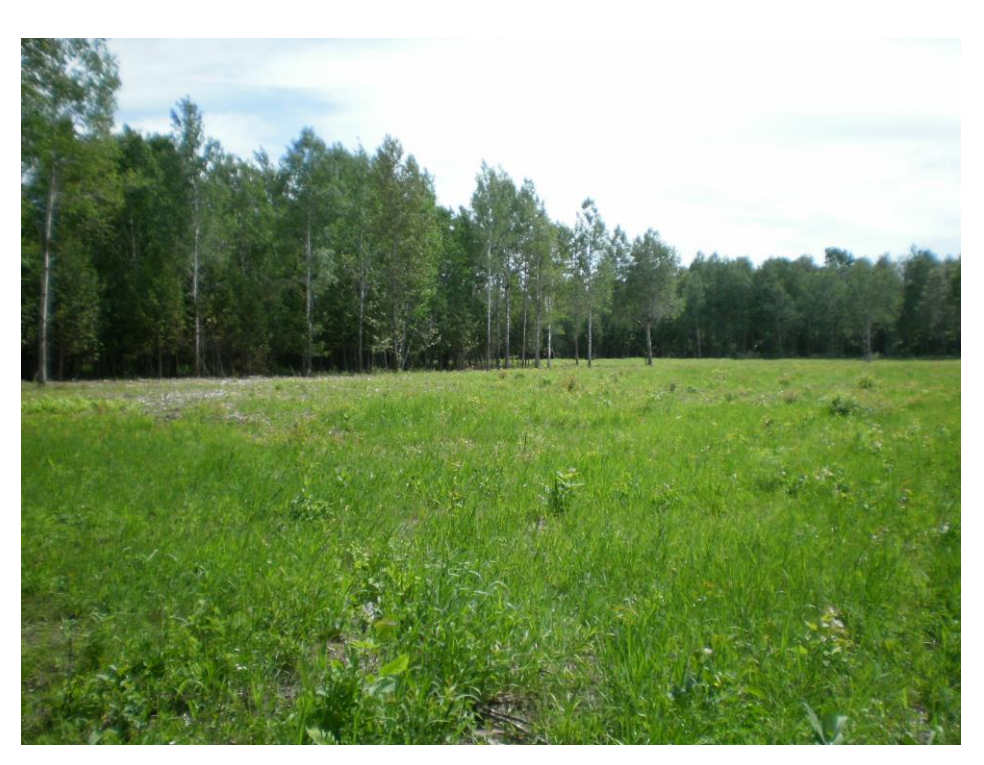
Photo 5 – Area of tree cutting in the north-central portion of the site. View looking southwest (June 10<sup>th</sup>, 2016)