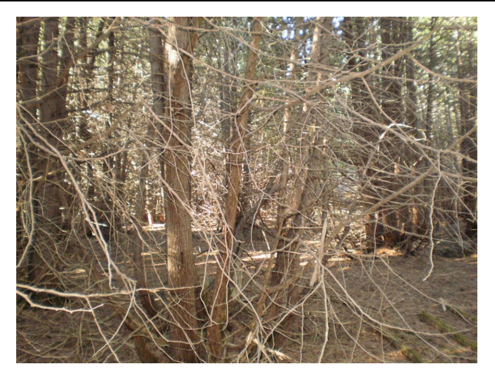
Photo 7 - Dense cedar forest in the northeast portion of the site with very limited understorey and ground cover (May 11<sup>th</sup>, 2016)