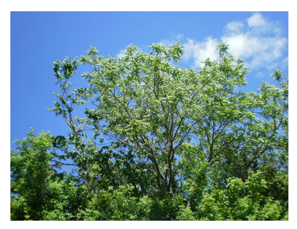
Photo 18 - 35cm dbh butternut in deciduous hedgerow in the south-central portion of the site was assessed as a healthy Category 2 tree

The ram's-head lady's-slipper orchid is found in mature coniferous forests or coniferous fens and swamps, habitat not present on or in the vicinity of the site. This orchid was not observed during the spring surveys.