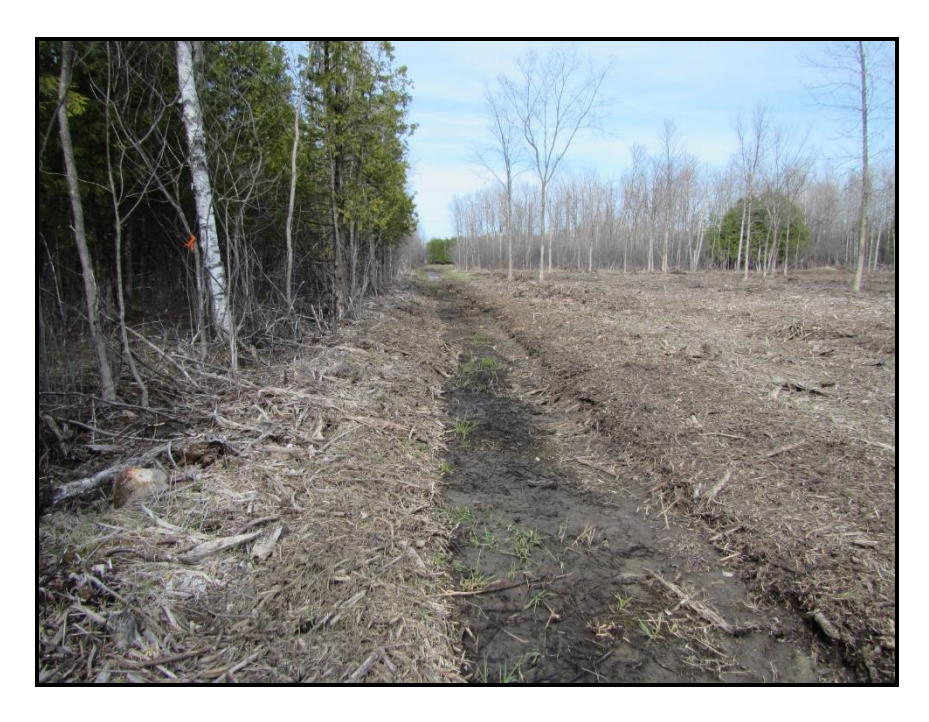
Photo 17 – Realigned dry northwest swale (April 29th, 2016) along the north edge of the site. View looking east, with areas of tree cutting to the right, south, and MTO lands to the left, north