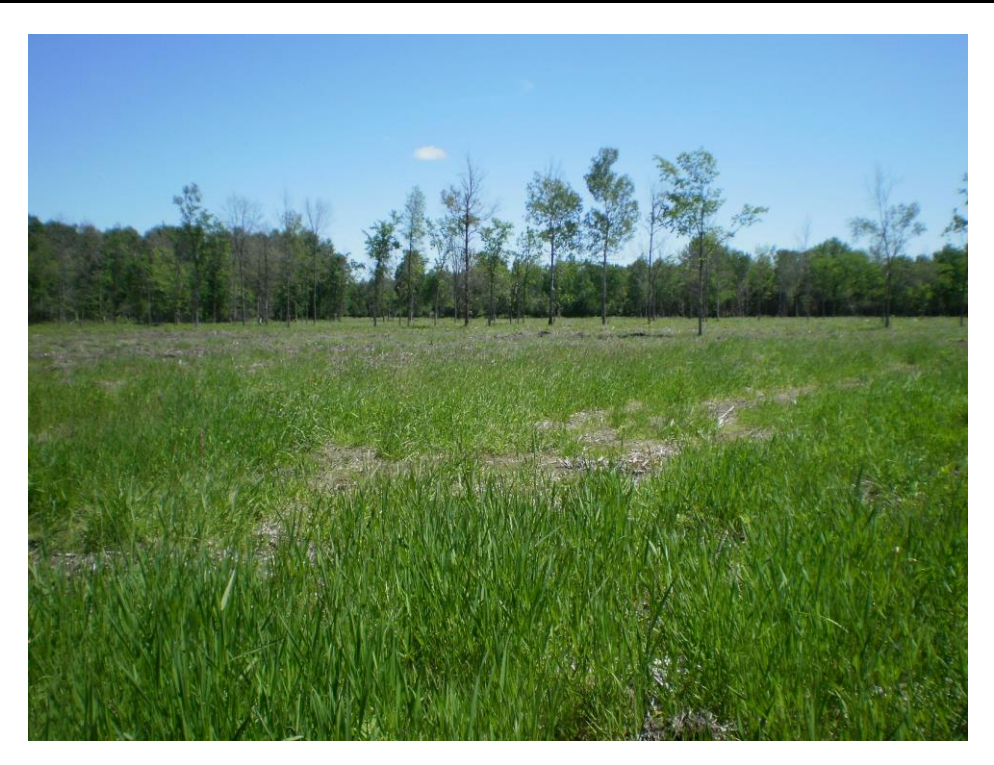
Photo 4 – Another area of tree cutting - this is in the northwest portion of the site, looking southeast from the northwest site boundary (June 10<sup>th</sup>, 2016)