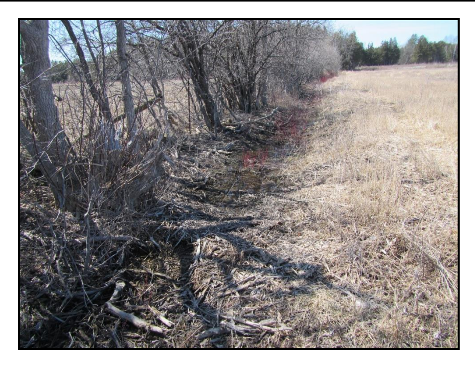
Photo 14 - East Swale on April 15<sup>th</sup> along the north edge of the east portion of the site. View looking east