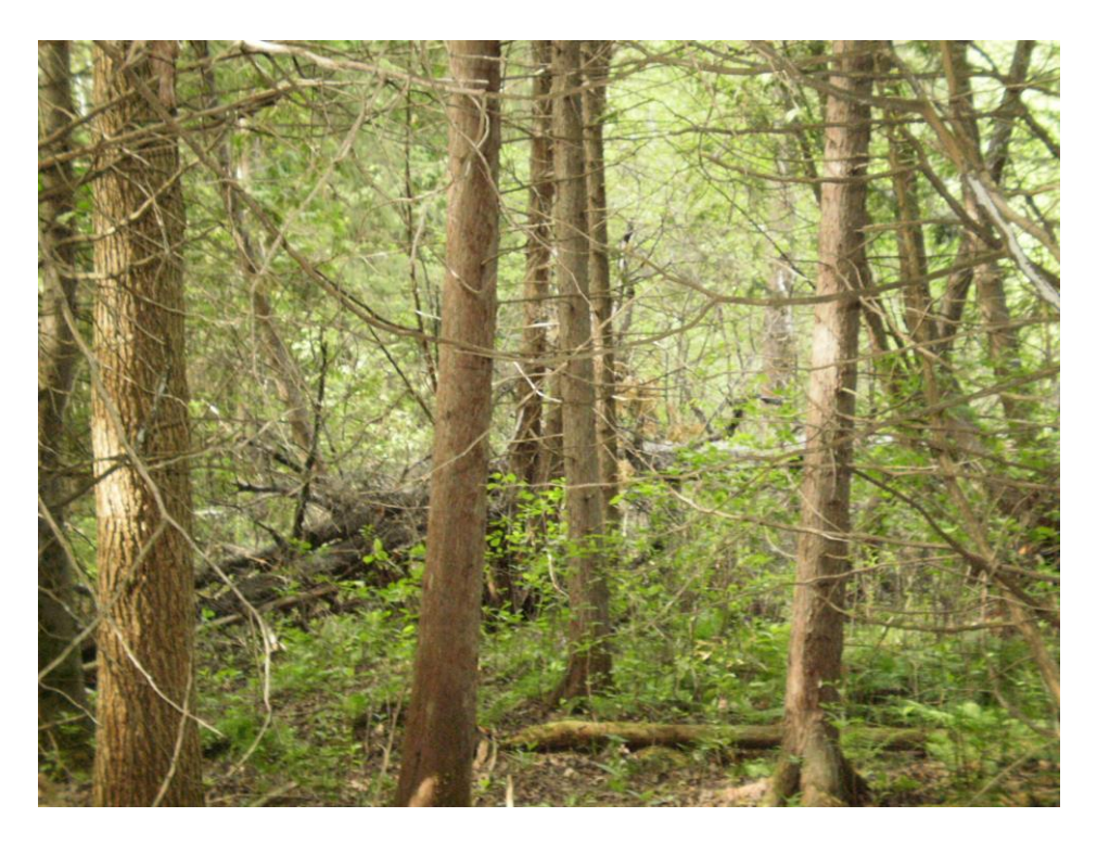
Photo 8 - Some wind throw in the cedar coniferous forest in the south-central portion of the site (June \ 10^{th}, \ 2016)