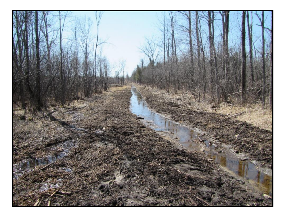
Photo 16 - Realigned northwest swale along the north edge of the site. View looking west, with section of remaining trees to the left, south, and MTO lands to the right, north (April 15<sup>th</sup>, 2016)