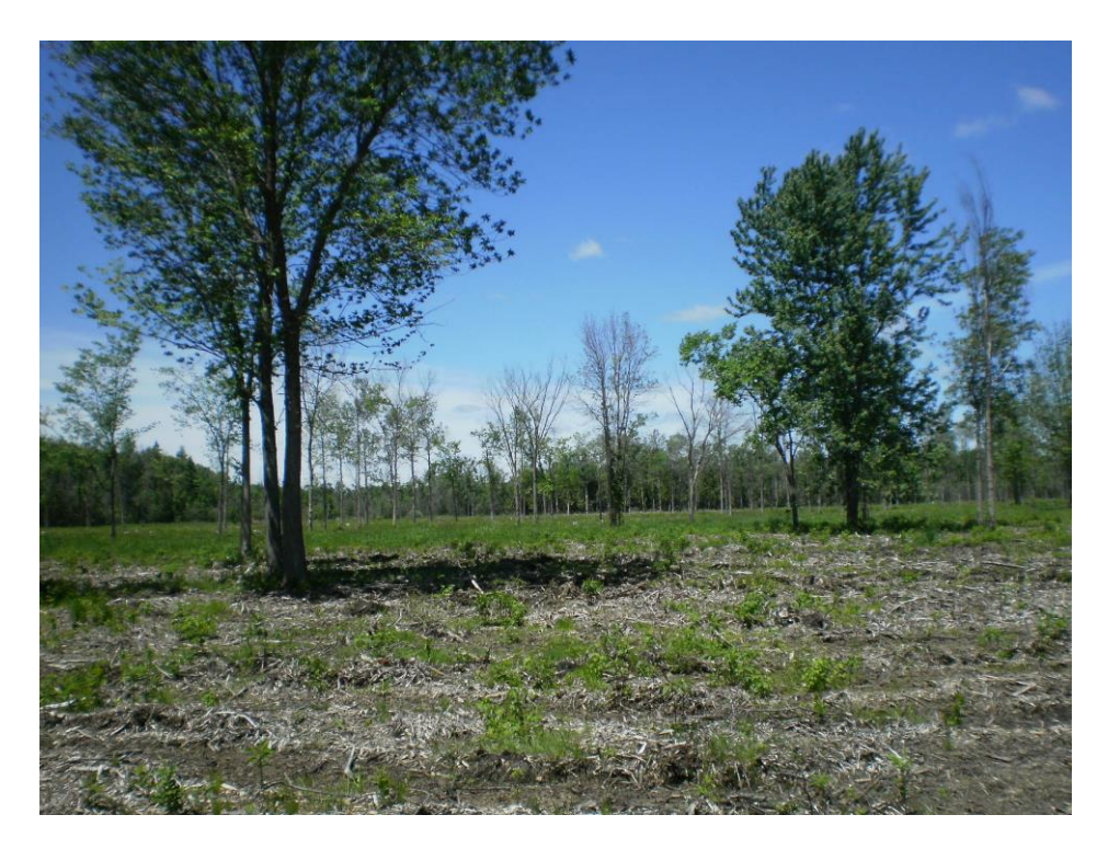
Photo 3 – Recently cut area in the central west portion of the site to the west of the meadow habitat. View looking north from the south edge of the cutting (June 10<sup>th</sup>, 2016)