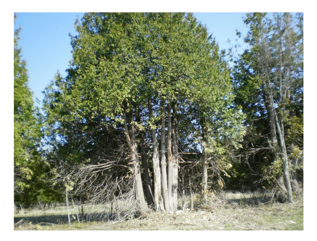
Photo 6 - White cedar in the short coniferous hedgerow in the north-central portion of the site

White ash, trembling aspen, white elm, sugar maple and apple are the dominant tree species in the deciduous hedgerows, identified as vegetation community 4 on Map 1. There is extensive evidence of damage from the emerald ash borer on many of the ash trees. The trees are generally intermediate-aged, with the largest ash, maples and poplars in the range of 25 - 45cm dbh. White cedars up to 45cm dbh are in a coniferous hedgerow in the north-central portion of the site (Photo 6). Common buckthorn, hawthorn, red raspberry, glossy buckthorn and gray dogwood shrubs are among the trees in the hedgerows.