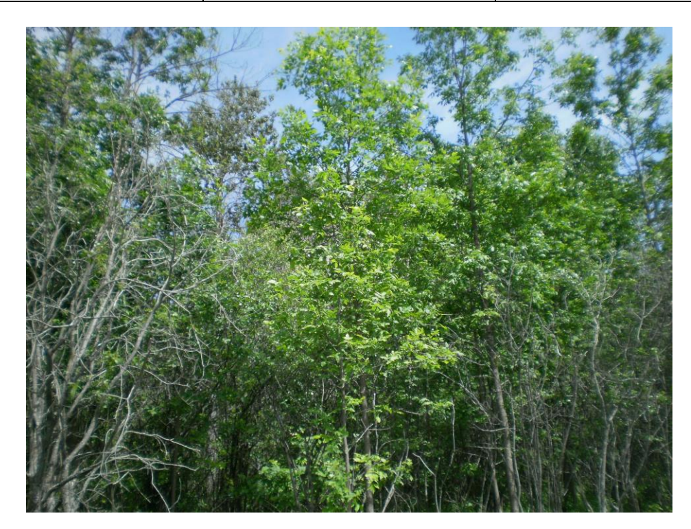
Photo 10 – Remaining young poplar deciduous forest with thick buckthorn in understorey in the northwest portion of the site (June 10<sup>th</sup>, 2016)

The following tree species are representative of the upland poplar deciduous forest: