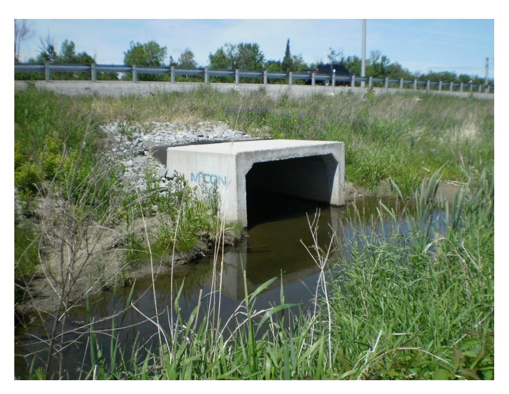
Photo 13 - Feedmill Creek as it enters the box culvert under Highway 417 north of the MTO lands. View looking downstream, northeast (June 10<sup>th</sup>, 2016)