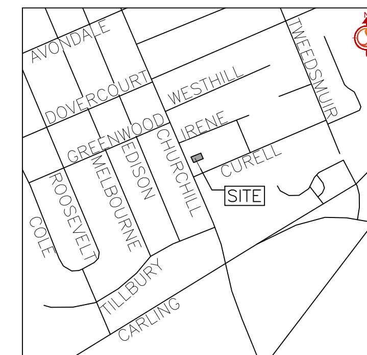
KEY PLAN N.T.S.