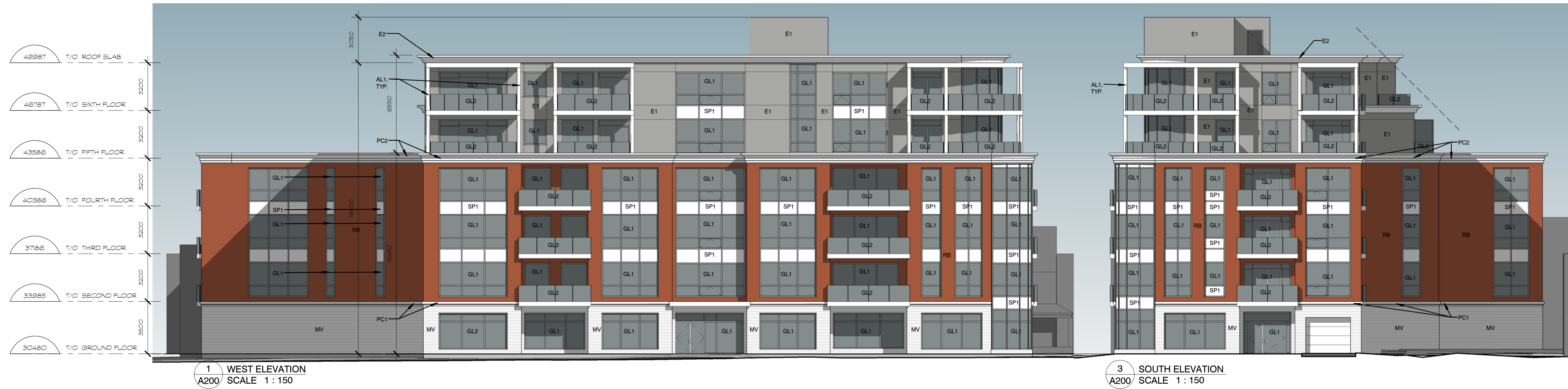
1 WEST ELEVATION A200 SCALE 1 : 150

Contractor shall check and verify all dimensions on site and report any discrepancies to the Architect before proceeding.