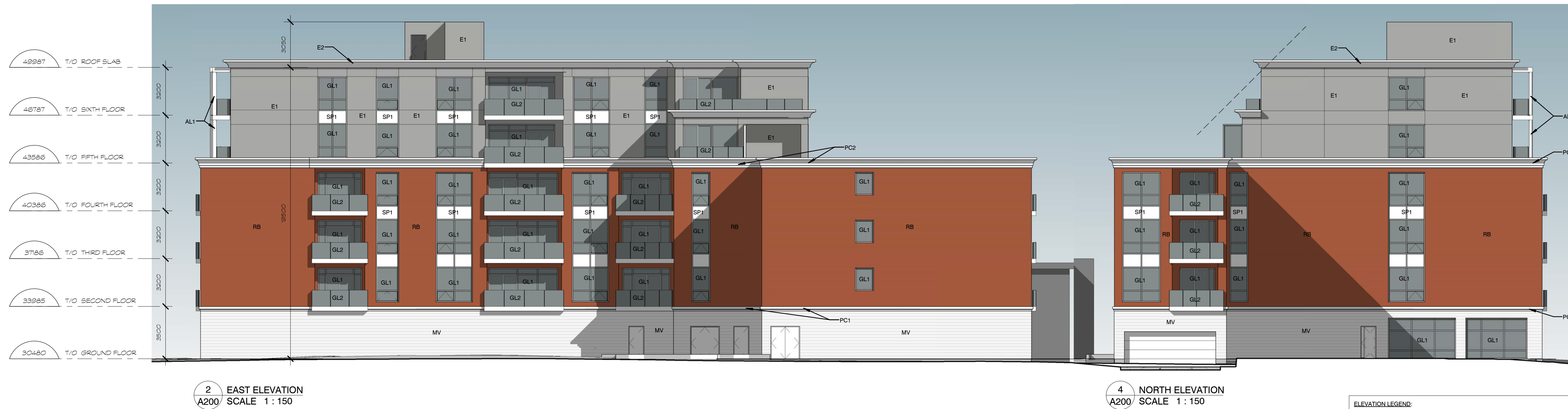
2 EAST ELEVATION A200 SCALE 1 : 150