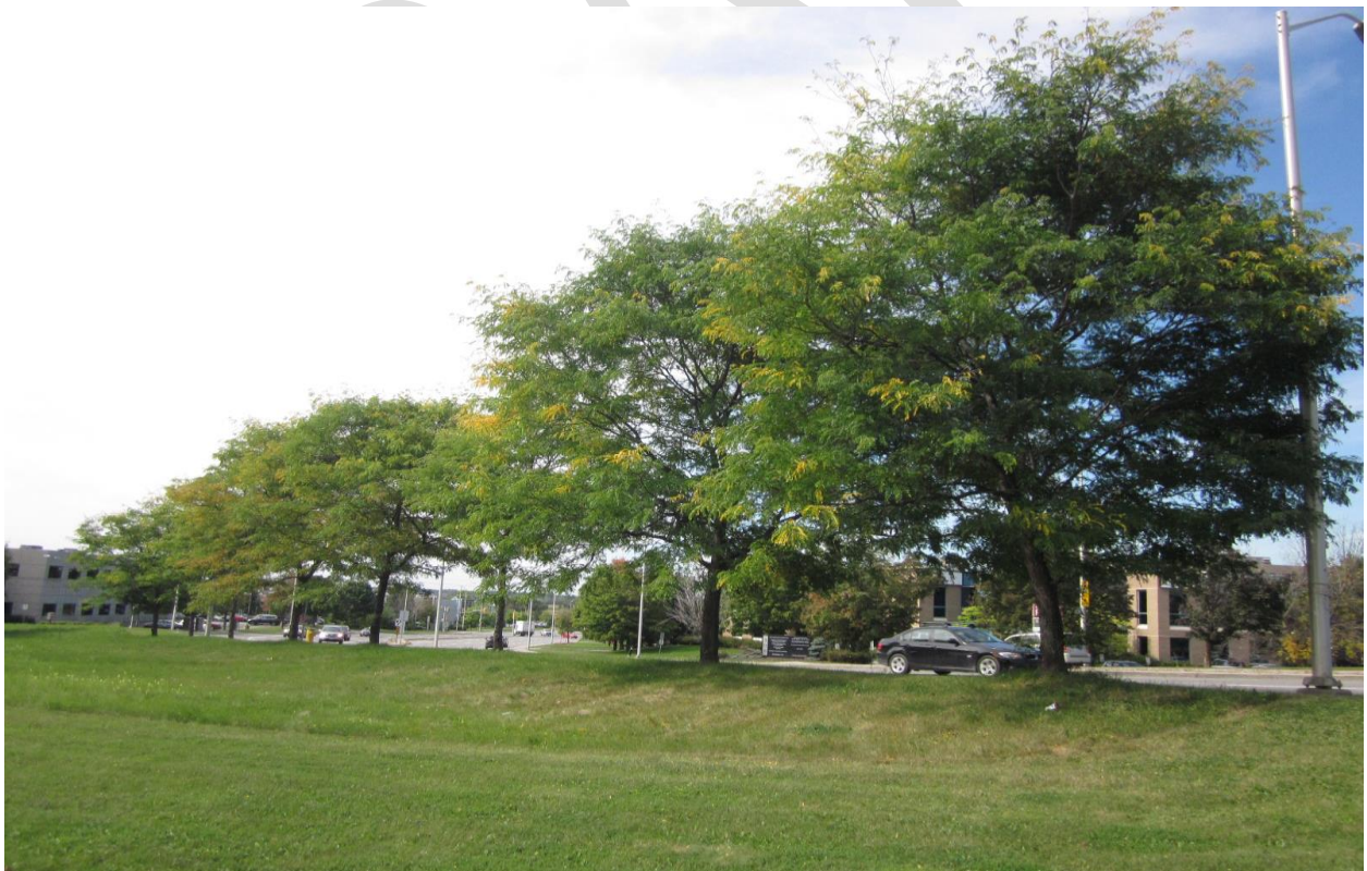
Picture 2. Honey-locust trees 5 through 12 at 301 Palladium Drive.