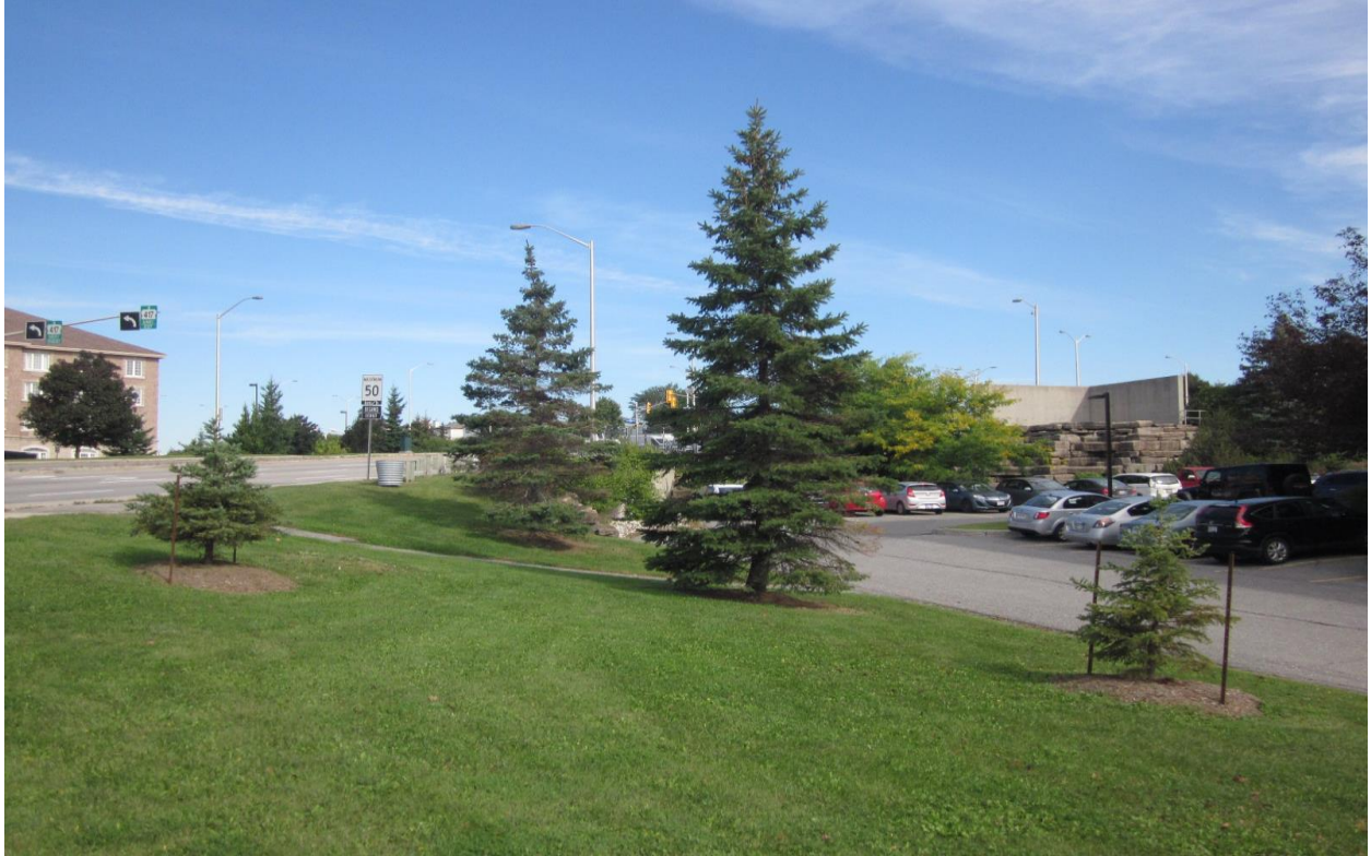
Picture 1. Spruce trees 1 through 4 at 301 Palladium Drive.