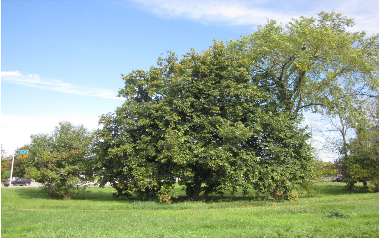
Picture 3. Trees 13, 14 and 15 at 301 Pallidum Drive.