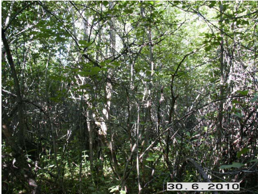
Photo 5 – Young poplar deciduous forest with thick buckthorn in understory

grape coverage is extensive on many trees and shrubs. Canada goldenrod, tall goldenrod, poison ivy, wild grape, common dandelion, field horsetail, daisy fleabane, white snakeroot, Virginia creeper, enchanter's nightshade, tall meadow-rue, blue violet, tall buttercup, common burdock and sensitive fern are representative of the ground flora generally dominated by non-native and/or invasive species.