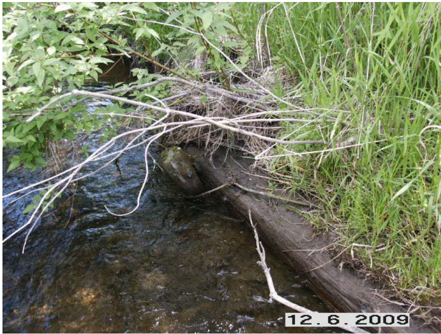
Photo 9 – Deflectors installed and shrub plantings along Feedmill Creek in east portion of site as part of 1990s compensation work. Note coarse exposed substrate