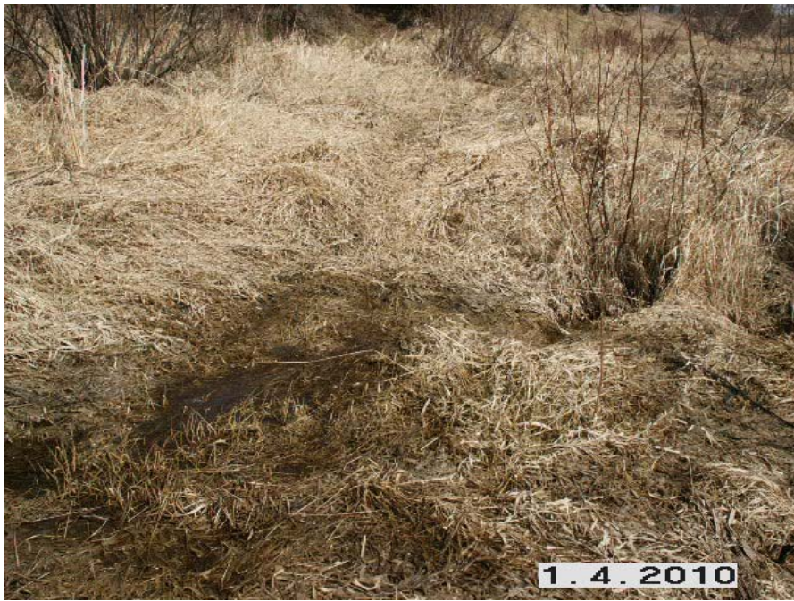
Photo 11 – No definition of tributary to Feedmill Creek in east portion of the site, east of westbound off-ramp from Highway 417. View looking east