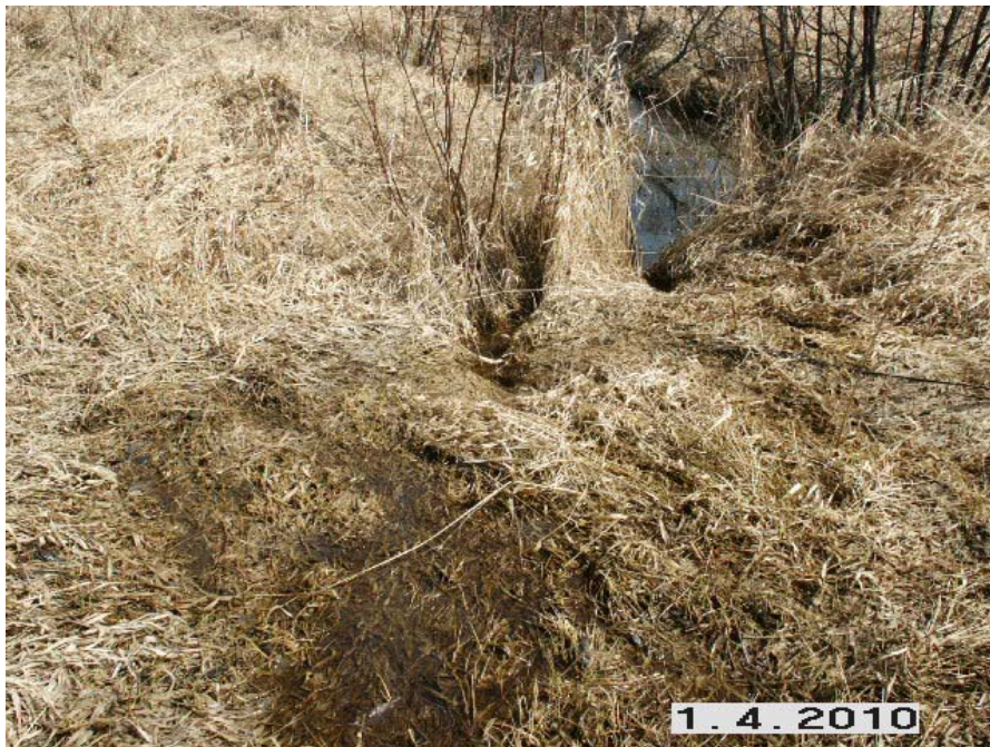
Photo 12 – Tributary to Feedmill Creek in east portion of the site, east of westbound off-ramp from Highway 417, with Feedmill Creek in the background. View looking southeast