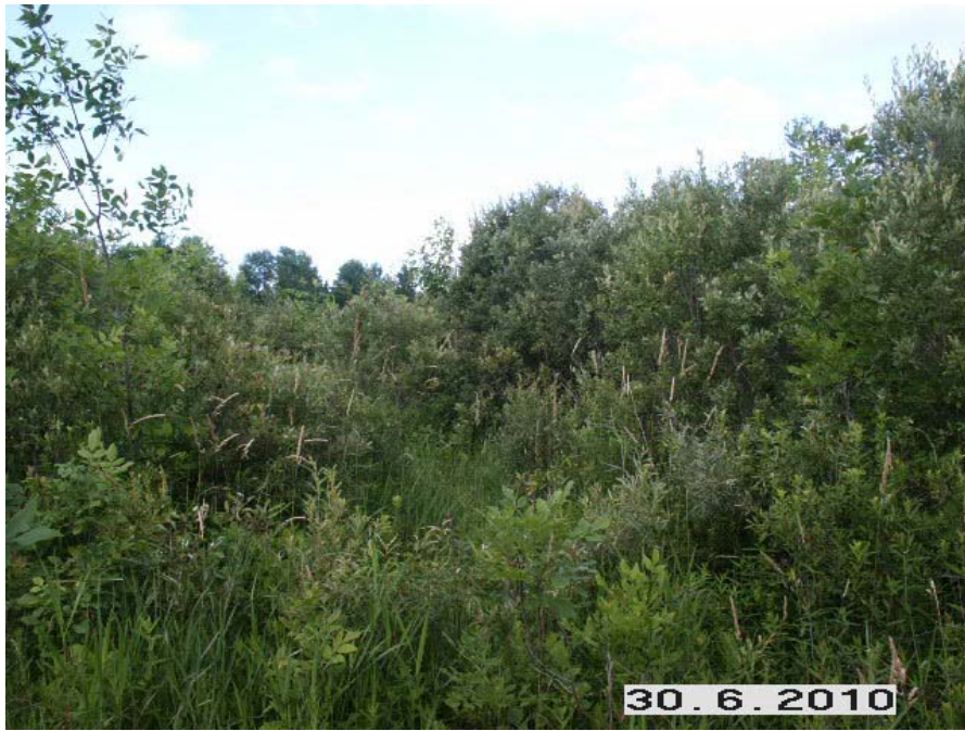
Photo 2 – Cultural thicket habitat in the southwest portion of the site