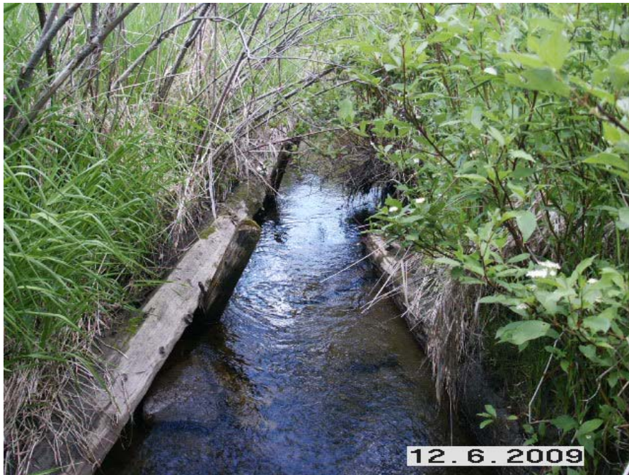
Photo 10 – Deflectors installed and shrub plantings along Feedmill Creek in east portion of site as part of 1990s compensation work. Note boulders, coarse substrate and good shrub growth