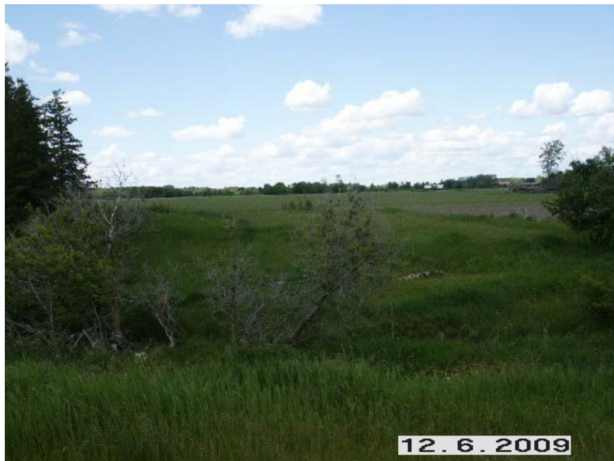
Photo 14 – Approach for proposed road crossing of Feedmill Creek in east portion of site.

Approvals will be required from Mississippi Valley Conservation for the road crossing of Feedmill Creek in the southeast portion of the site. Photo 14 below shows a preferred crossing location that would minimize the removal of woody vegetation in the approaches to the crossing. The crossing would also need to avoid, relocate or replace the plantings and other stream enhancement measures completed along this reach of Feedmill Creek. The road and associated culvert should be as narrow as possible to minimize potential impacts on the creek habitats.