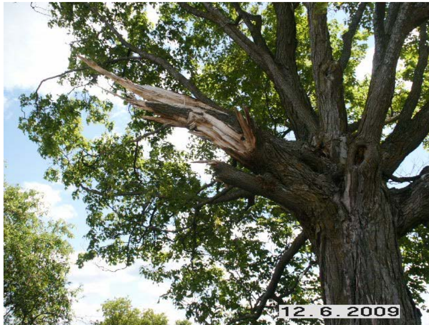
Photo 4 – Mature sugar maple at end of hedgerow in southeast portion of site.