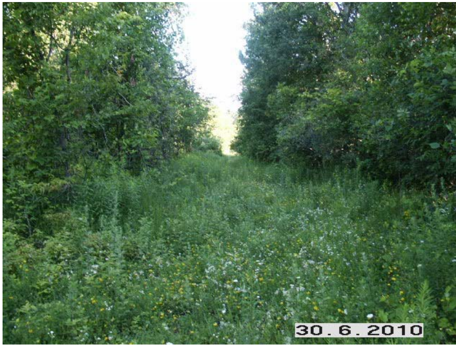
Photo 15 – Old access lane along central and north portion of west edge of site. View looking north, with west edge of site on right