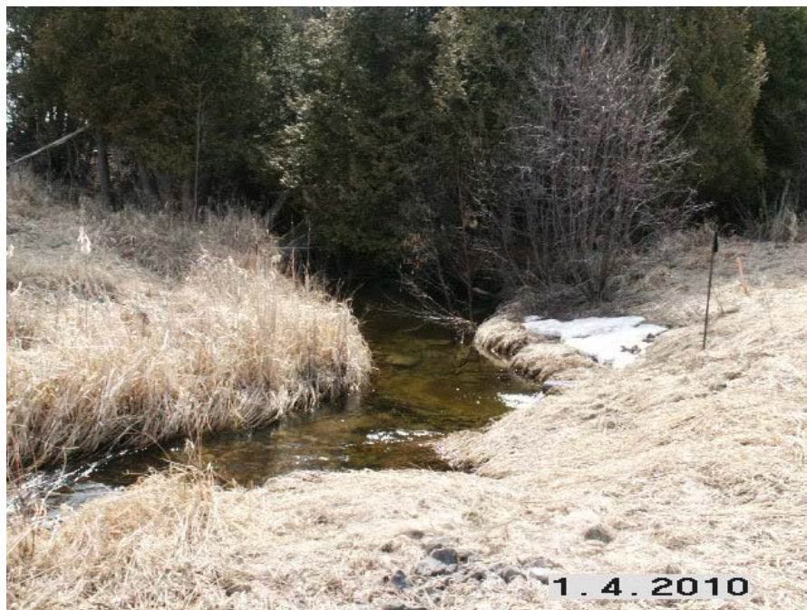
Photo 8 – Feedmill Creek emerging from the mixed forest just west of Palladium Drive. View looking southwest

A west to east channel to the north of the site parallels the north site boundary and enters Feedmill Creek via a roadside swale on the west side of Huntmar Drive. The CRWSS did not consider any of the on-site channels leading to Feedmill Creek to be fish habitat and did not identify habitat protection for these channels.