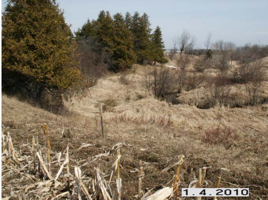
Photo 3 – Feedmill Creek corridor in the east portion of the site. Note corn to edge of valley top-of-slope as indicated by stake. View looking east