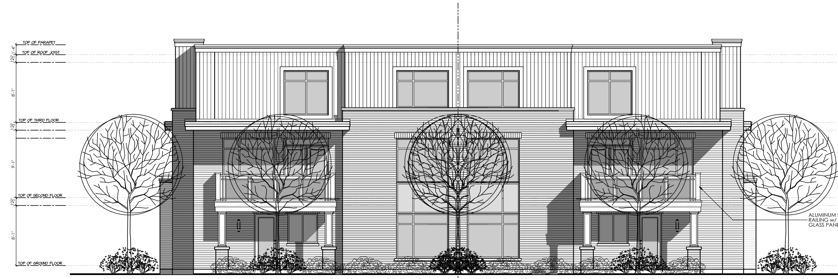
BLOCK - 1 SOUTH ELEVATION (STREET)