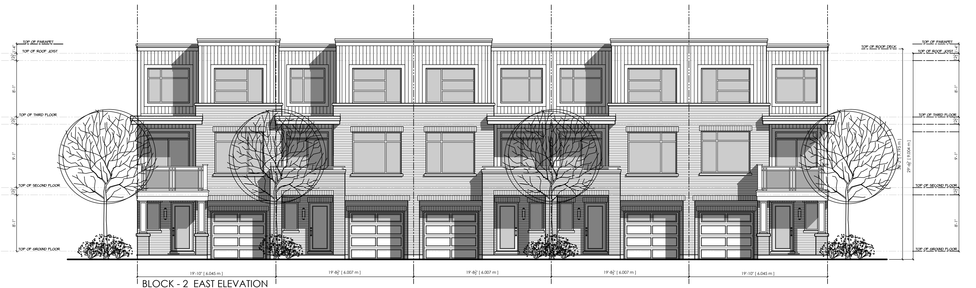
BLOCK - 2 EAST ELEVATION