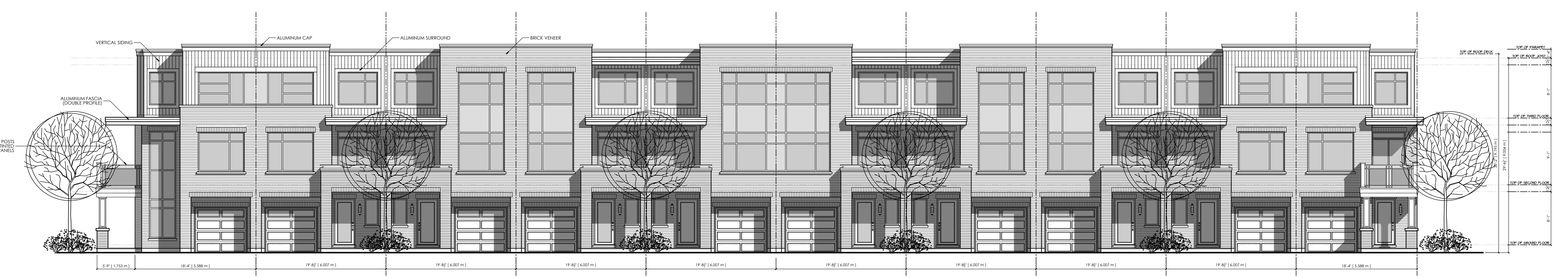
BLOCK - 1 EAST & WEST ELEVATION