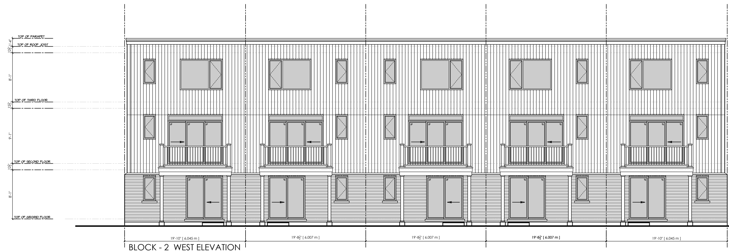
BLOCK - 2 WEST ELEVATION