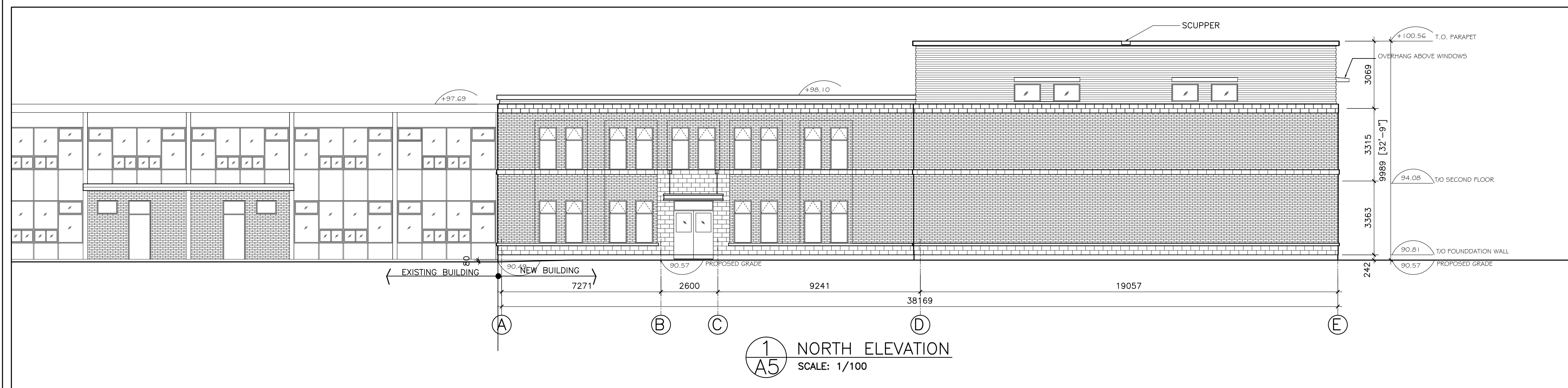
1 NORTH ELEVATION SCALE: 1/100

PROPOSED ADDITION OTTAWA ISLAMIC SCHOOL 10 CORAL AVE. OTTAWA, ONT. K2E 5Z6 (613) 727-5066 Ext. 21 www.ottawaislamicsschool.org