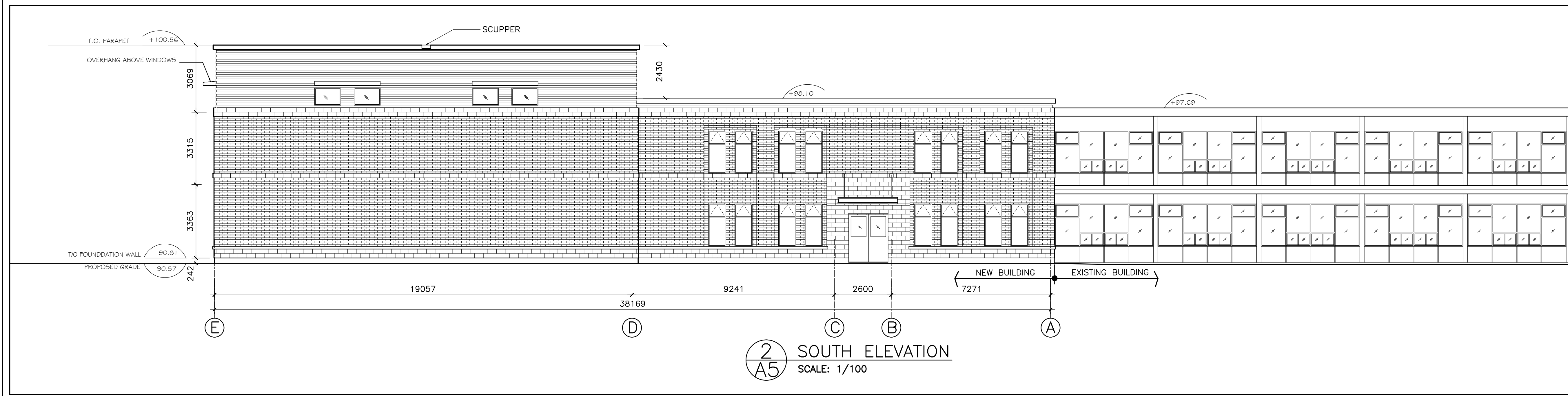
2 SOUTH ELEVATION SCALE: 1/100