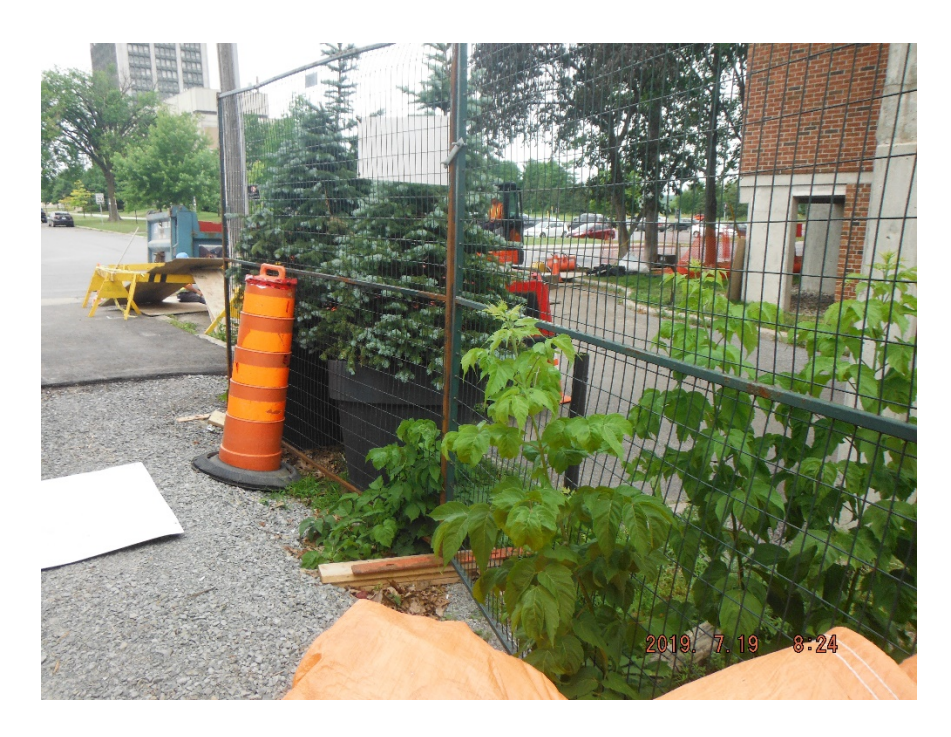
Photo 1 Potted blue spruce on the northern adjacent lands (July 19, 2019)

The only nearby trees were situated on the opposite site of the northern fence. These consisted of a few small Manitoba maple, staghorn sumac and blue spruce. All were <10 cm in dbh. The blue spruce were in pots and would not be affected by on-site work activities.