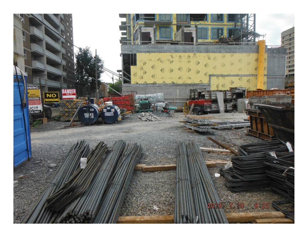
Photo 3 Looking south from the east central portion of the subject lands (July 19, 2019)