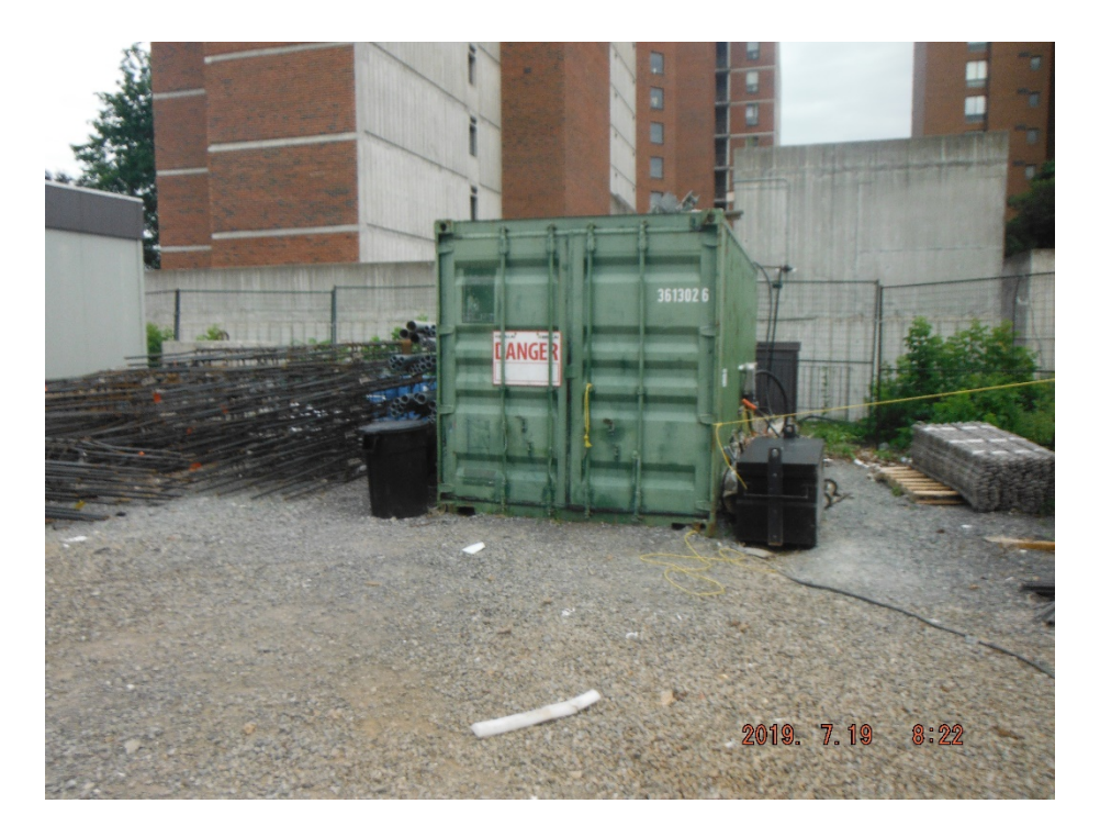
Photo 4 Looking north from the east central portion of the subject lands (July 19, 2019)