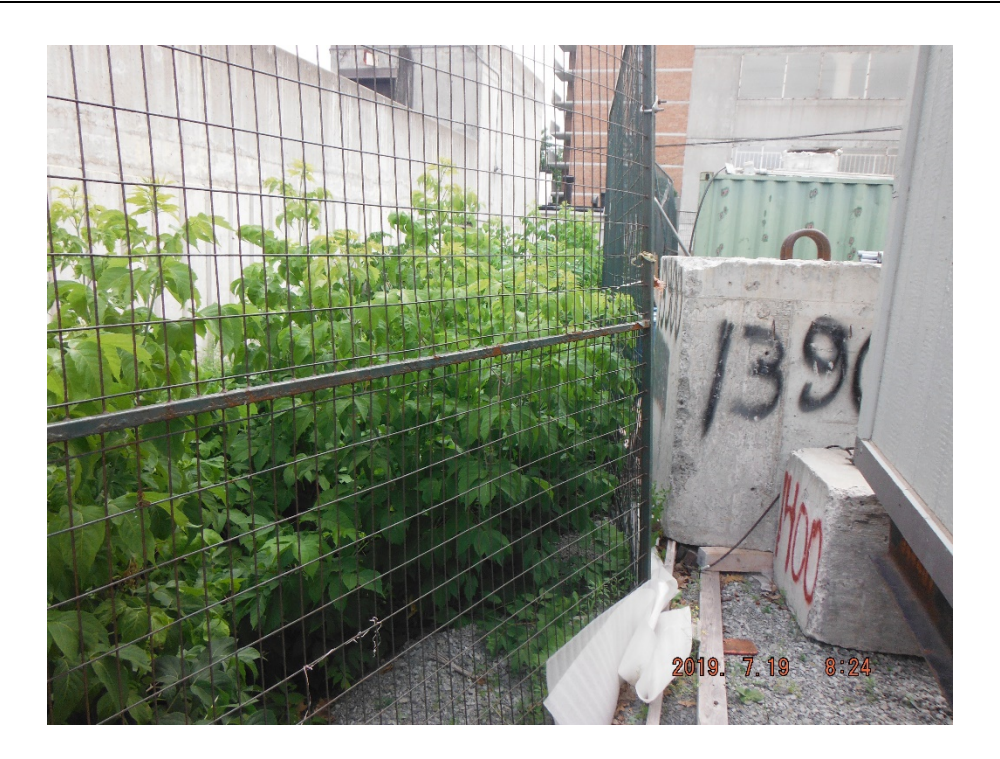
Photo 2 Manitoba maple and staghorn sumac on the northern adjacent lands (July 19, 2019)