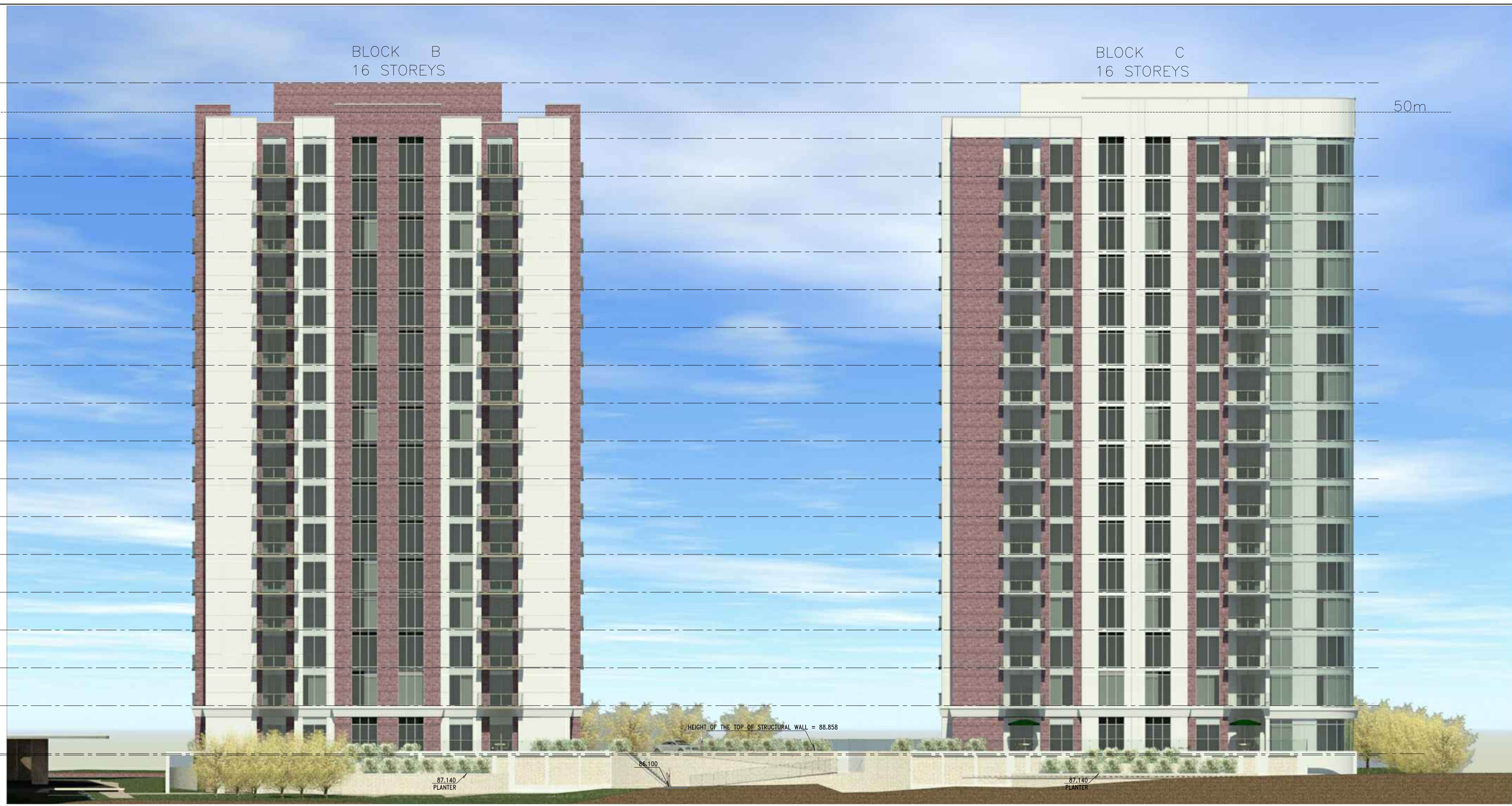
1 ELEVATION WEST 1:175