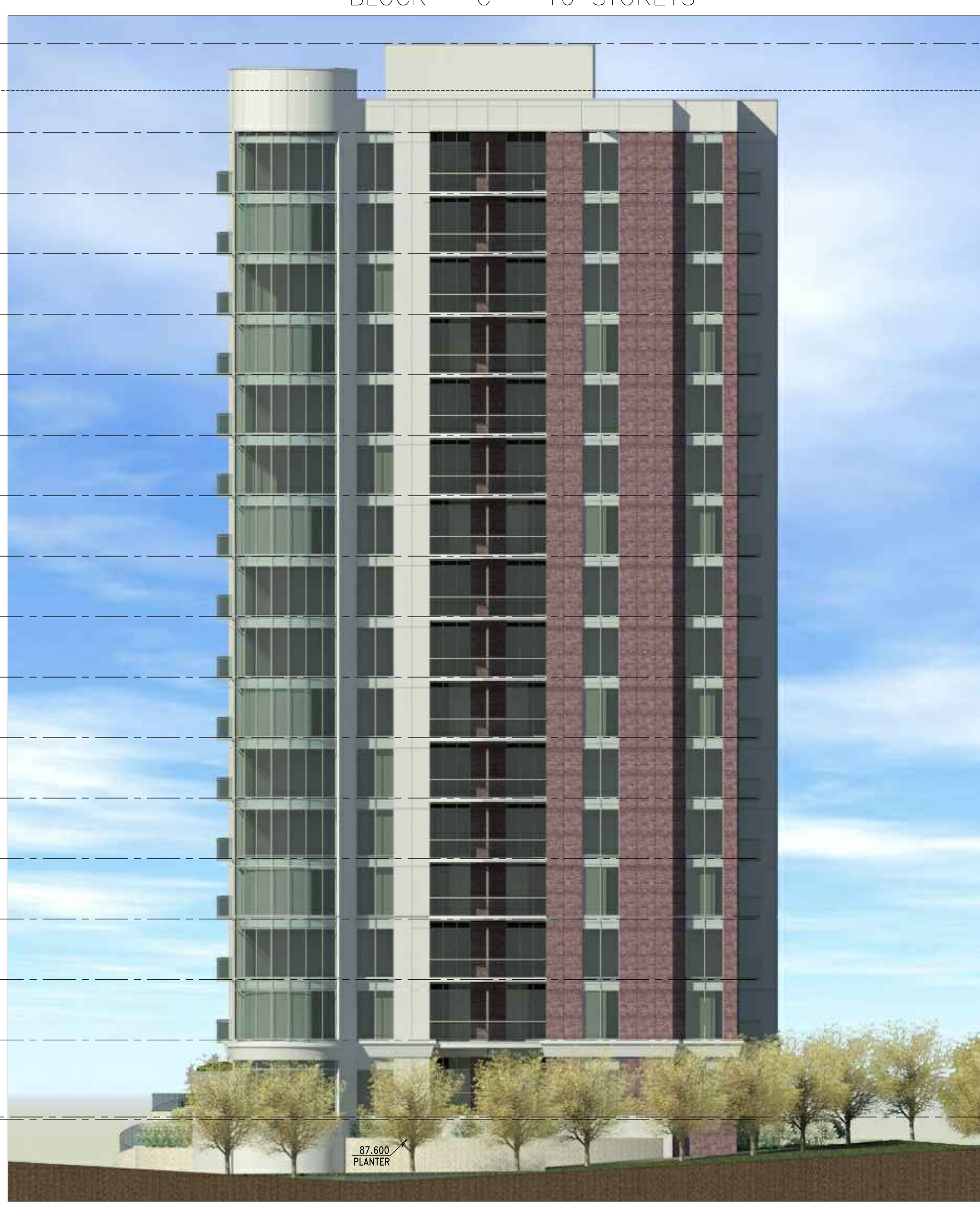
2 ELEVATION SOUTH 1:175