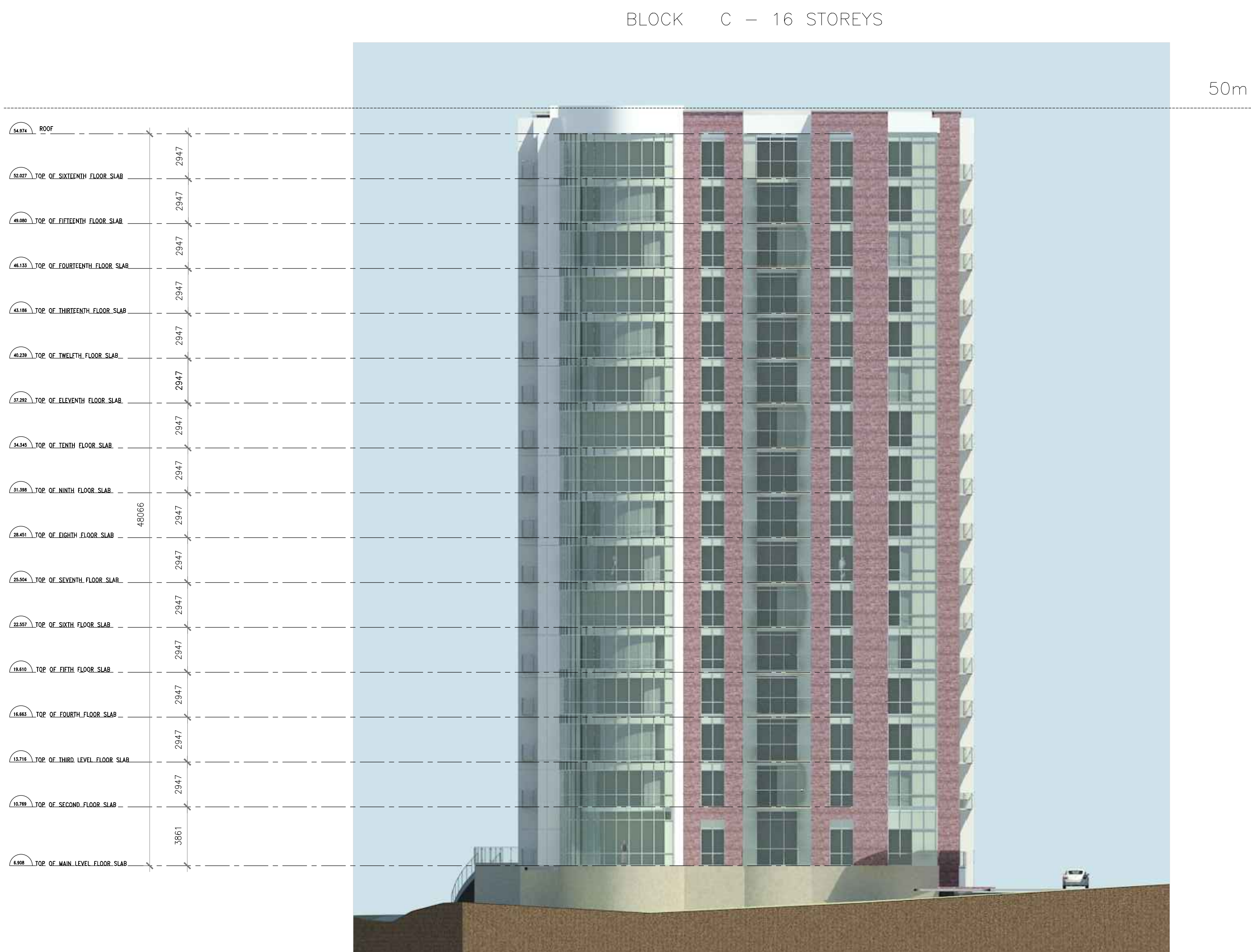
2 ELEVATION SOUTH 1:175