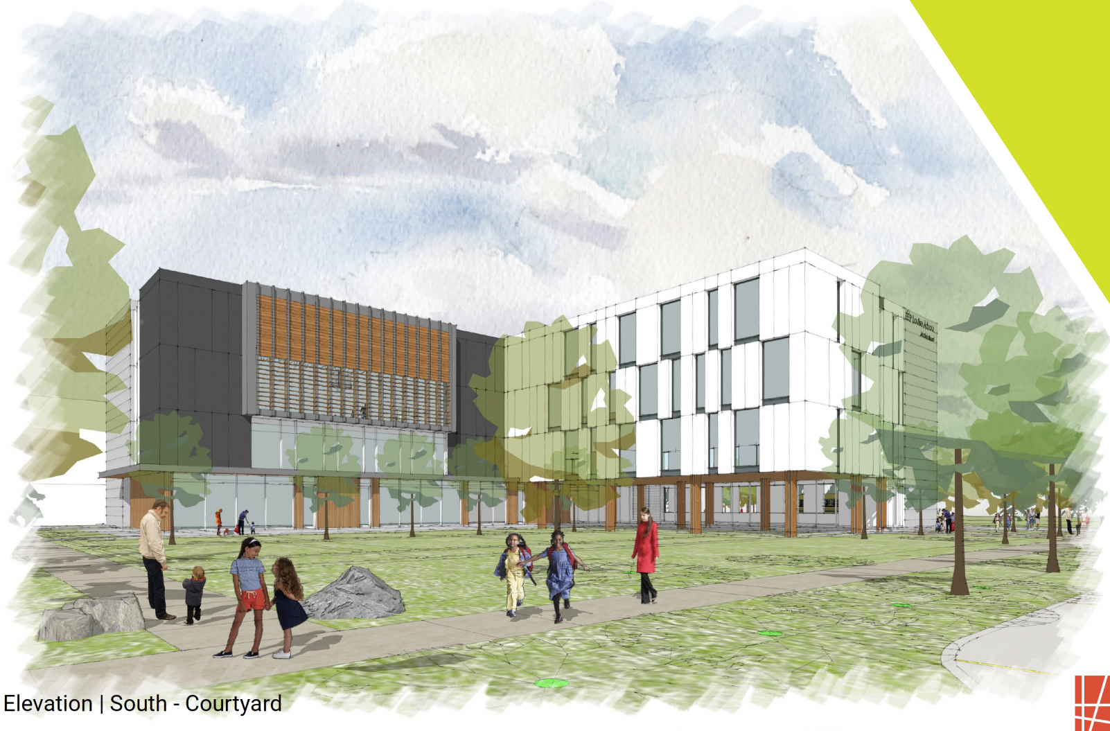
Elevation | South - Courtyard

REPORT DATE: June 20 2025 | REVISION: 2 REPORT PREPARED FOR: CÉPEO PREPARED BY: Q9 PLANNING + DESIGN INC.