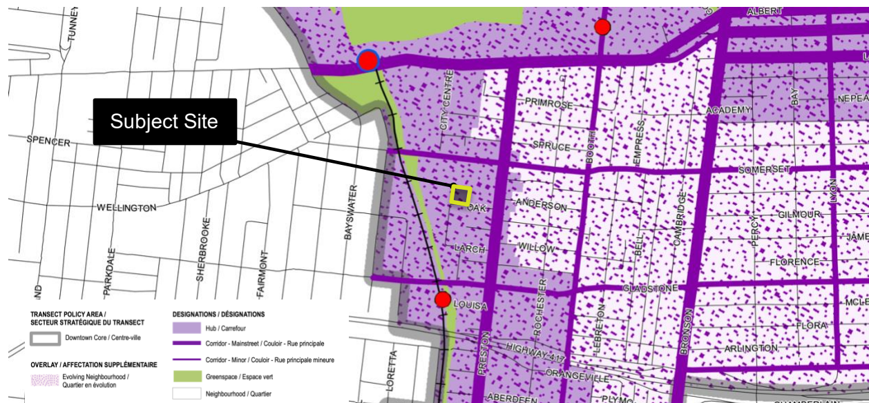
Figure 1: Extract of Schedule B1, Downtown Core Transect, City of Ottawa Official Plan

The site, 45 Oak Street, is designated Hub in the City of Ottawa Official Plan as shown on Schedule B1 – Downtown Core Transect .