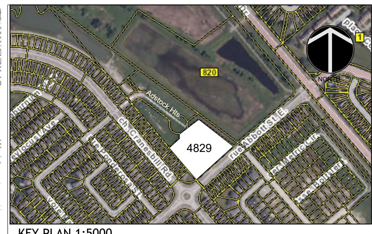
KEY PLAN 1:5000