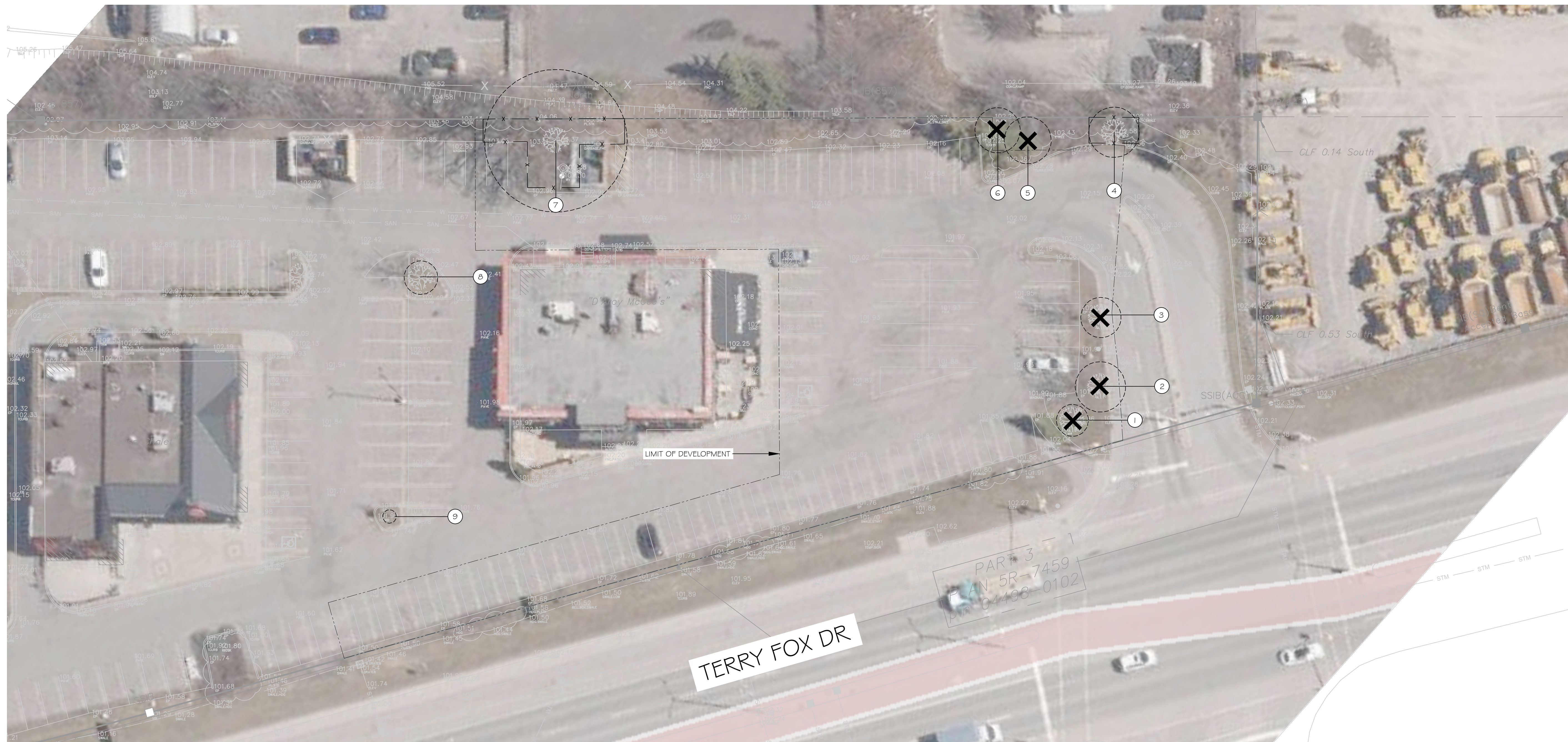
MAP #1 CURRENT VEGETATION