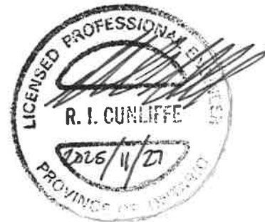
Structural Engineer's Seal