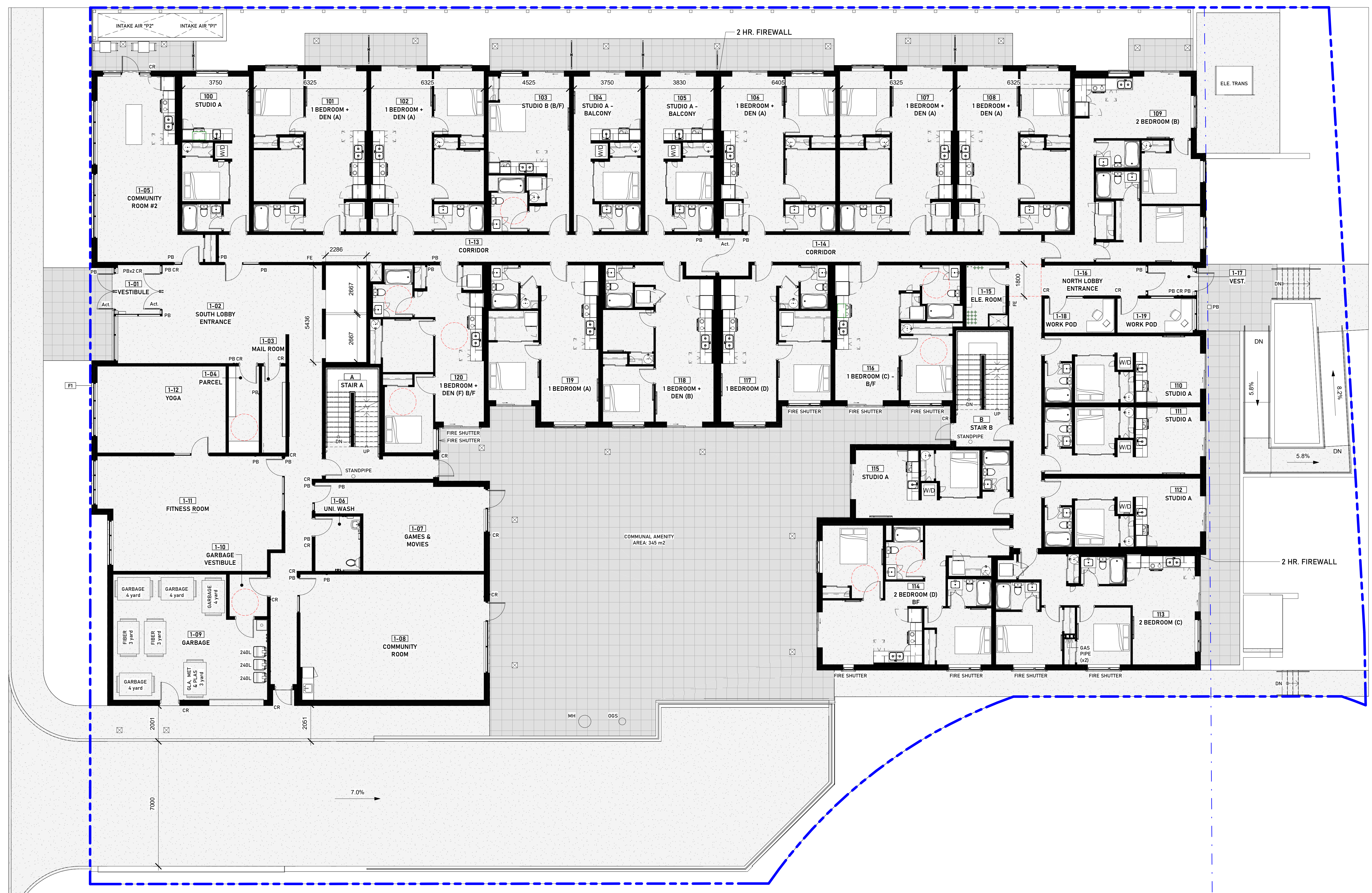
1 1st FLOOR LEVEL 1:100

Scale: 1:100 Drawn By: JV Checked By: JB Date: 2026-05-05 10:31:34 AM Sheet No. A2-1