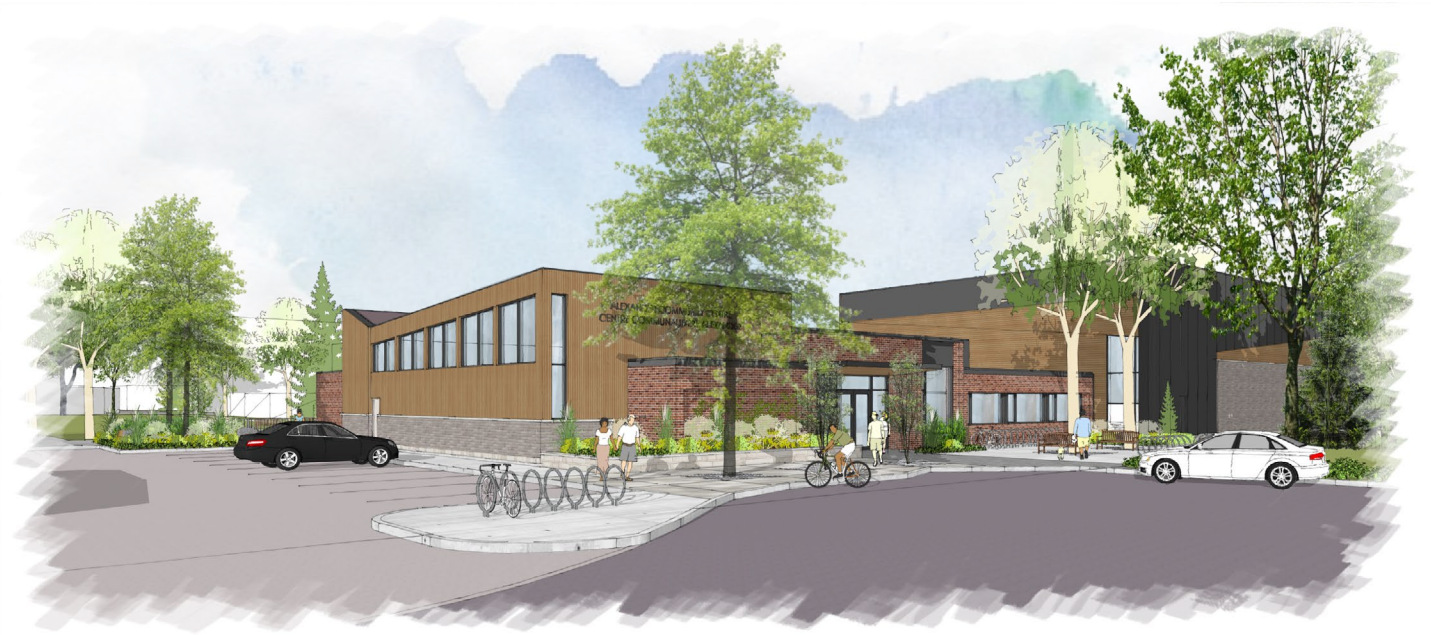
View from Silver Street