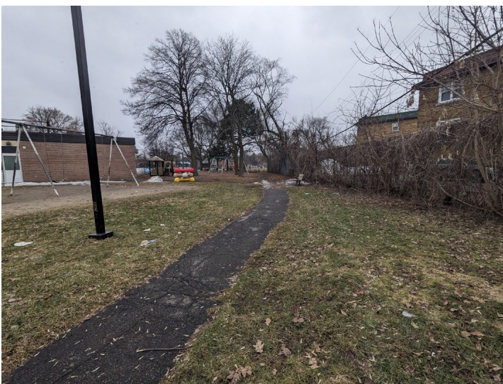
View along north property line, adjacent to Dover Crescent

In accordance with the City of Ottawa Official Plan initiatives and directives, the Alexander Community Centre Expansion community improvement project contributes to further opportunities to create and enhance healthy and walkable neighbourhoods. As illustrated on the site plan, existing pathways will be retained, reinstated and expanded to strengthen the neighbourhood pedestrian network and connectivity to the community centre, transit services, local schools (W.E. Gowling Public School) and retail and commercial services along Merivale Road.