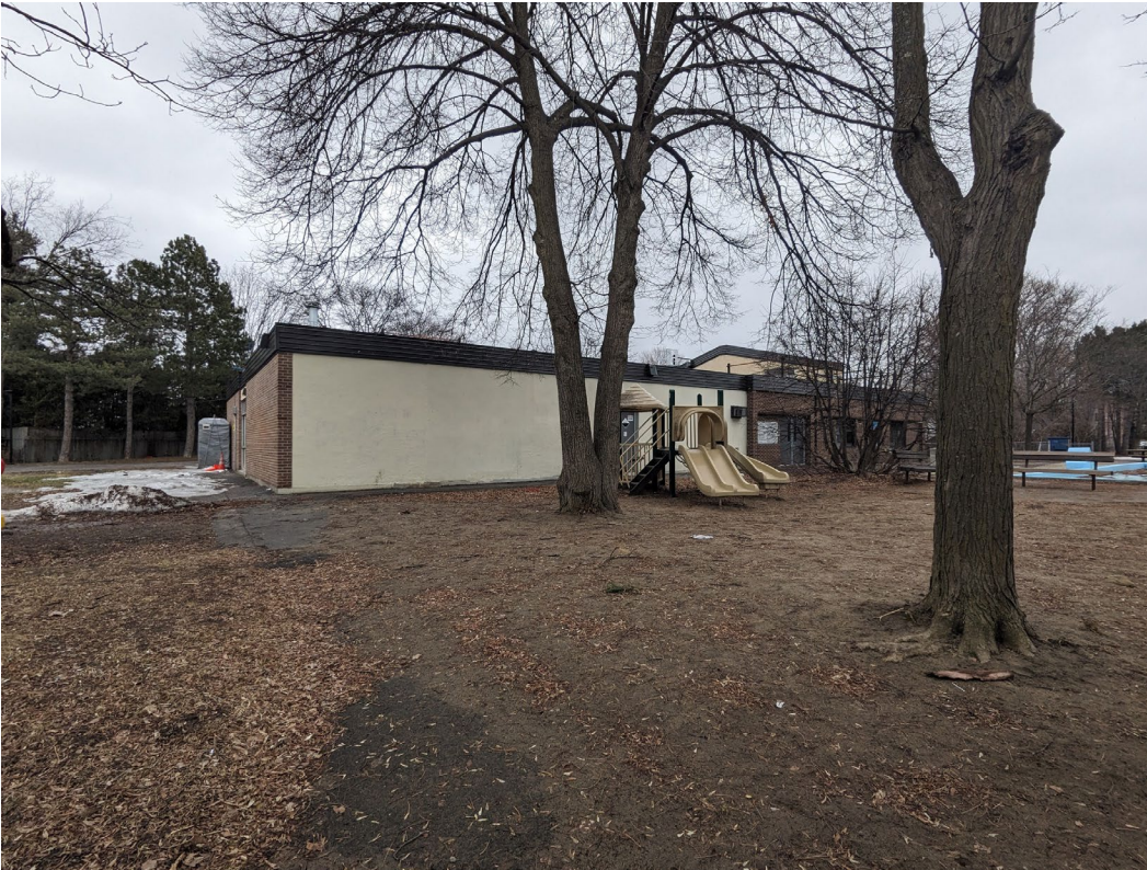
West side of existing building looking east taken from northwest corner