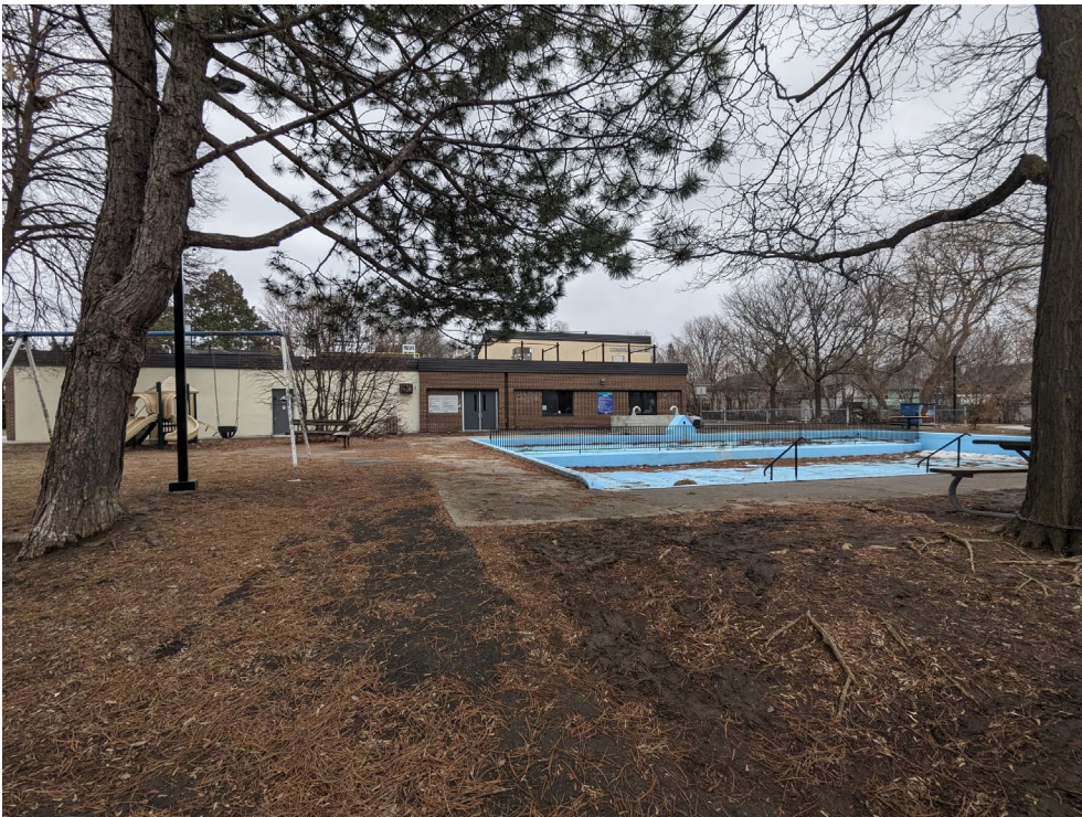
West side of existing building wading pool and play structures in foreground. Pool will be retained, play structures relocated and replaced.