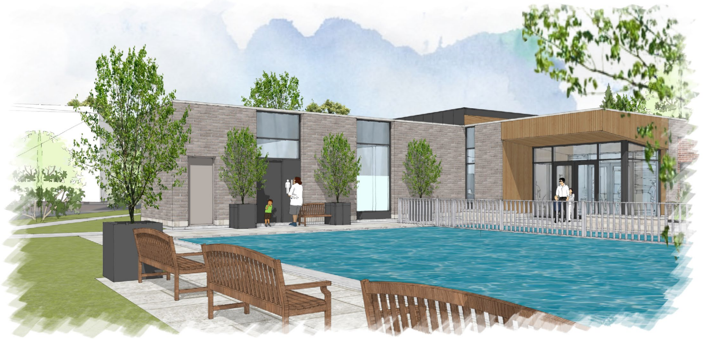
Rear Facility View, Access to Outdoor Program Space