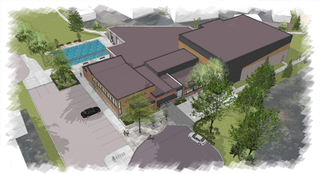
Aerial from southeast corner of site

All renderings are artist concept and are subject to change.