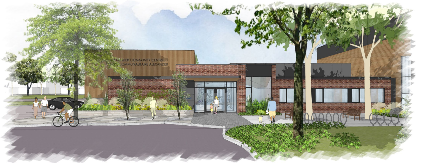
View to New Main Entrance