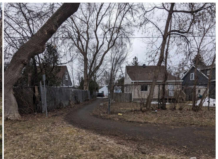
View of pedestrian connection to Marshall Avenue