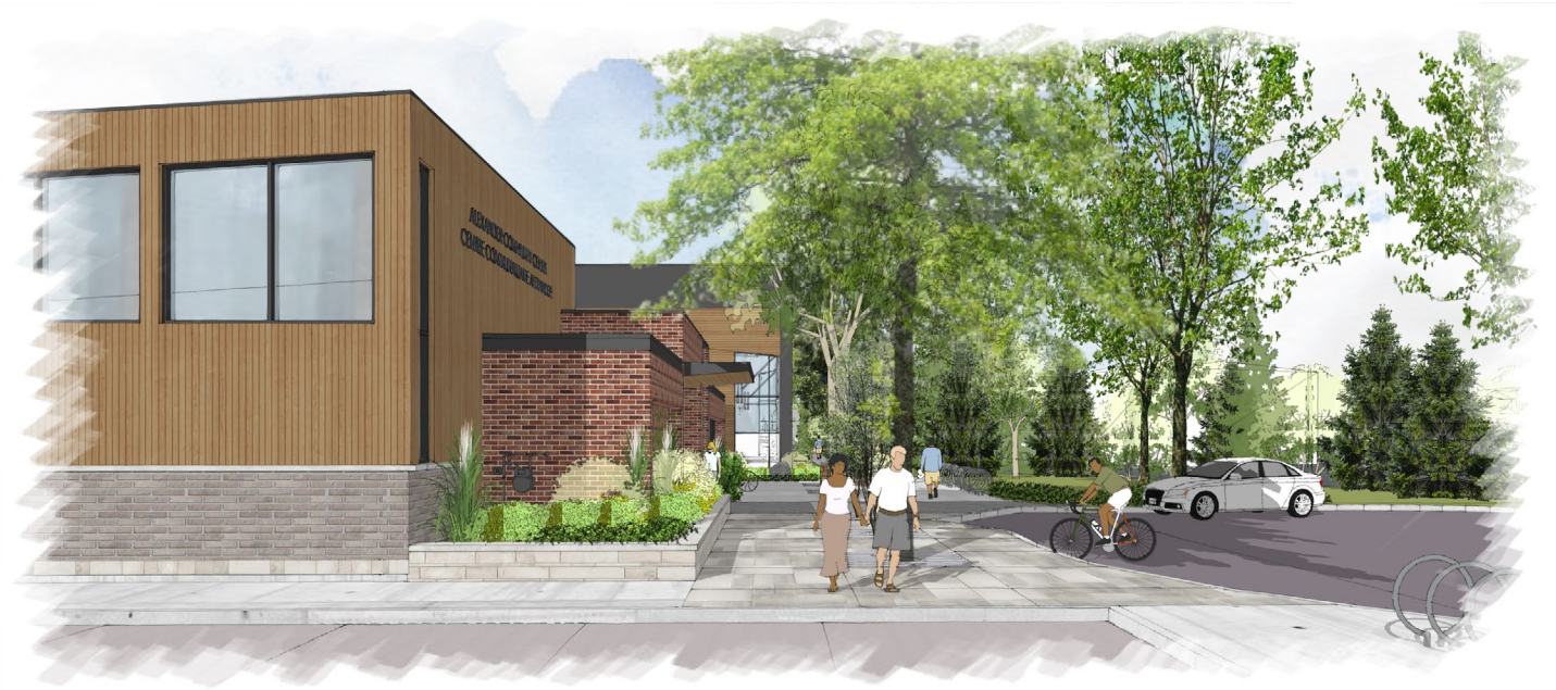
View from Parking Lot