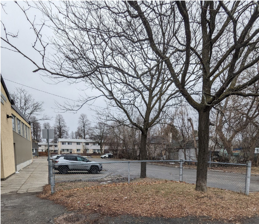
South side of existing building looking towards Silver Street taken from southwest corner. Parking lot will be retained.