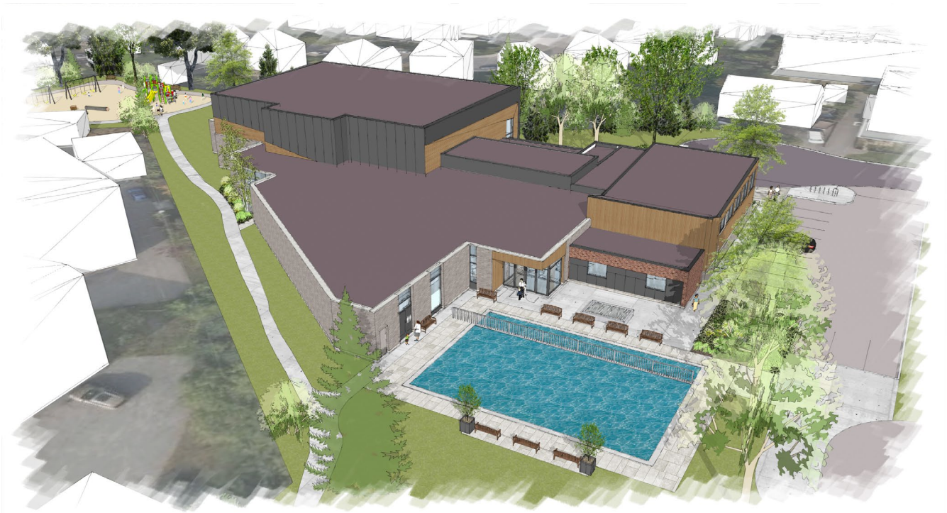
Aerial from west side