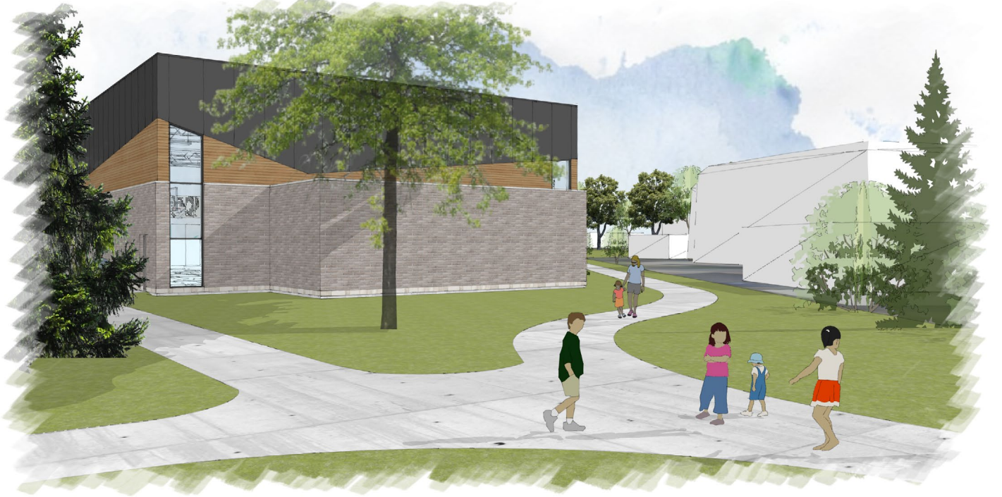
North View of New Gymnasium