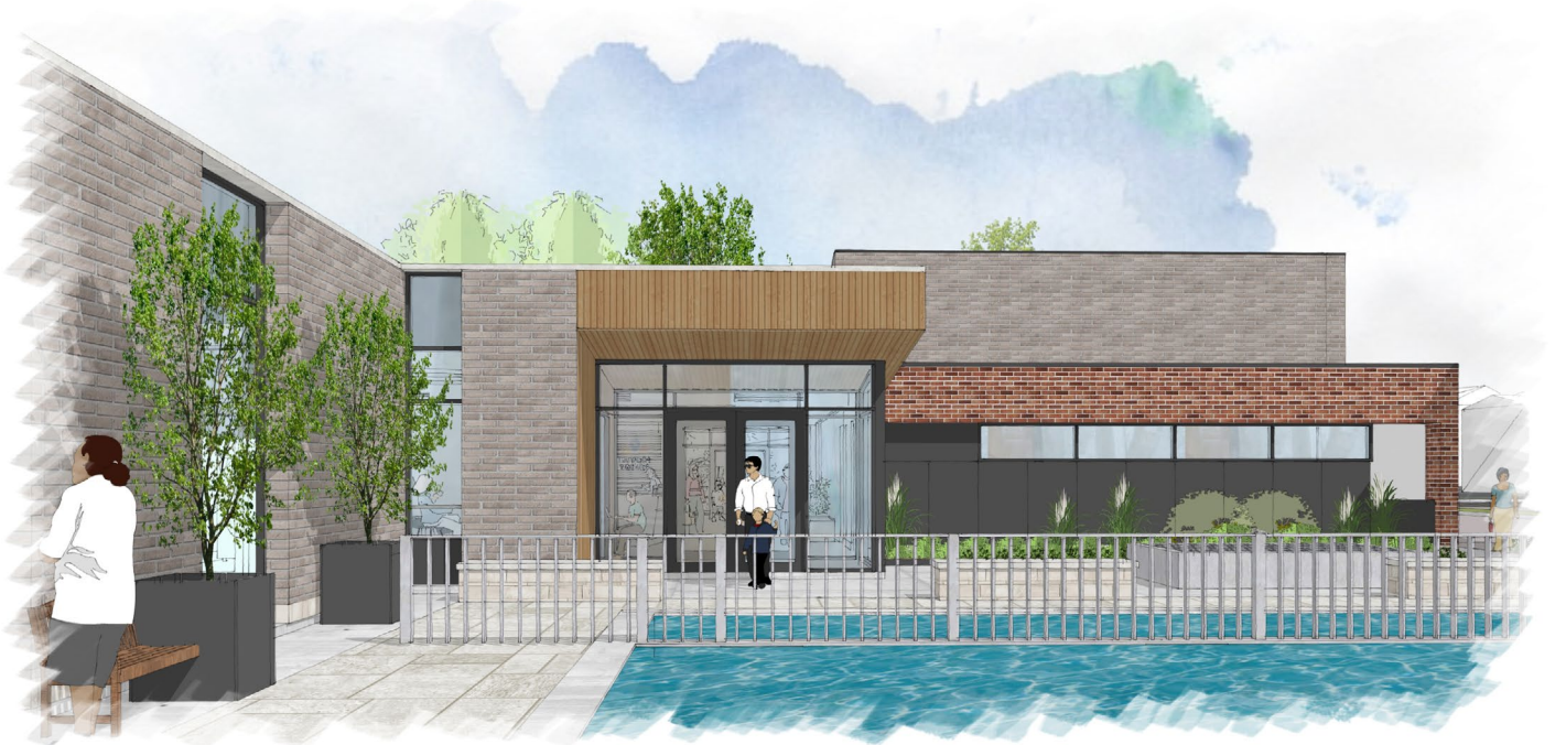
View to Rear Facility* Entrance