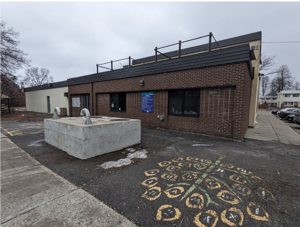
West side of existing building looking east taken from southwest corner