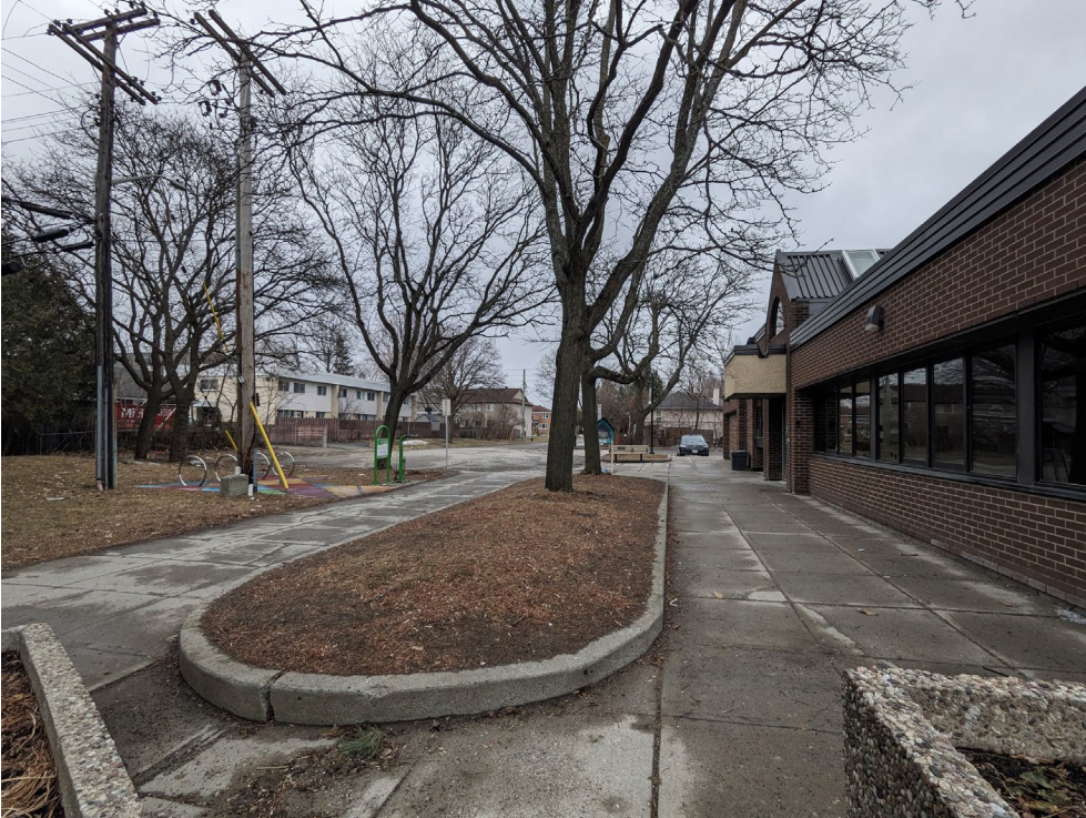
East side of existing building looking towards Silver Street taken from northeast corner