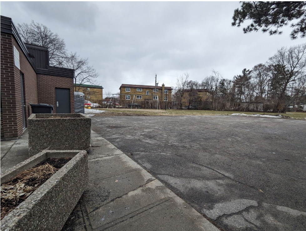
North side of existing building with buildings from Dover Crescent in background taken from northeast corner