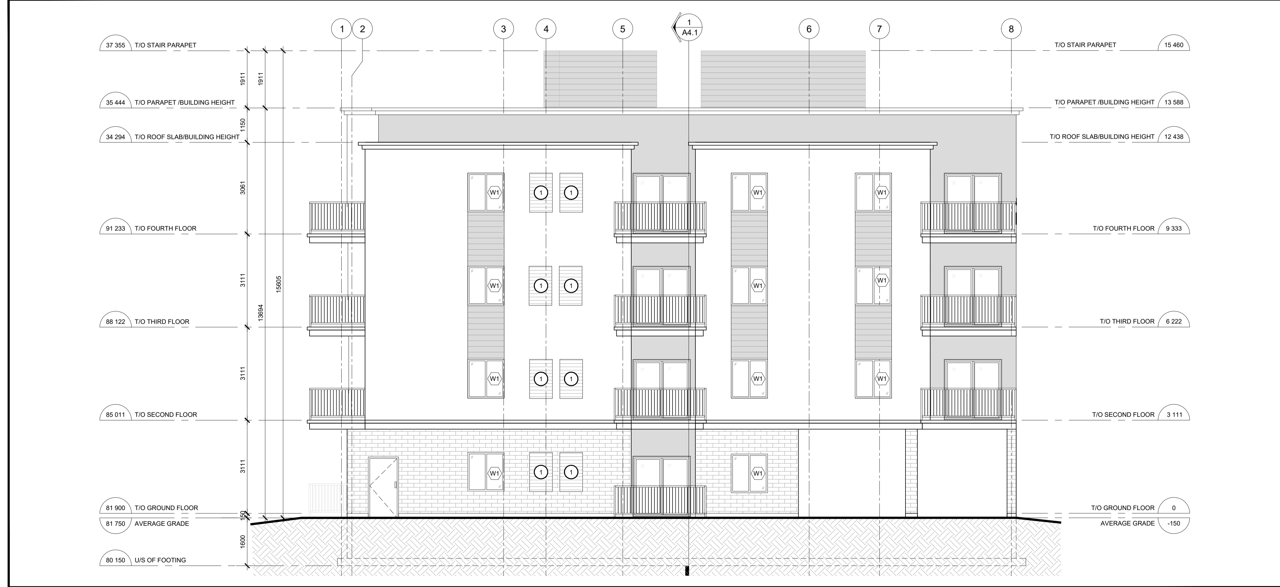
2 West Side Elevation (Facing Lexington Road) A3.1 Scale = 1:75