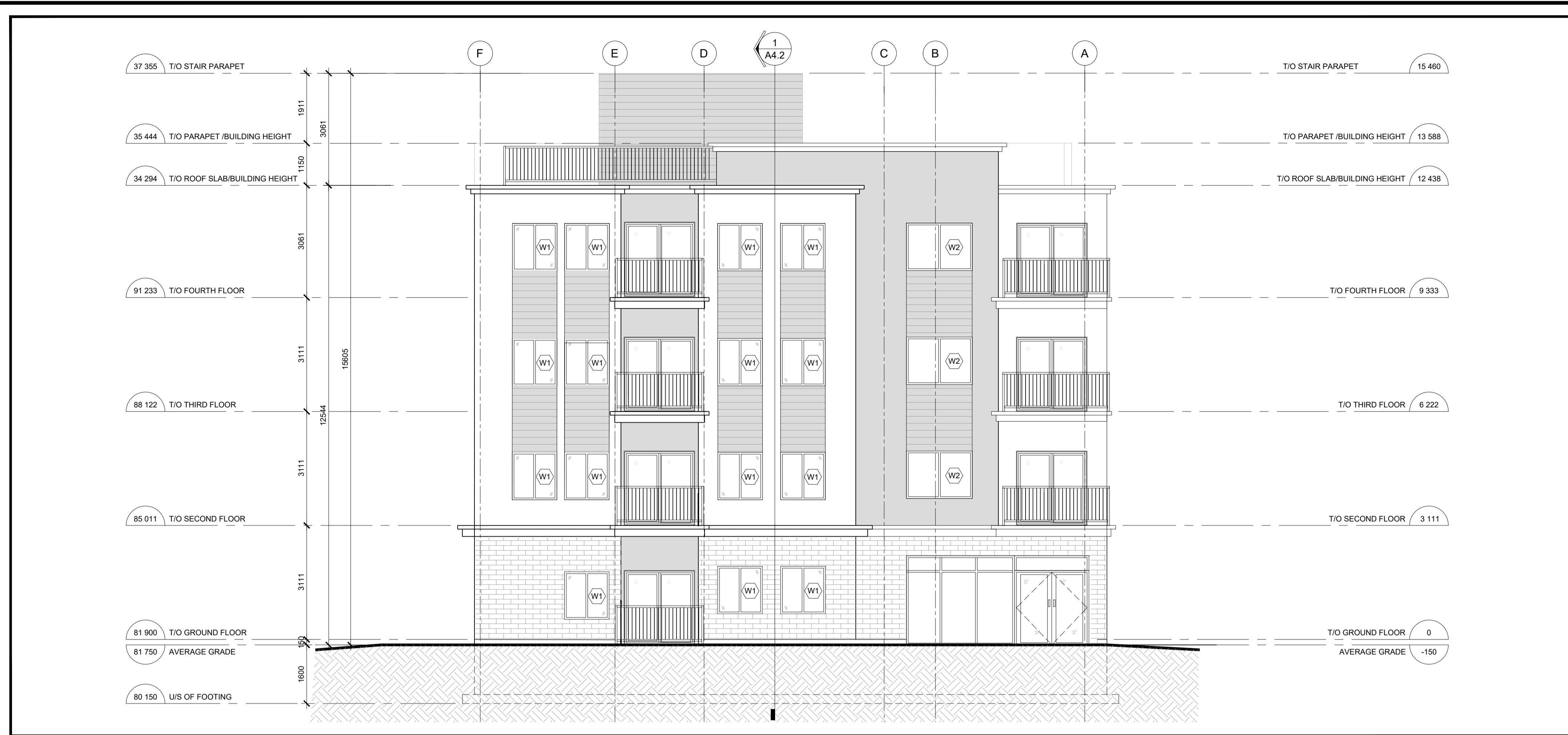
1 North Side Elevation (Facing Baseline Road) A3.1 Scale = 1:75