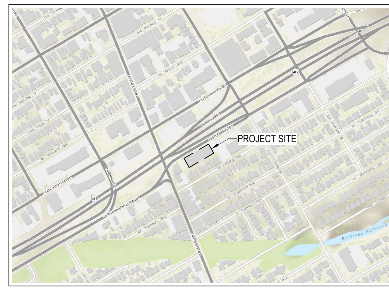
2 LOCATION PLAN SP-01 SCALE: NTS