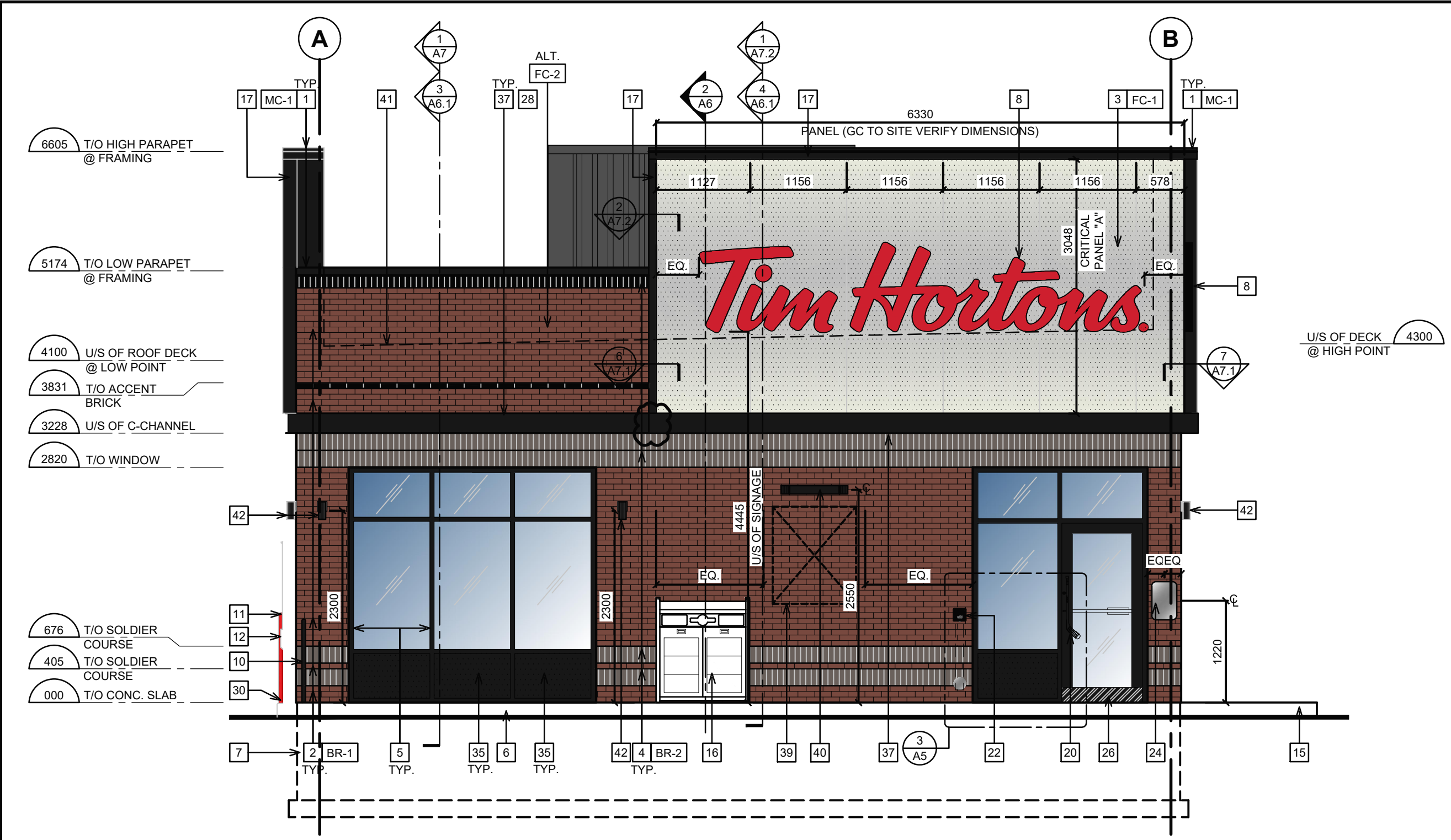
1 FRONT ELEVATION SCALE: 1:50