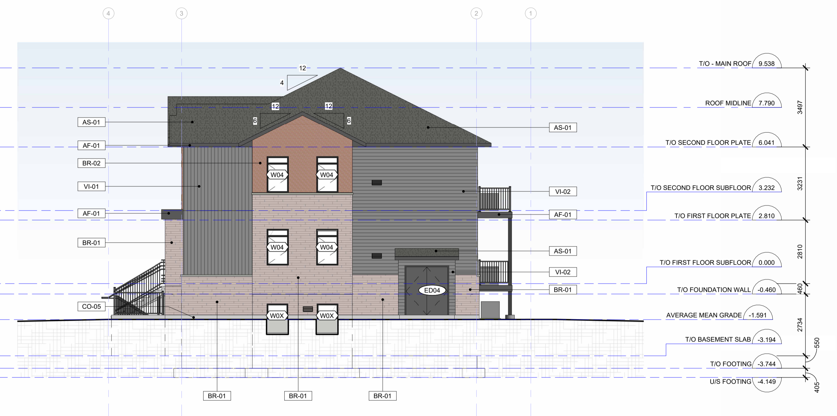
2 RIGHT ELEVATION A202 1:100