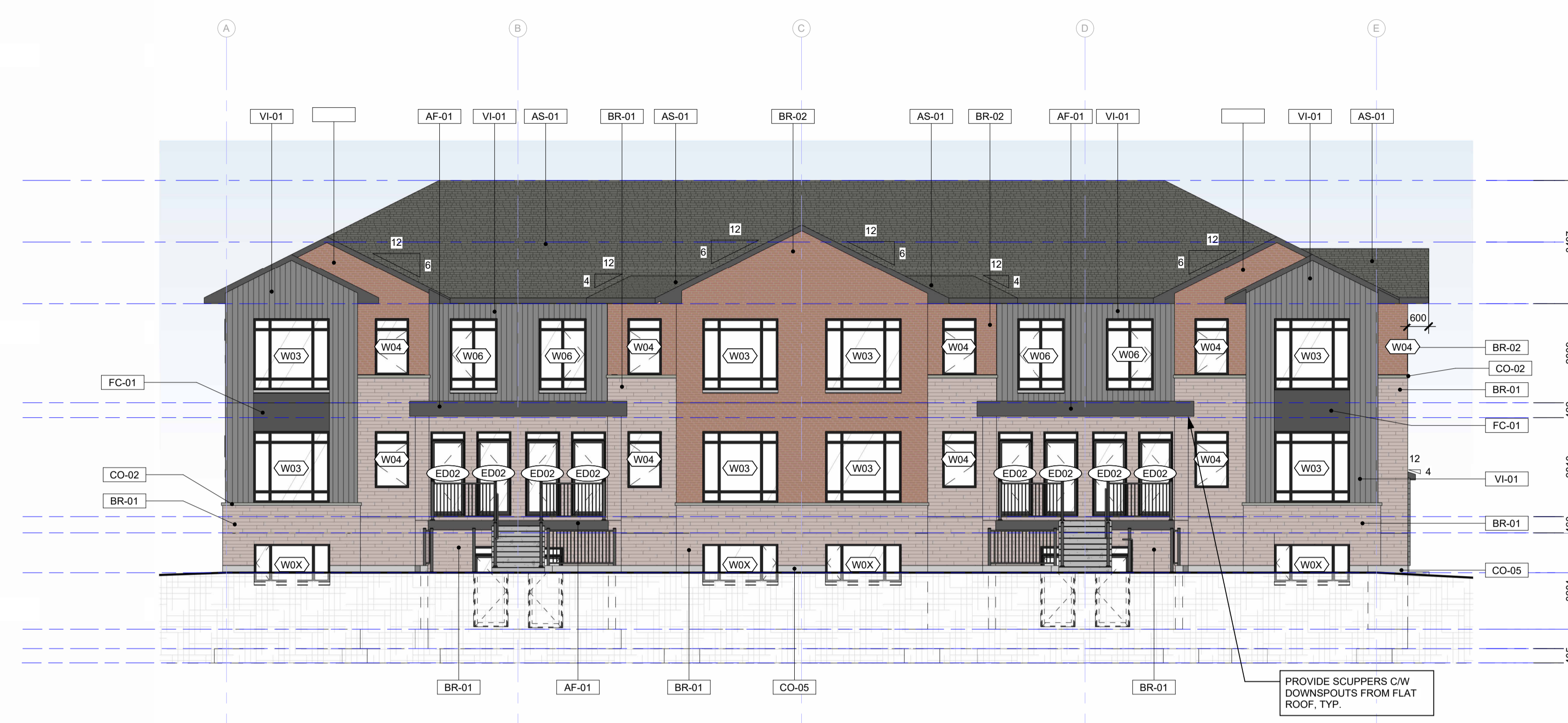
1 FRONT ELEVATION A202 1:100