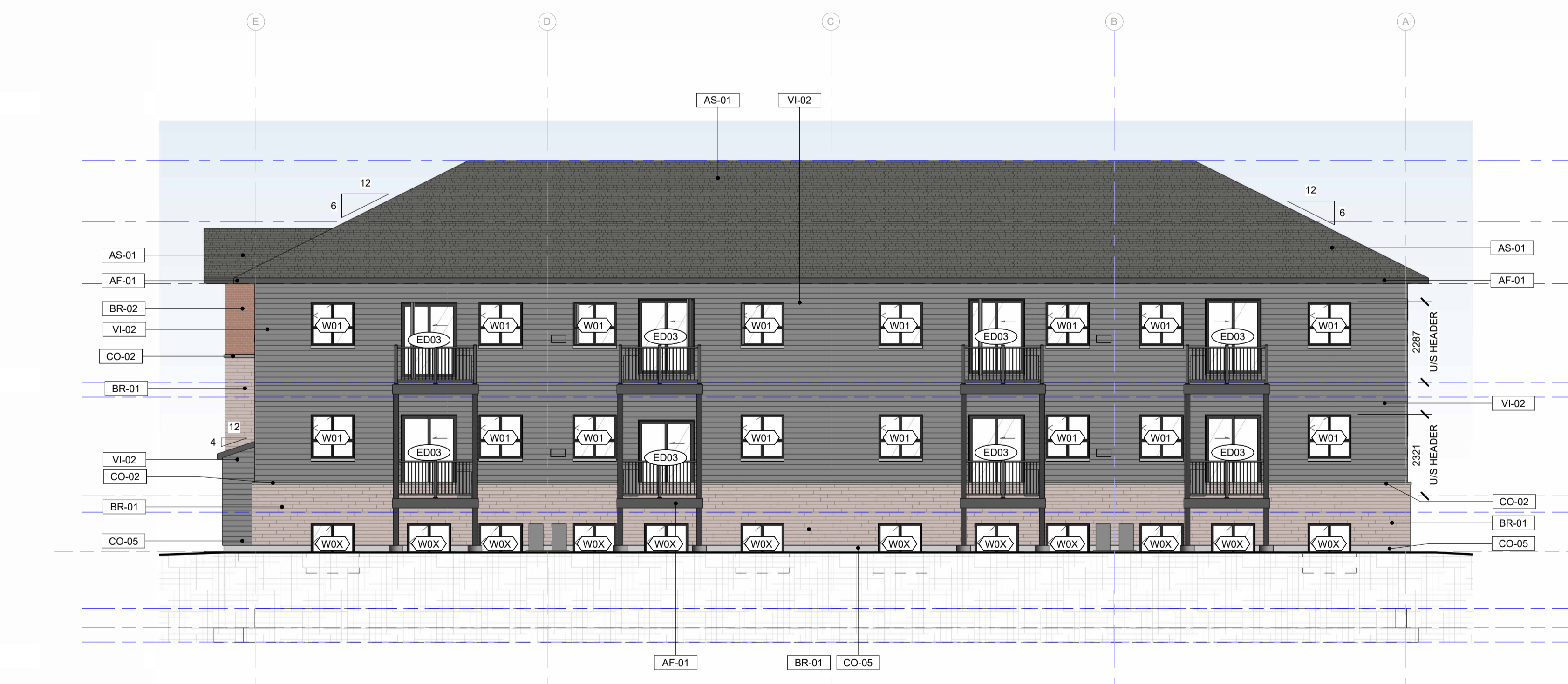
3 REAR ELEVATION A202 1:100