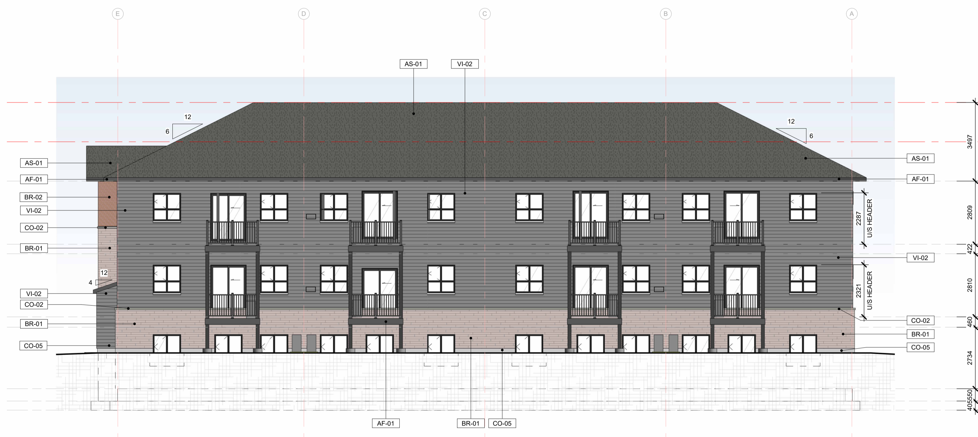
3 REAR ELEVATION A202 1:100