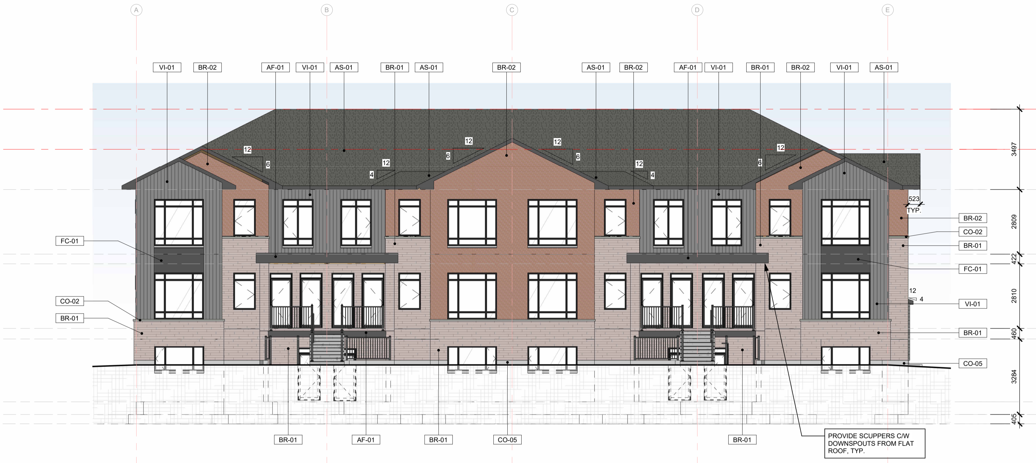
1 FRONT ELEVATION A202 1:100