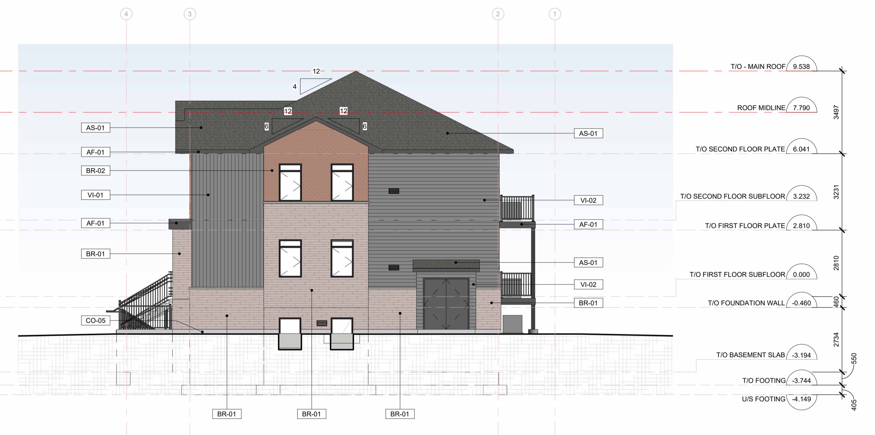
2 RIGHT ELEVATION A202 1:100