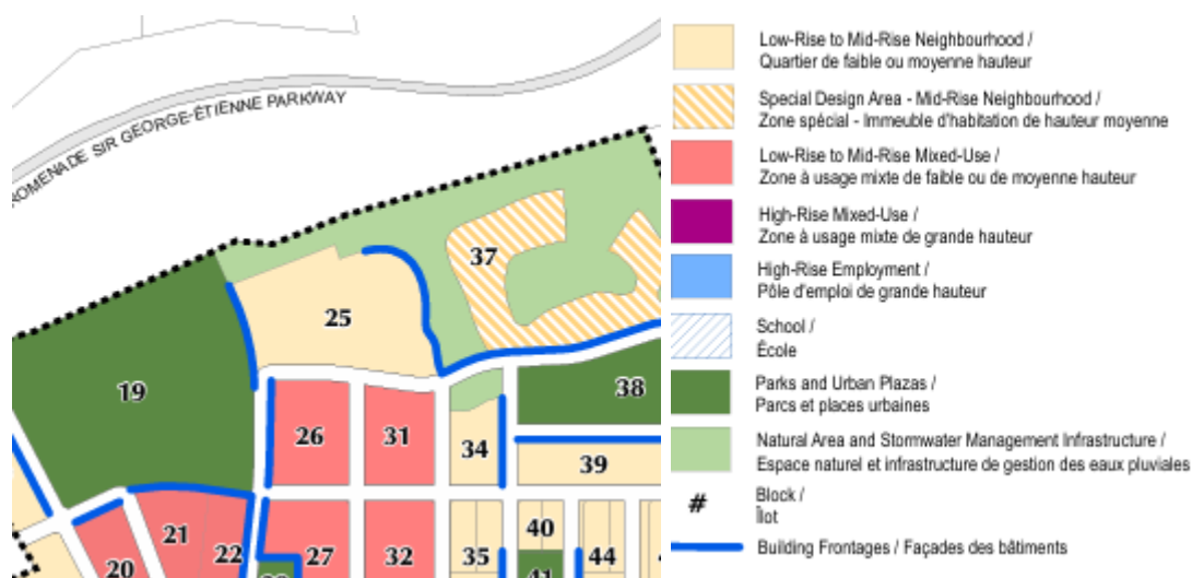
Figure 3. Schedule A – Designation Plan, Wateridge Village Secondary Plan

The site is designated Low-Rise to Mid-Rise Neighbourhood on Schedule A of the SP.