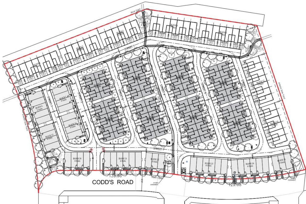
Figure 2. Site Plan (Korsiak, dated March 25, 2026)

The proposal on the site has evolved since the preconsultation meeting (December 9, 2026) in response to comments from the City and the Wateridge Village Community Association. Mainly, to remain consistent with the policies of the Secondary Plan, the site has been reconfigured so that the townhouse dwellings with backyards are located along the lot lines to the west, north, and east, facing onto the surrounding parkland. For additional connectivity, pedestrian walkways are proposed, providing north-south and east-west access from the site to the surrounding parklands and the remainder of the subdivision. The street network has been reoriented to be situated within the site away from the lot lines. The proposed road network has been designed to align with the planned intersections of the subdivision.