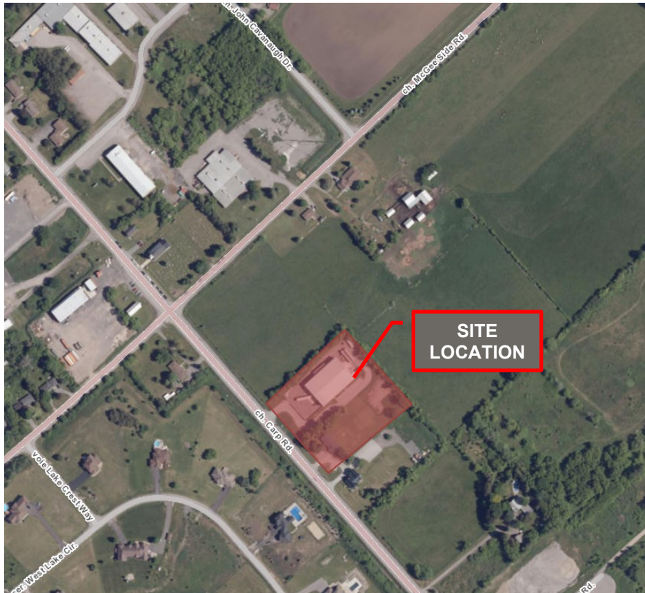
Figure 1.1: Key Plan of Site

The approximately 1.3 ha site is situated southeast of the intersection of McGee Side Road and Carp Road, bounded by Carp Road to the Southwest, an undeveloped parcel to the North, and adjacent to a residential dwelling (2966 Carp Road) to the Southeast. The site is currently zoned as RC7 - Rural Commercial Zone. The key plan of the site is shown in Figure 1.1 below. The intent of this brief is to demonstrate, to the City's satisfaction, that adequate services are available and can be allocated to support the proposal.