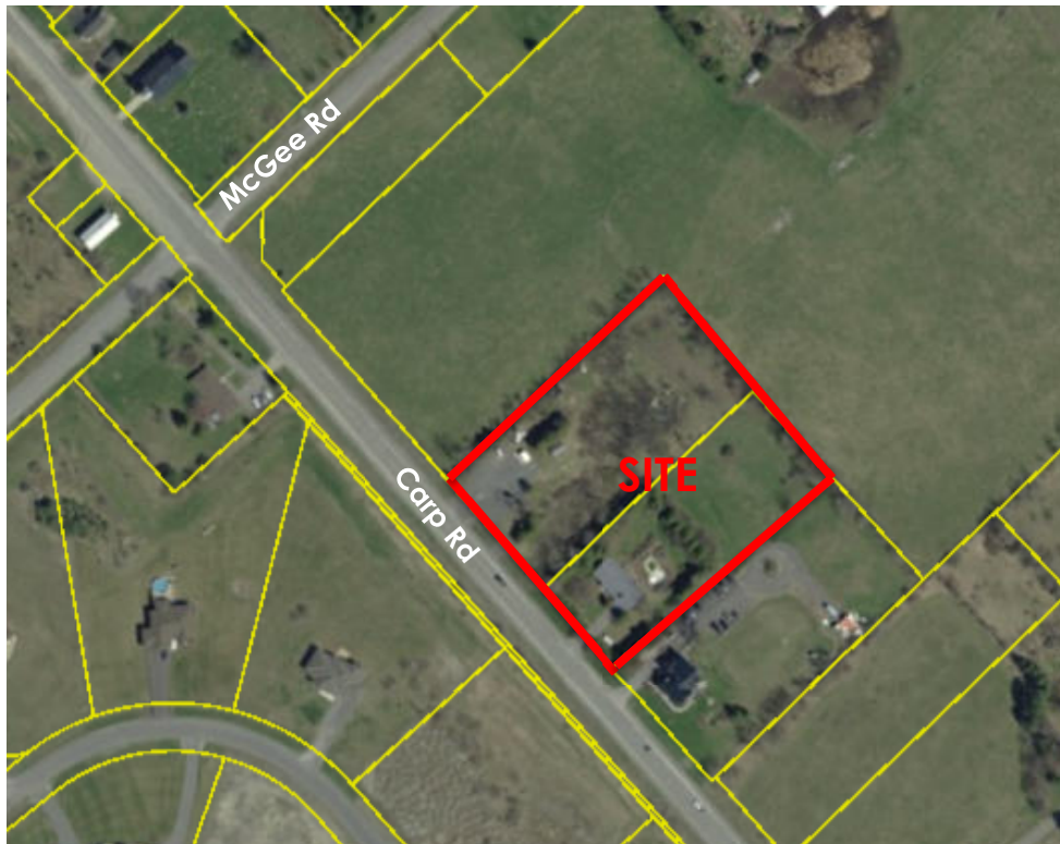
Figure 1: Location Plan

Stantec Consulting Ltd. has been commissioned by Nautical Lands Group to prepare a servicing study in support of Site Plan Control submission of the proposed development located at 2978 Carp Road. Currently the site is divided into two parcels of land and is under approval to merge as one, 2978 and 2966 Carp Road (PIN 04537-0266 and 04537-0265). The site is situated southeast of the intersection of McGee Road and Carp Road within the City of Ottawa. The proposed development comprises approximately 1.30ha of land, and would replace a vacant property with a 15,000sq. ft pre-engineered steel storage building on the northern portion of the site. The site is zoned under Rural Commercial. The conceptual site development plan used for the purpose of this servicing brief is shown as Figure 1 . The intent of this report is to provide a servicing scenario for the site that is free of conflicts, provides on-site servicing in accordance with City of Ottawa design guidelines, and utilizes the existing local infrastructure in accordance with the guidelines outlined per consultation with City of Ottawa staff.