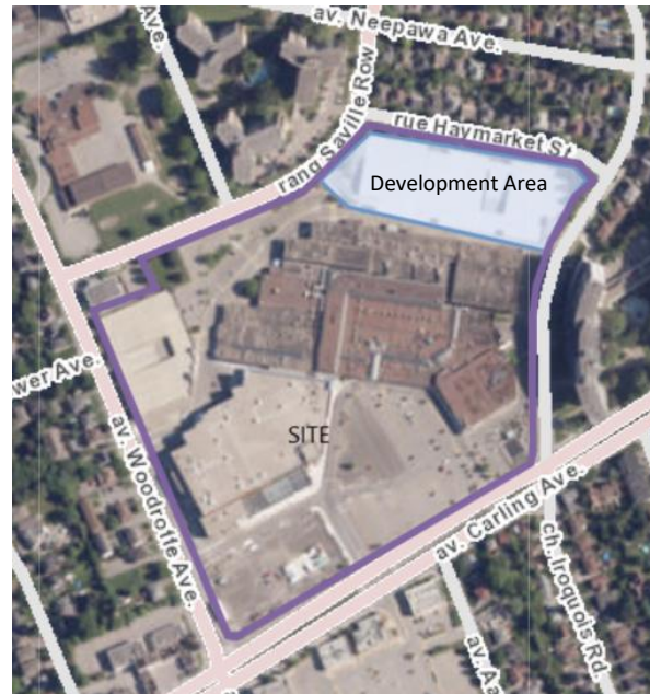
Figure 1: Site Map