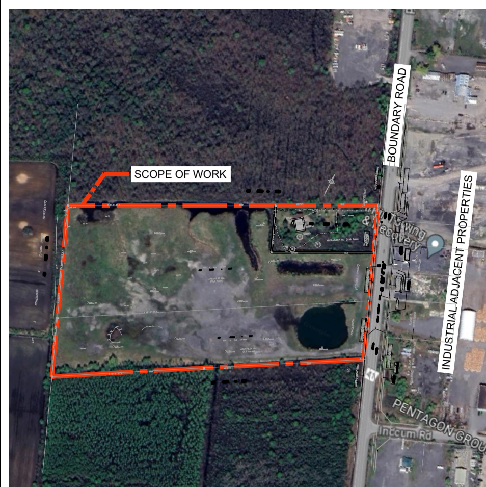
1 EXISTING KEY PLAN SCALE: N/A