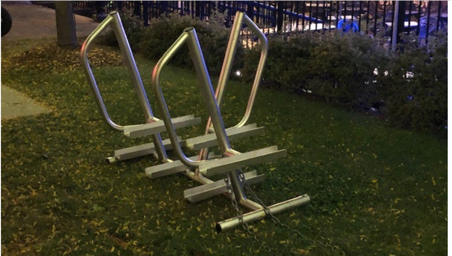
Lanark Ontario Canada Terms & Conditions / Privacy Policy