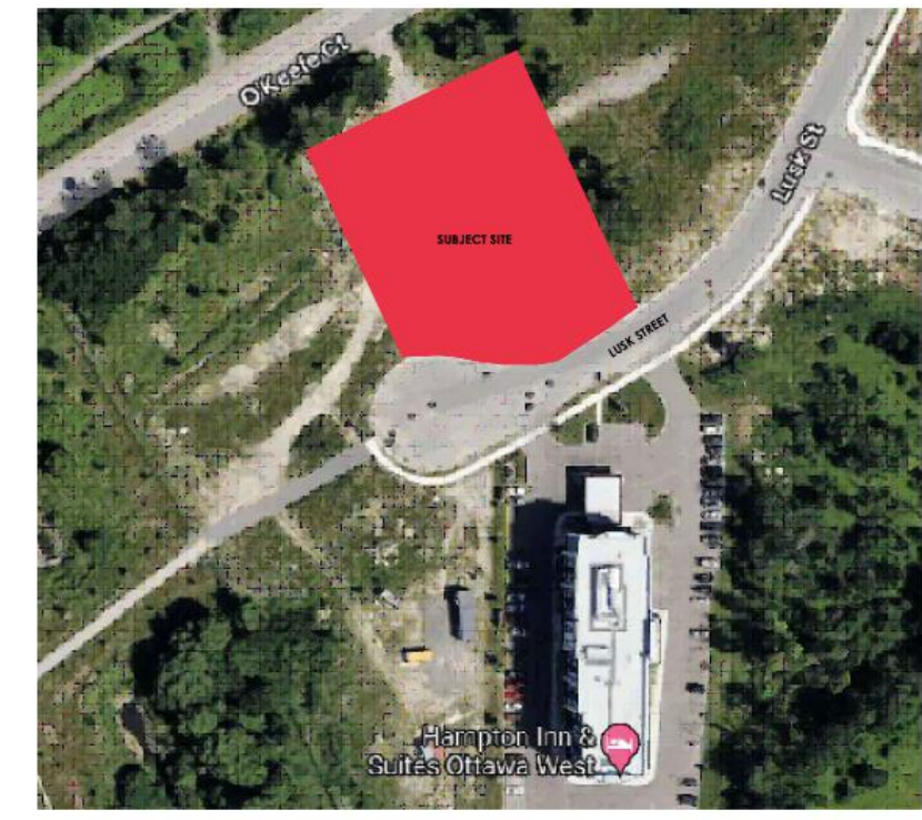
KEY PLAN N.T.S.