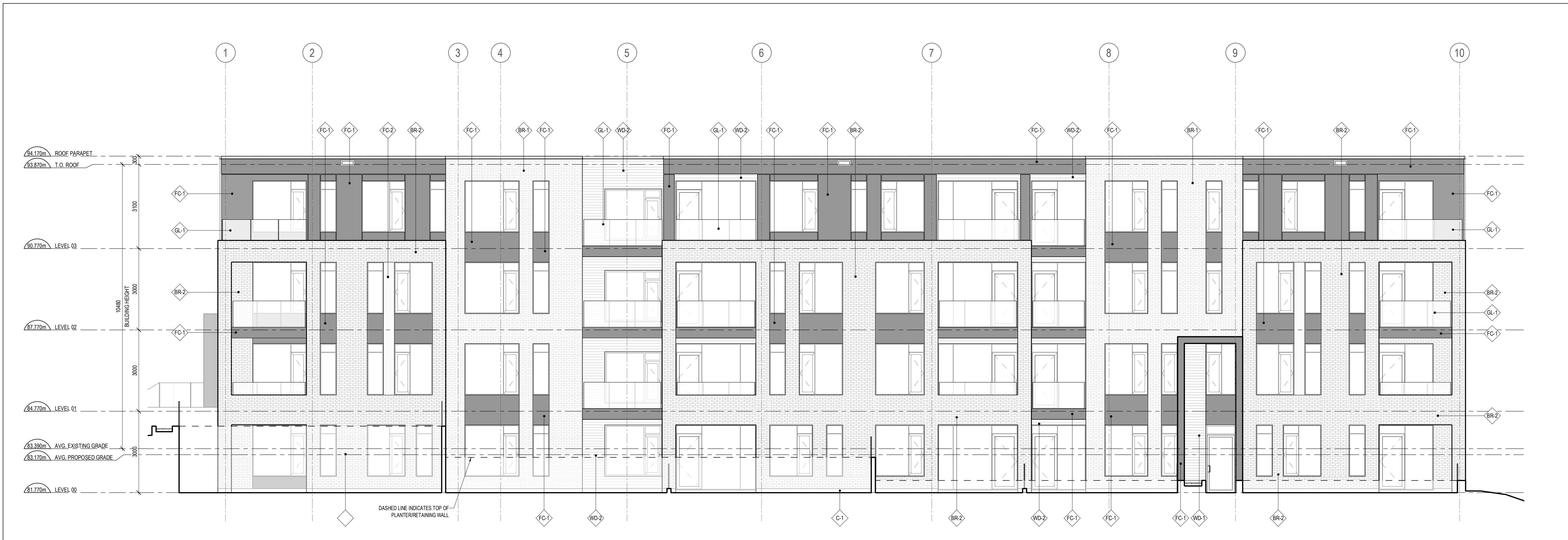
1 EAST ELEVATION A201 SCALE: 1 : 75