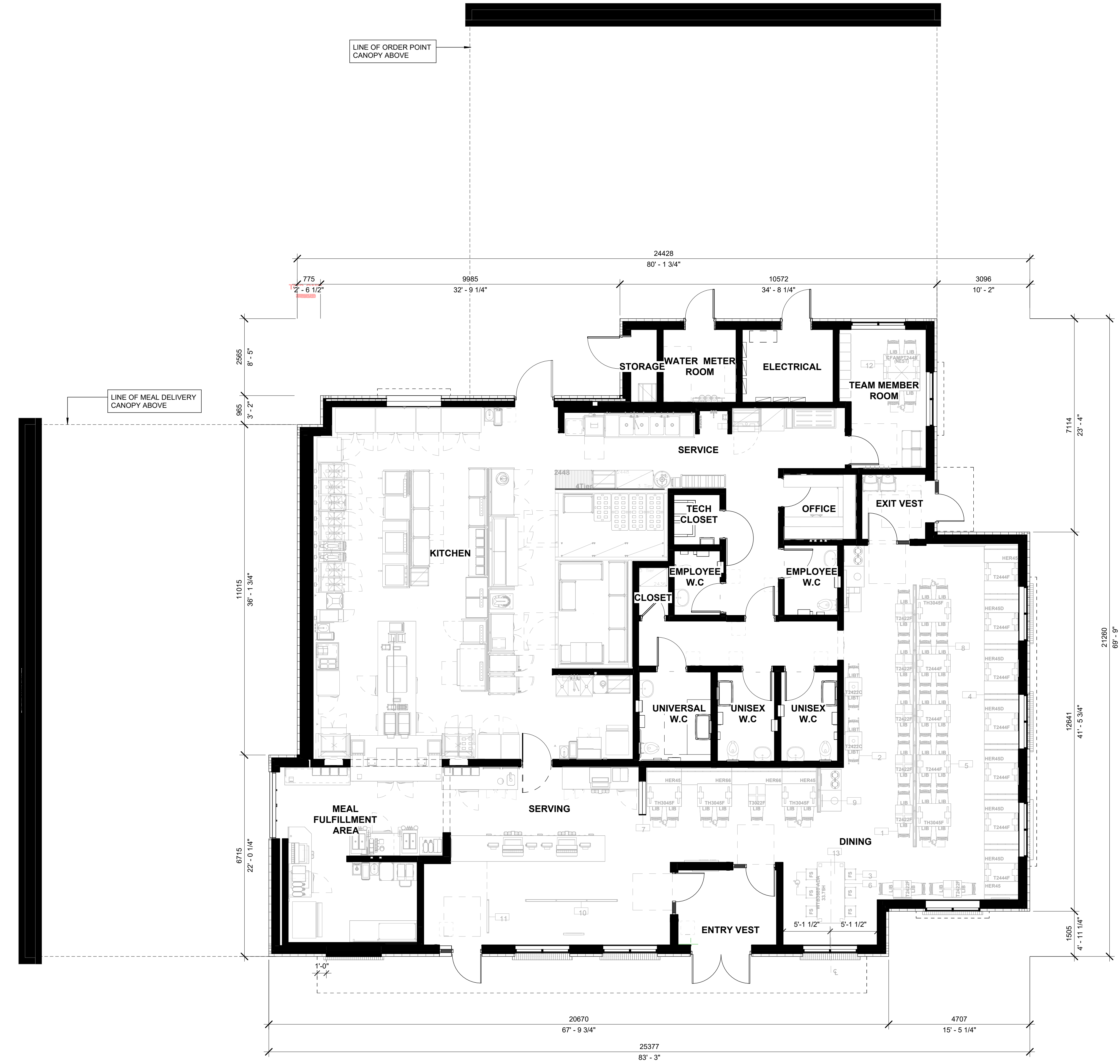
A4 FLOOR PLAN 1:70