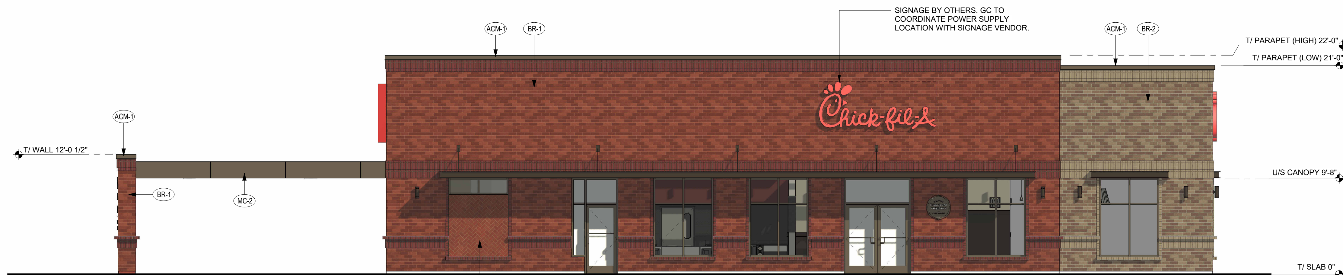
A3 EXTERIOR ELEVATION 1:70