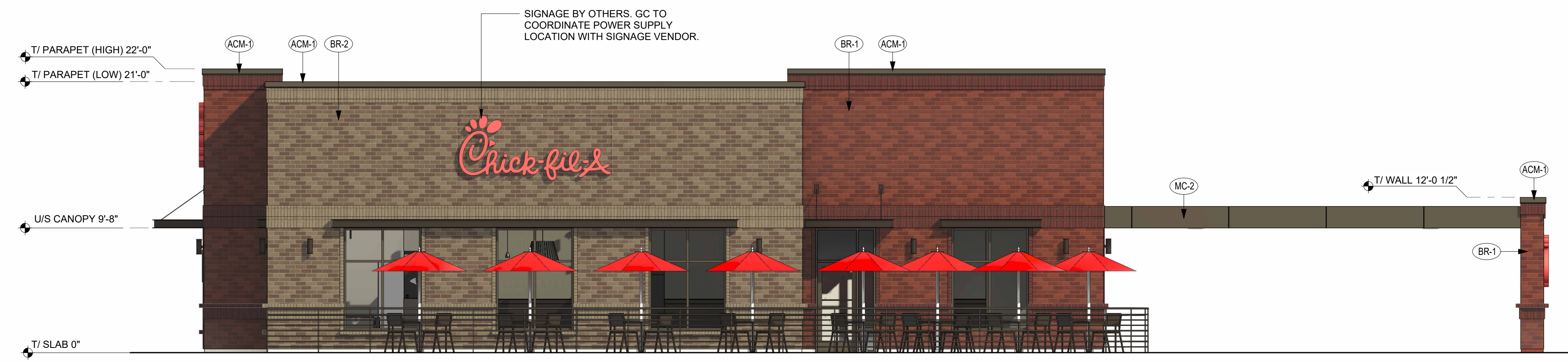
D3 EXTERIOR ELEVATION 1:70