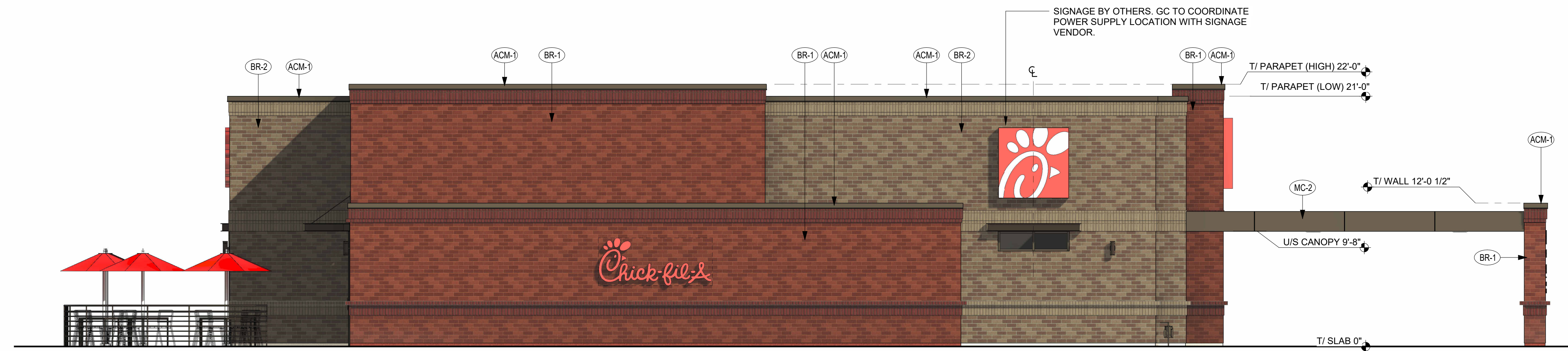
C3 EXTERIOR ELEVATION 1:70