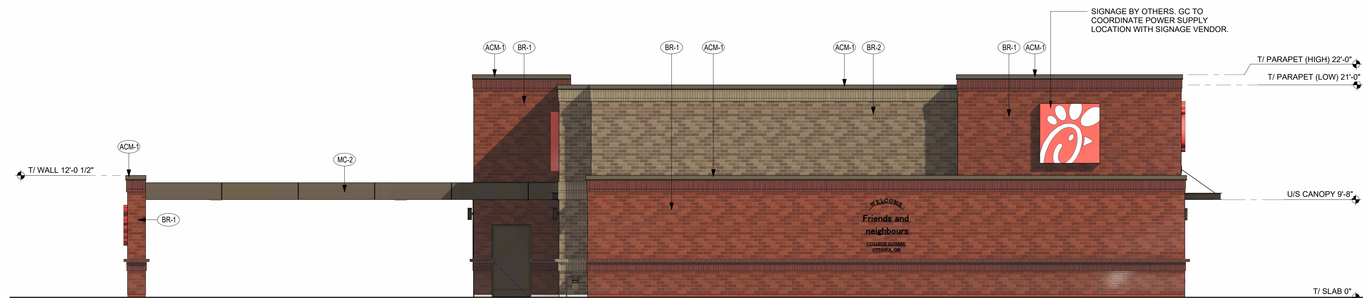
B3 EXTERIOR ELEVATION 1:70