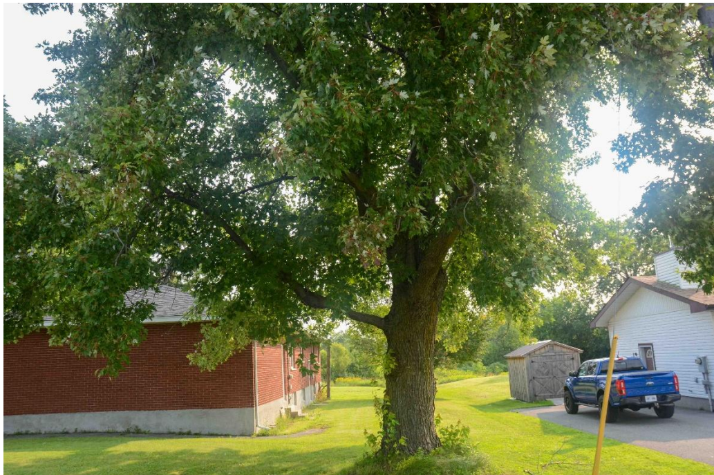
Photo 2 – The other mature silver maple in the central west portion of the site. View looking east from east of Longfields Drive