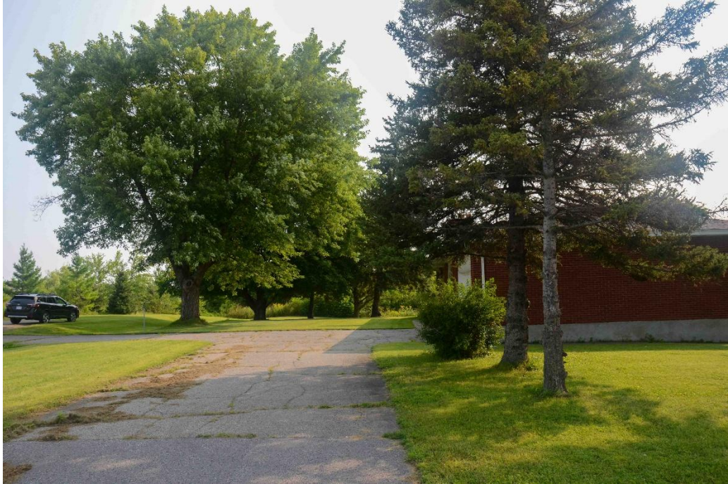
Photo 1 – Typical conditions of the development portion of the site, with manicured lawn and scattered trees. The mature silver maple is on the left towards the rear, with smaller white spruce on the right. View looking east towards the north residence from Longfields Drive