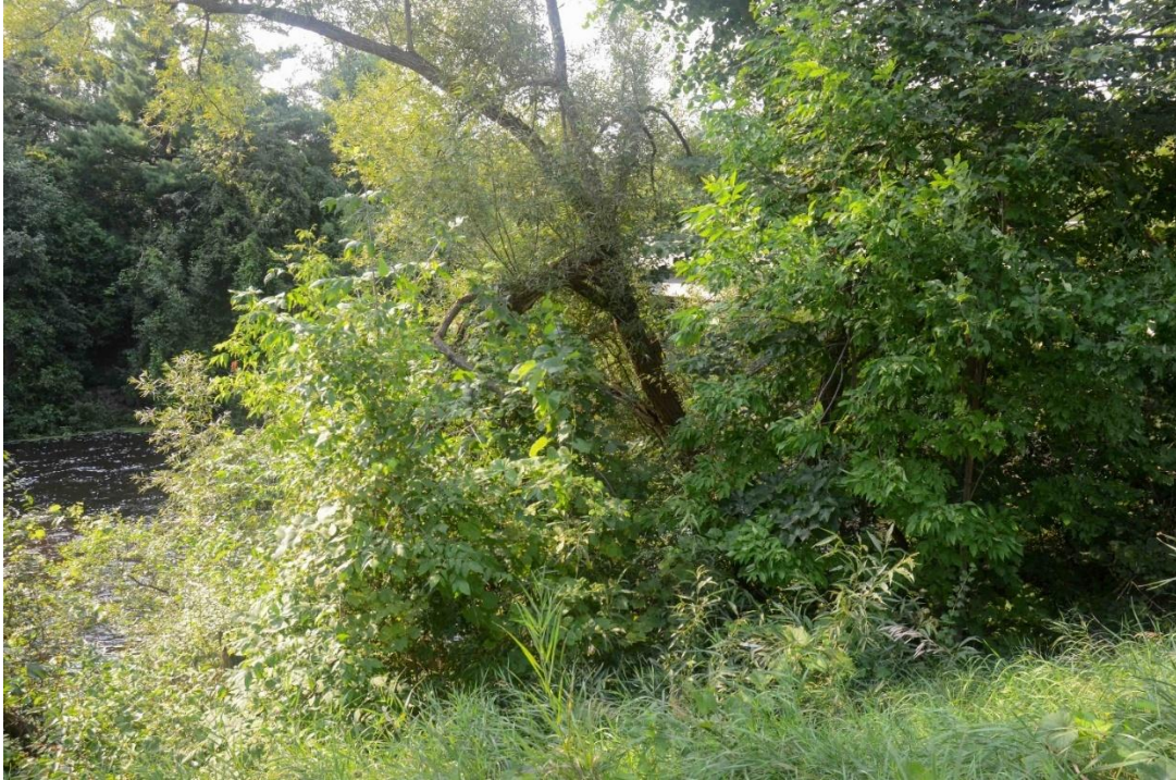
Photo 5 – Another view of the vegetation down the slope, with the Jock River in the rear left. View looking southeast