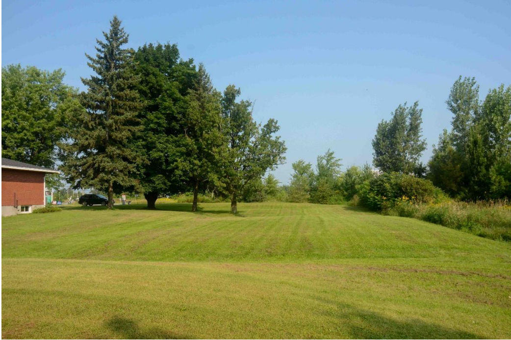
Photo 3 – East portion of the development portion of the site. View looking north from top-of-slope