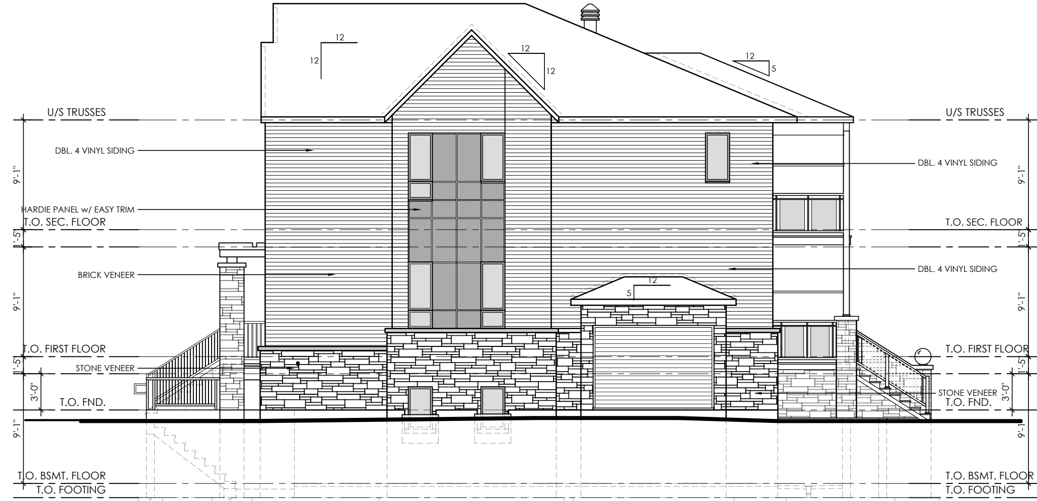
"STREET END" UNIT, SIDE ELEVATION TYPICAL BLOCK - STREET SIDE ELEVATION