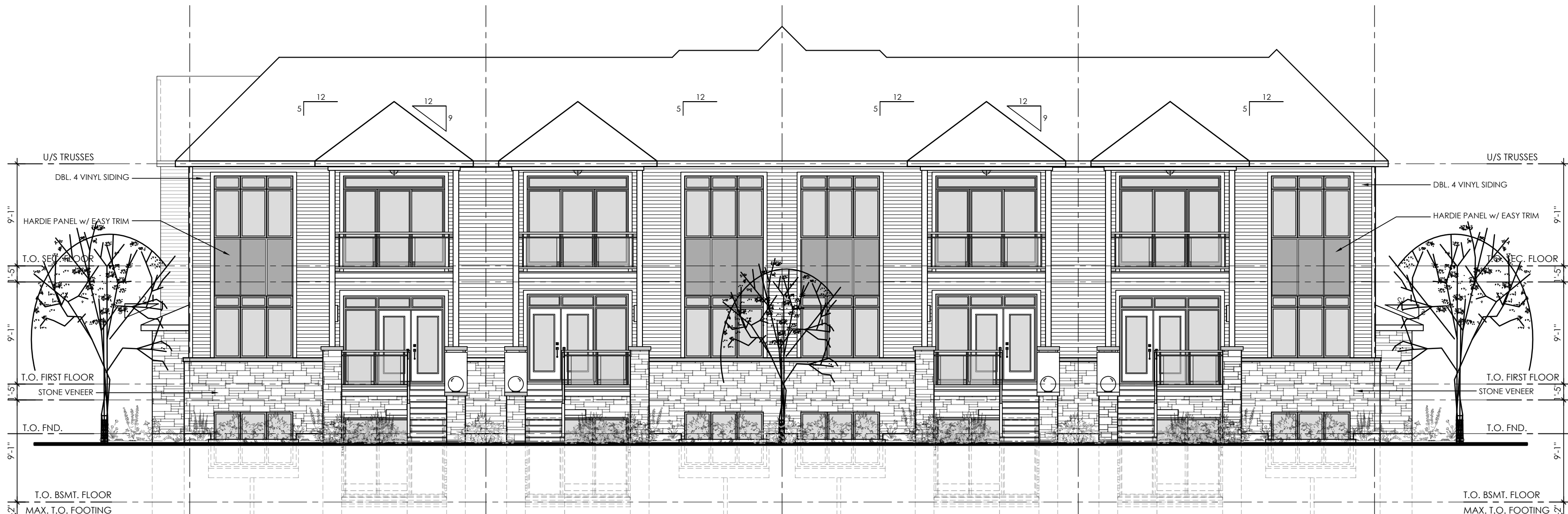
TYPICAL BLOCK - PUBLIC STREET ELEVATION