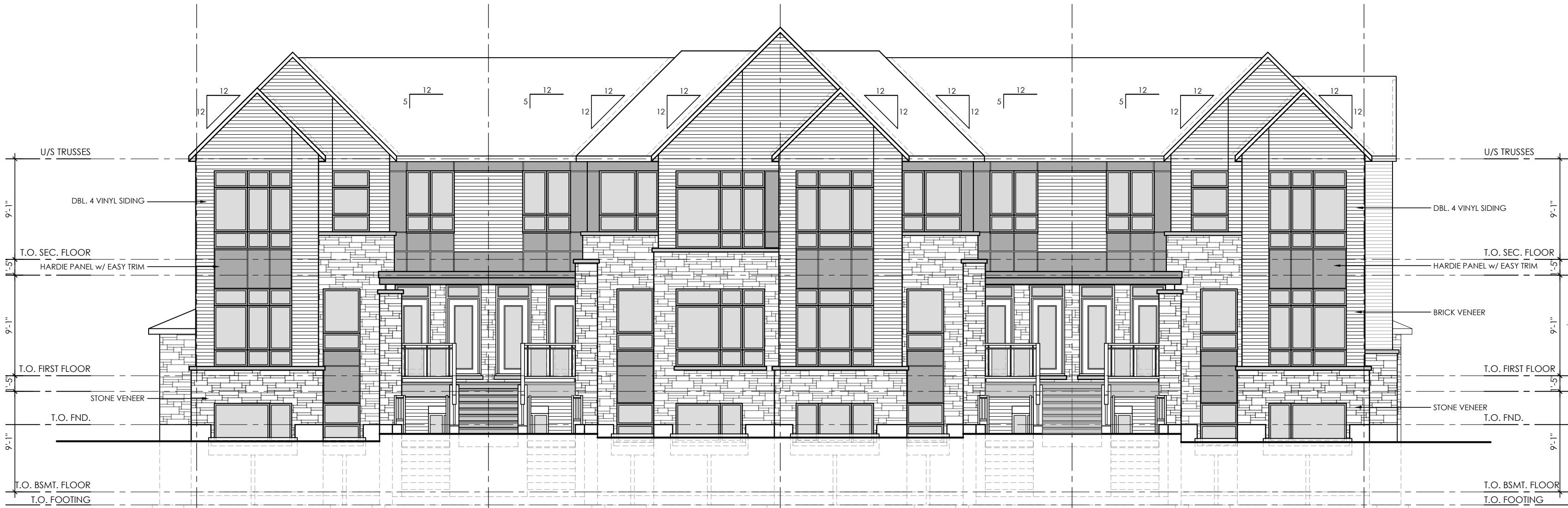
TYPICAL BLOCK - PRIVATE STREET ELEVATION