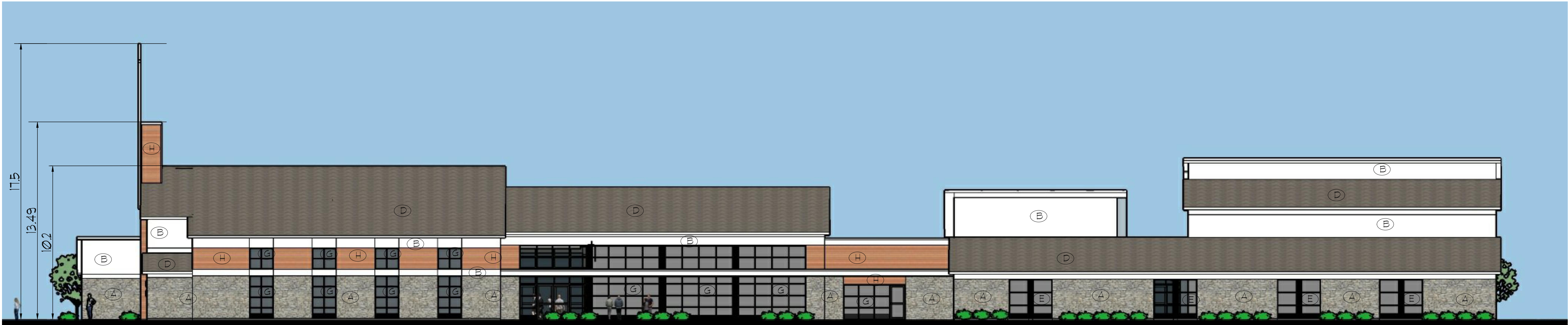
REAR (SOUTHEAST) ELEVATION SCALE 1:150