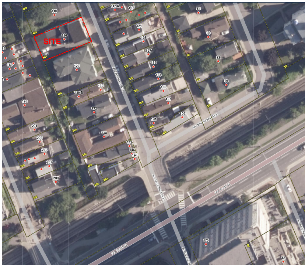
KEY PLAN: NTS