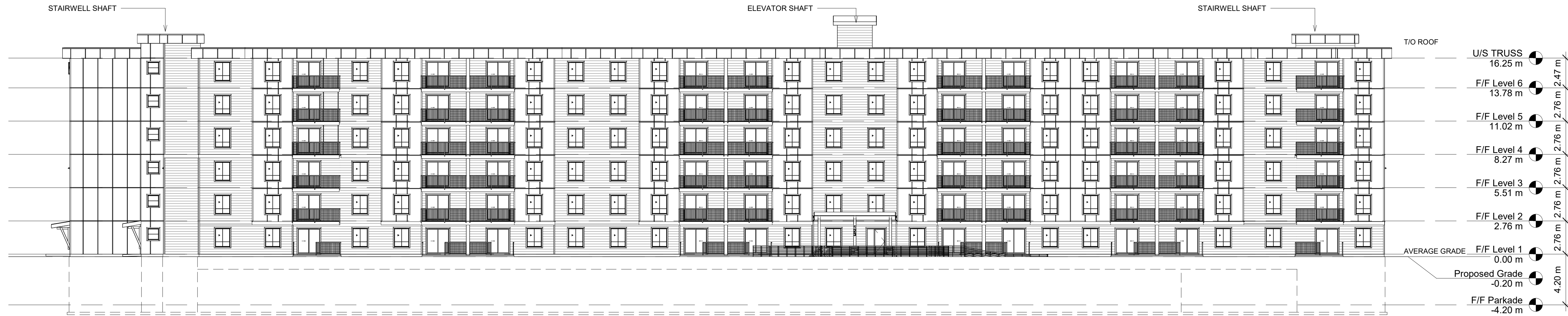
1 NORTH ELEVATION 1 : 175