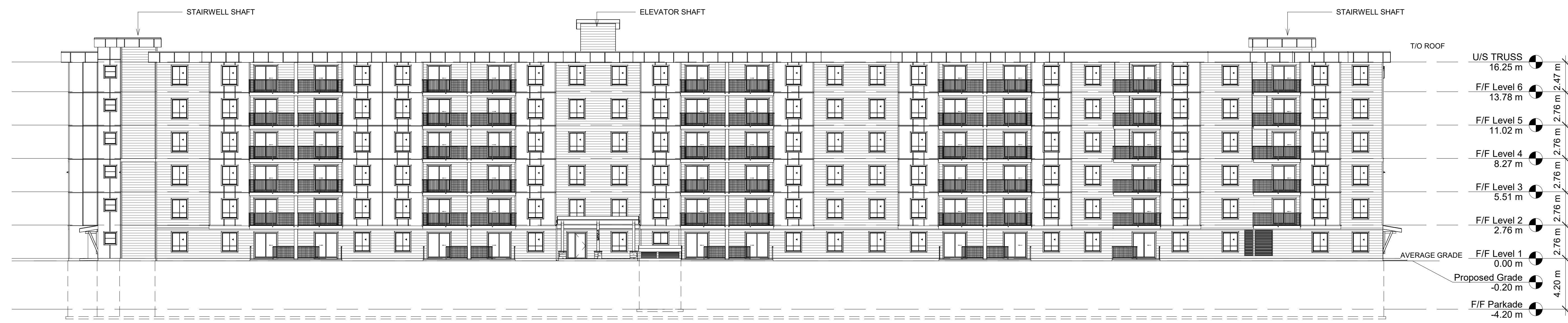
2 SOUTH ELEVATION 1 : 175