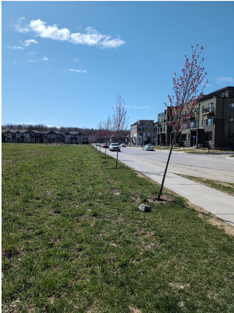
Figure 2 Planted Red Maple trees (average DBH 5.1 cm) along the west side of the open field (photo taken April 30, 2025)