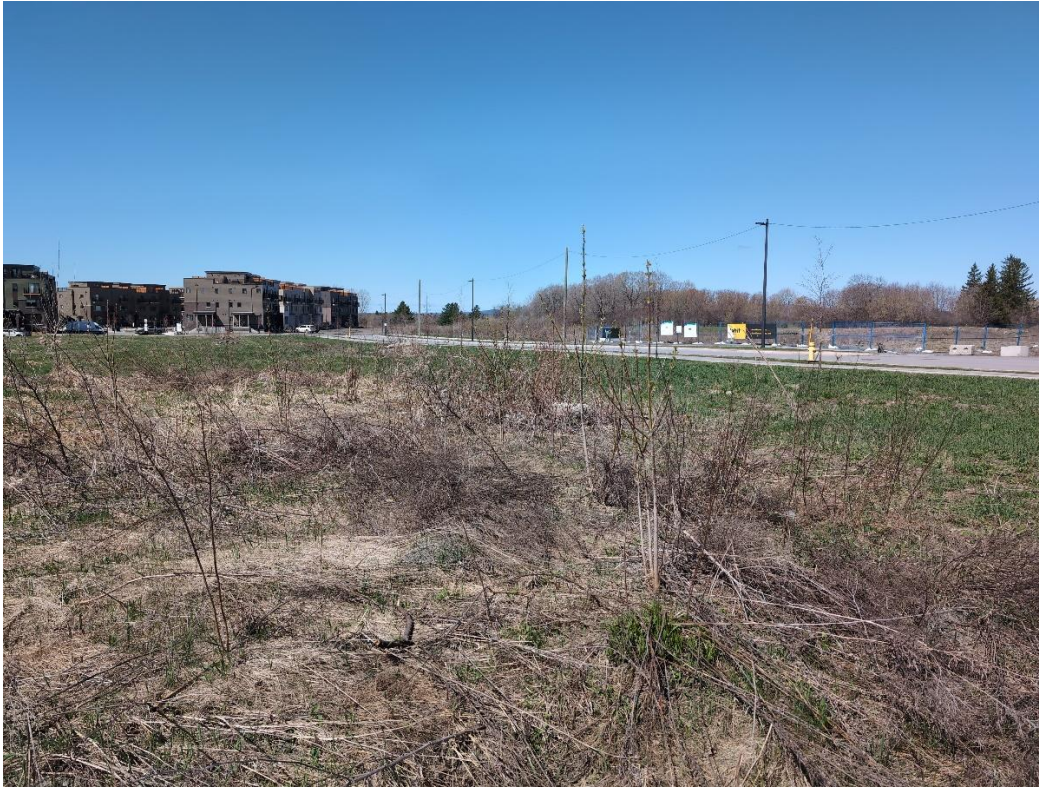
Figure 3 Naturally-occurring (i.e. not planted) Manitoba Maple saplings in the northeast corner of the Site (photo taken April 30, 2025)