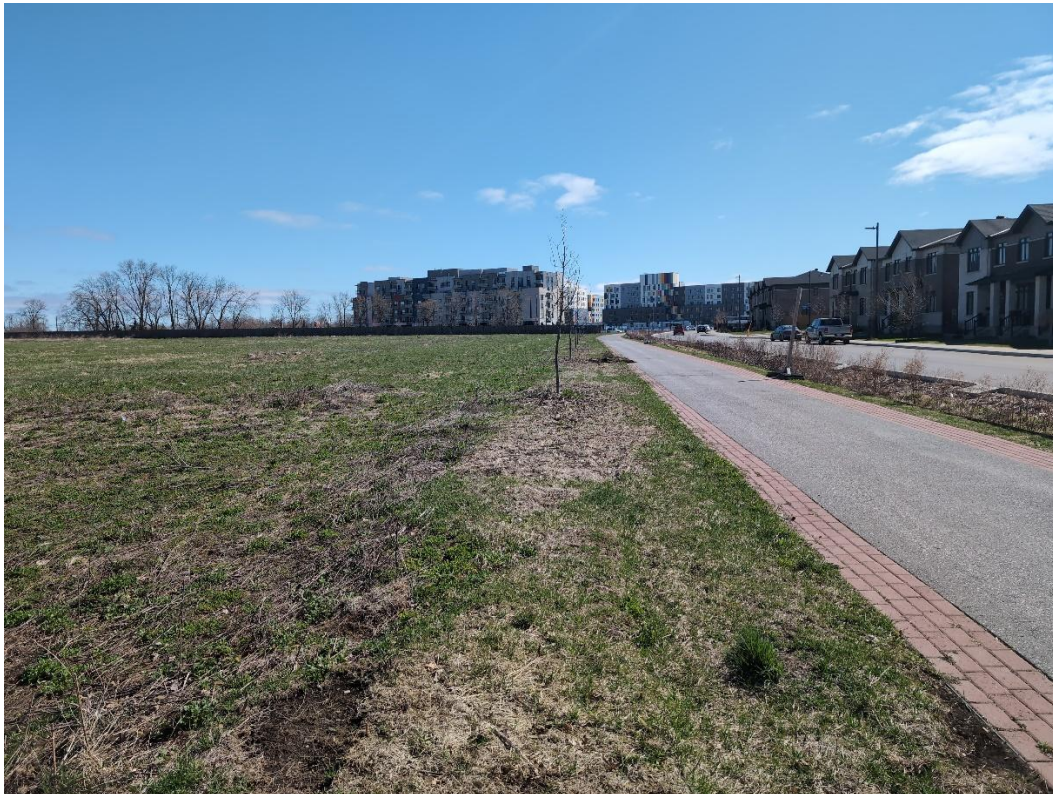
Figure 1 Open grass-dominated field, with planted trees around the perimeter, as viewed along Mikinak Road

The average diameter at breast height of the trees was 5.1 cm, with the largest individual trees measuring 6.5 cm. The City of Ottawa's Tree Conservation Bylaw applies to trees measuring 10 cm DBH or greater. As such, there are no trees of sufficient size on the Site and a TCR is not required to support work at this Site.