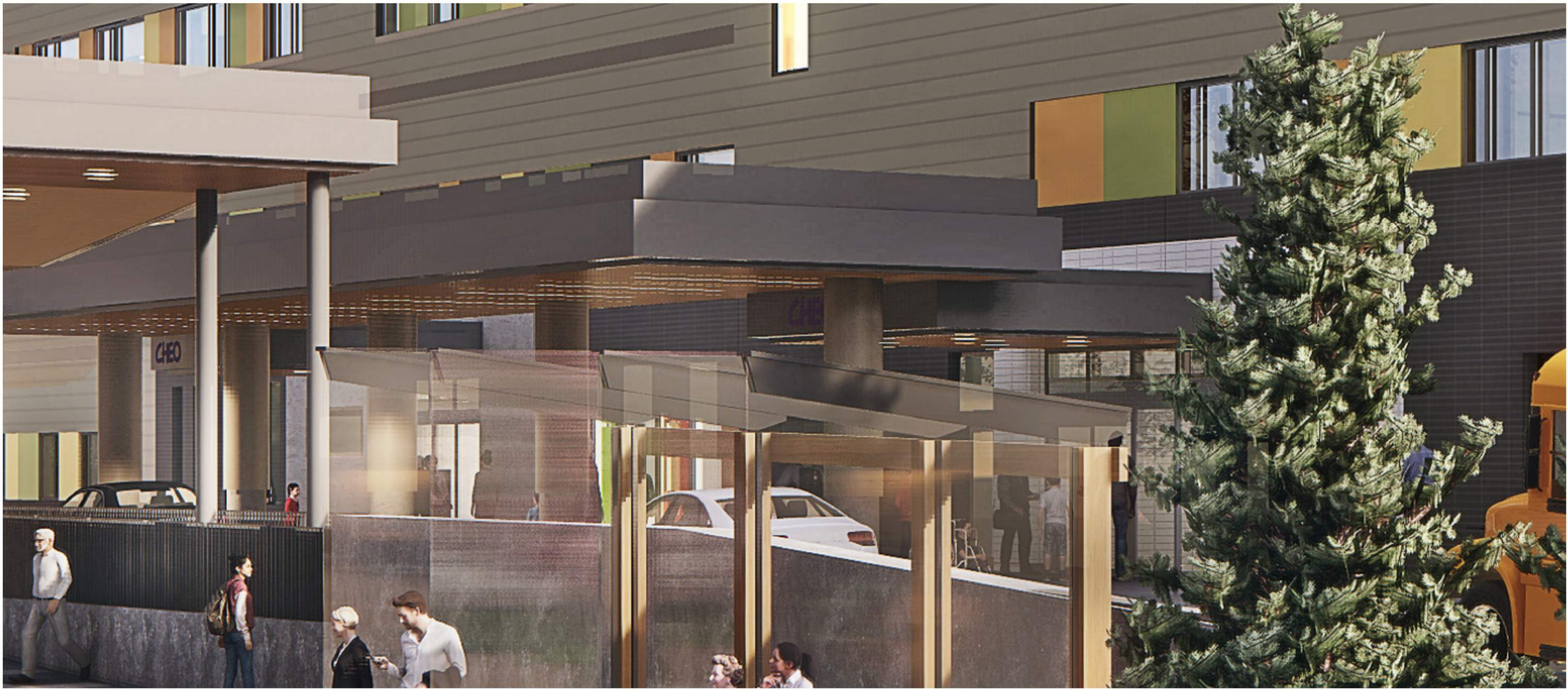
NORTH - LEVEL 2 - 1DOOR4CARE & CHEO SCHOOL ENTRANCE - 3D VIEW