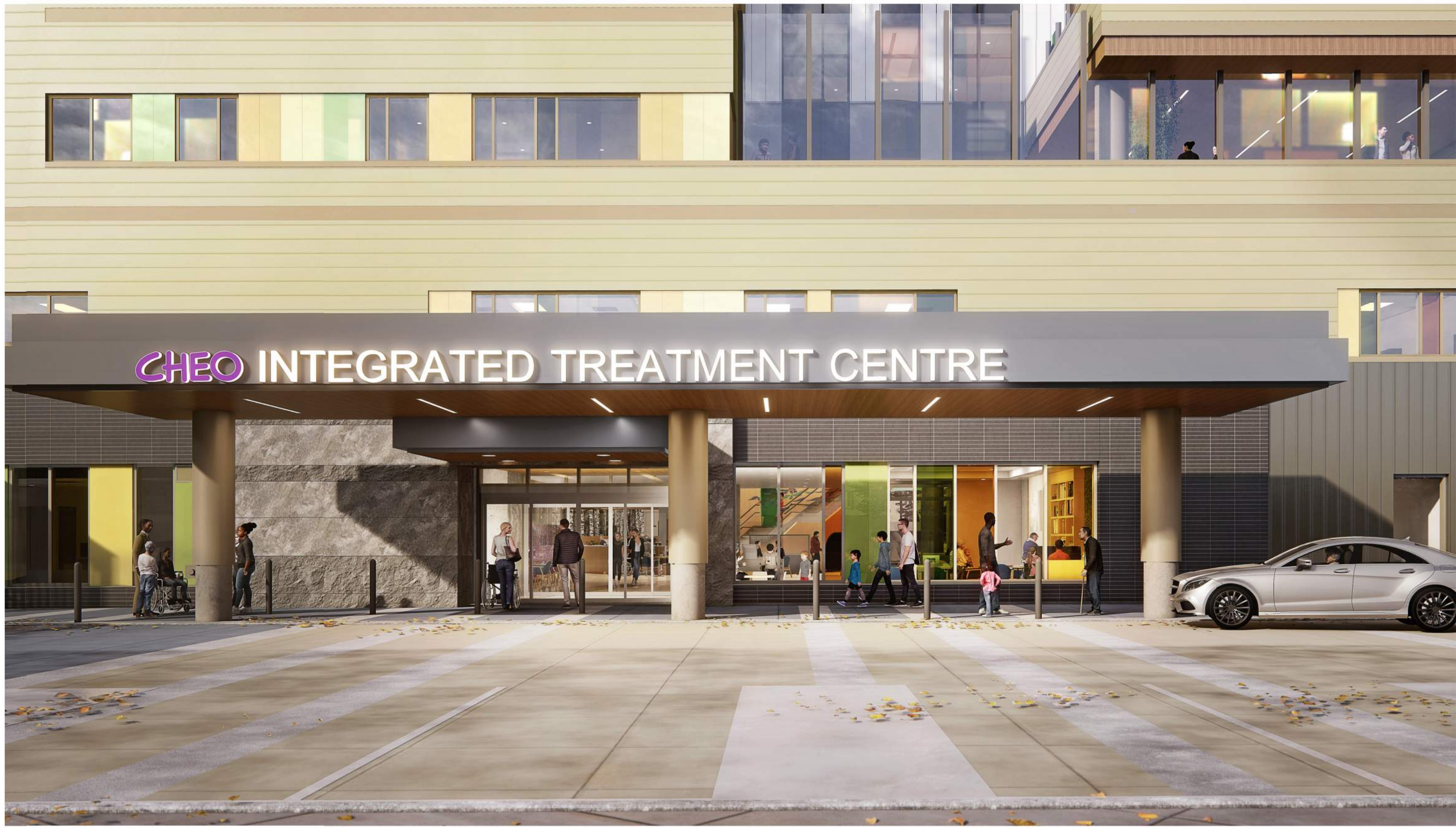
SOUTH - LEVEL 1 - 1DOOR4CARE ENTRANCE - 3D VIEW