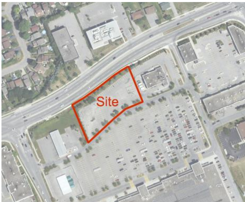
Figure 1: Site Aerial Photo: Chick-Fil-A, 4280 Innes Road, Orleans, Ottawa, ON.

The site is approximately 4740 square meters in area, located in the southeast of the intersection of Innes Road and Lanthier Dr., Orleans, Ottawa, Ontario. Currently the subject site is a parking lot, the proposed development is to construct a new Chick-Fil-A restaurant with drive-through lanes.