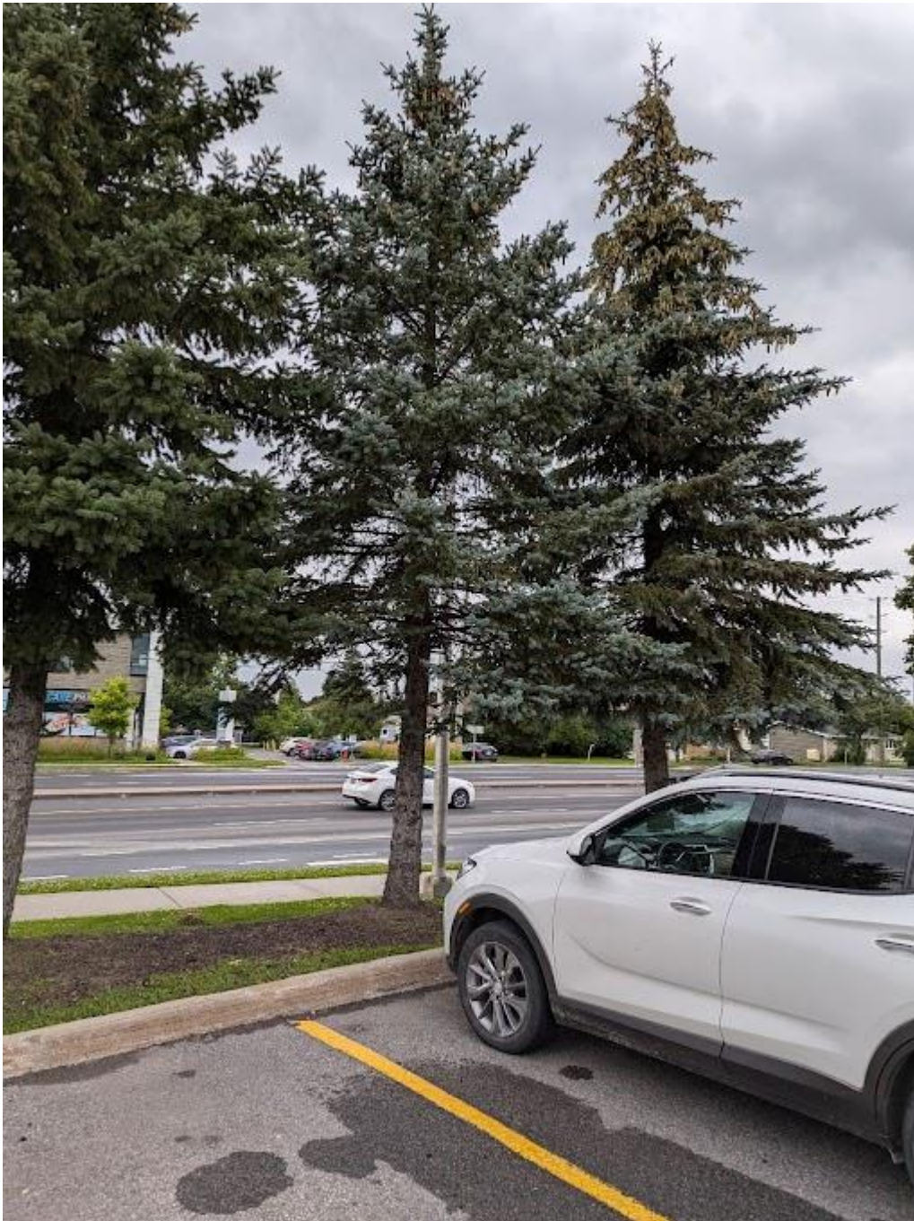
Photo 1 – Tree # 3 ,#4 Blue Spruce (Picea pungens) to be removed due to construction.