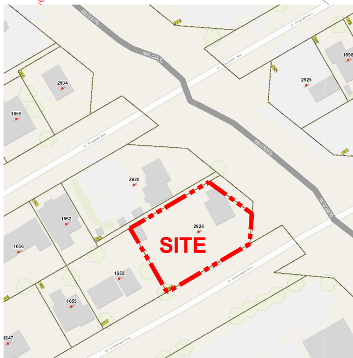
KEY PLAN N.T.S.

AREAS WITHIN THE CRITICAL ROOT ZONE OF EXISTING TREES ARE TO BE EXCAVATED USING A HYDRO-VAC