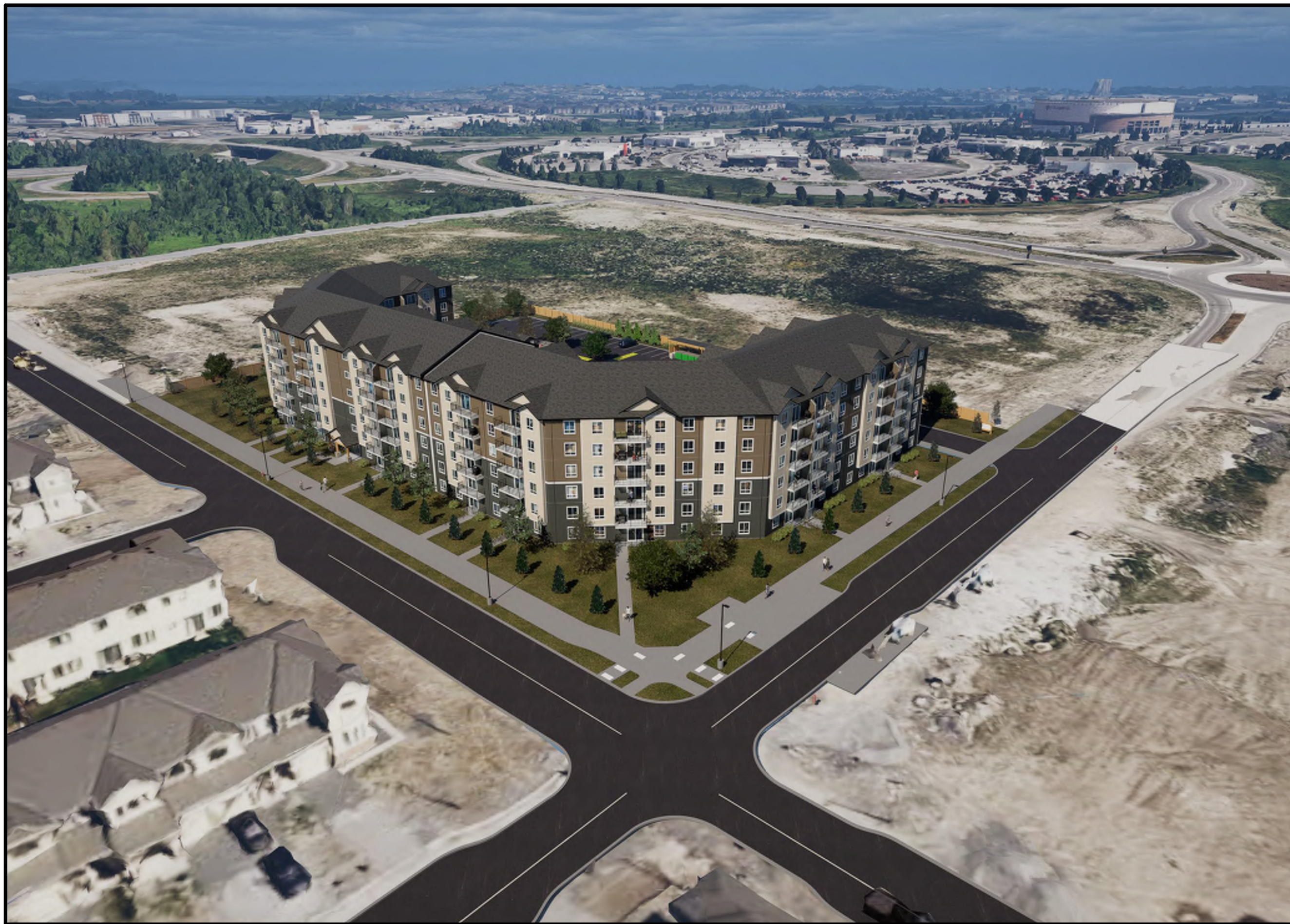
(3) NOTRH VIEW