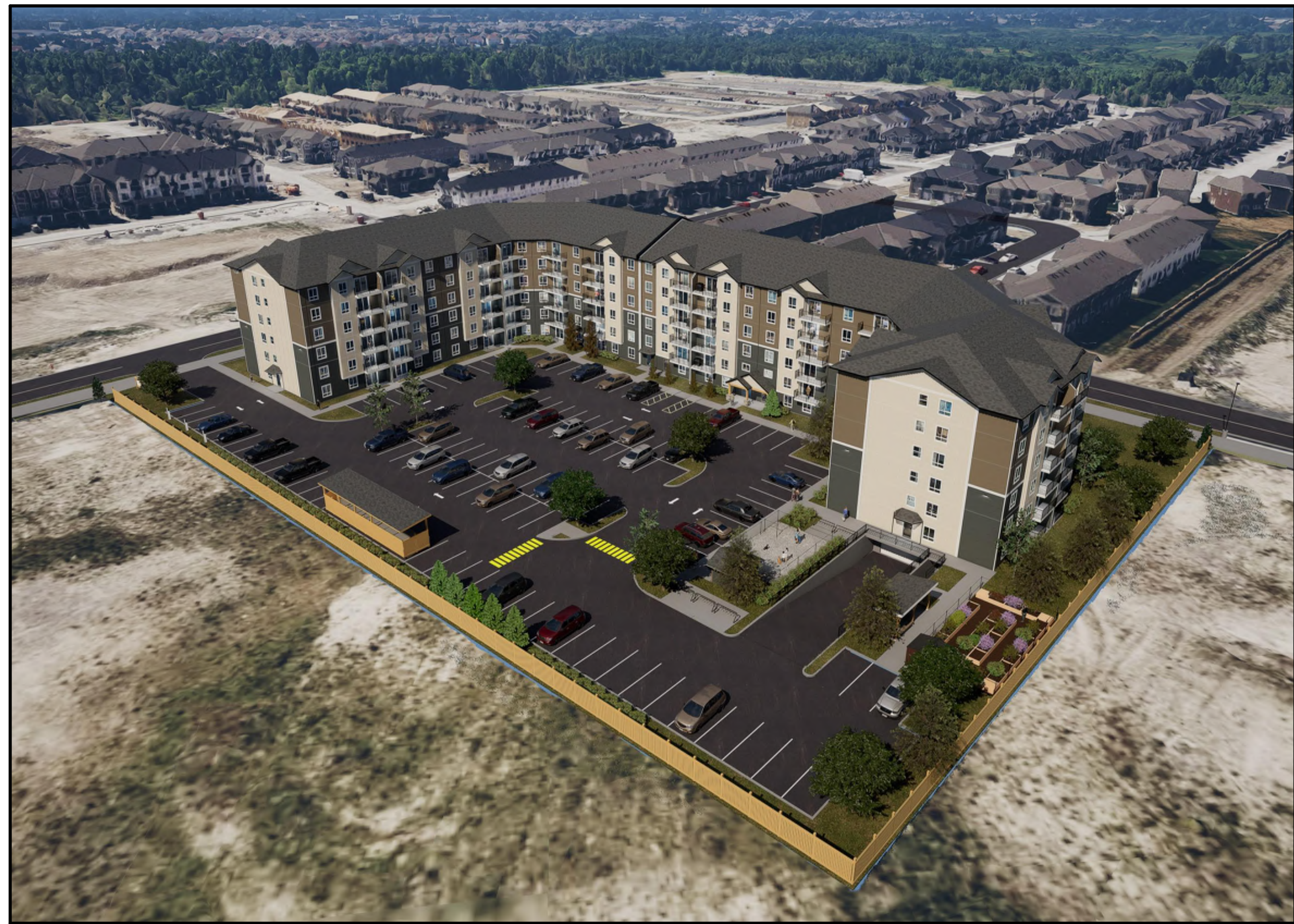
(2) SOUTH VIEW