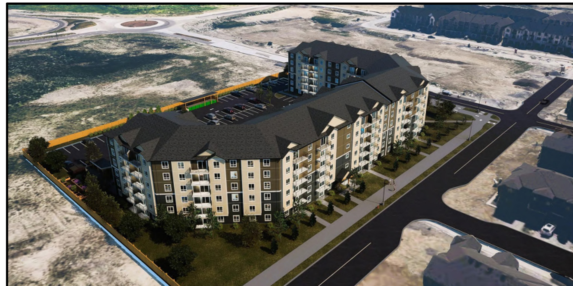
(4) EAST VIEW