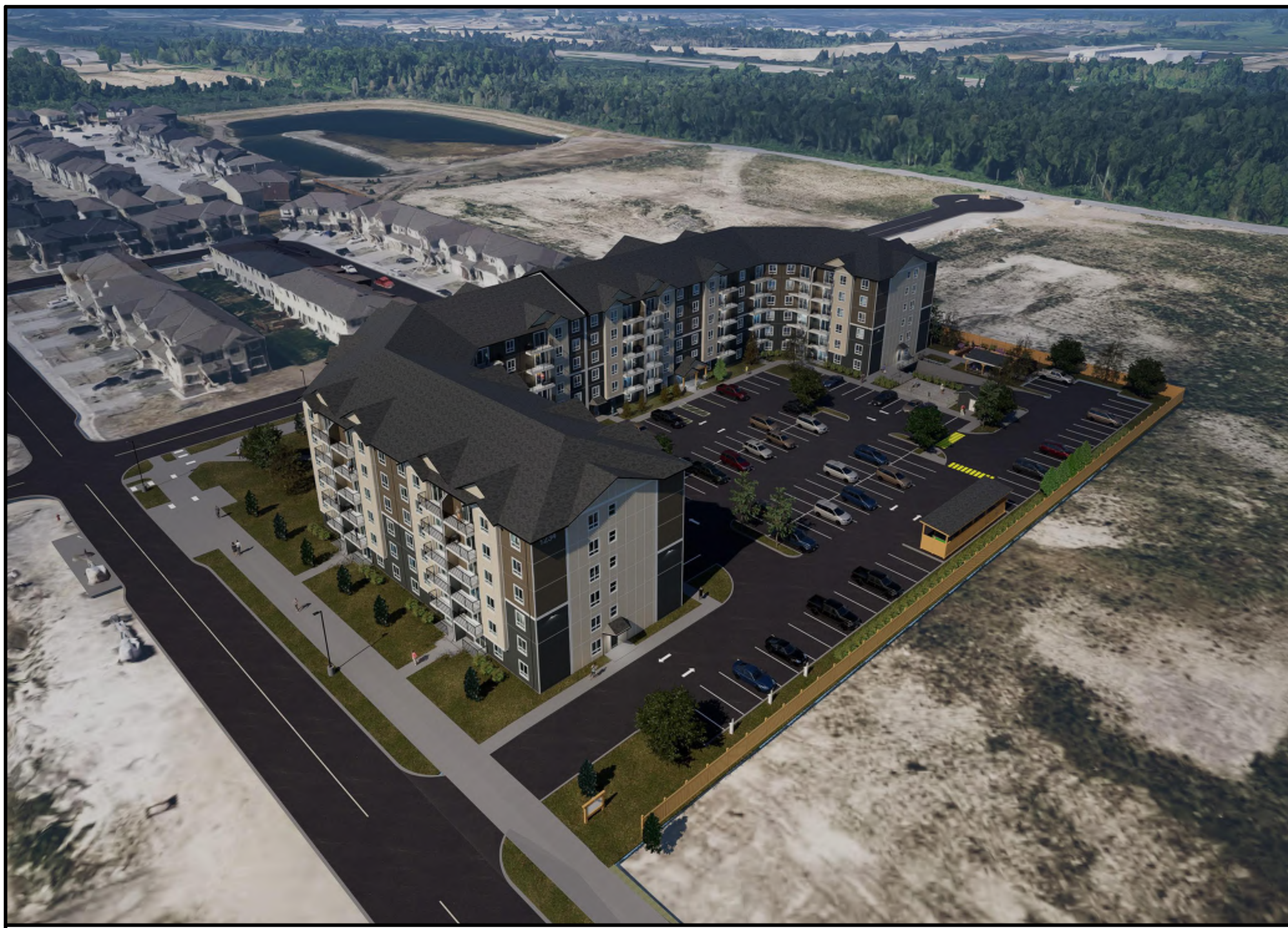
(1) WEST VIEW