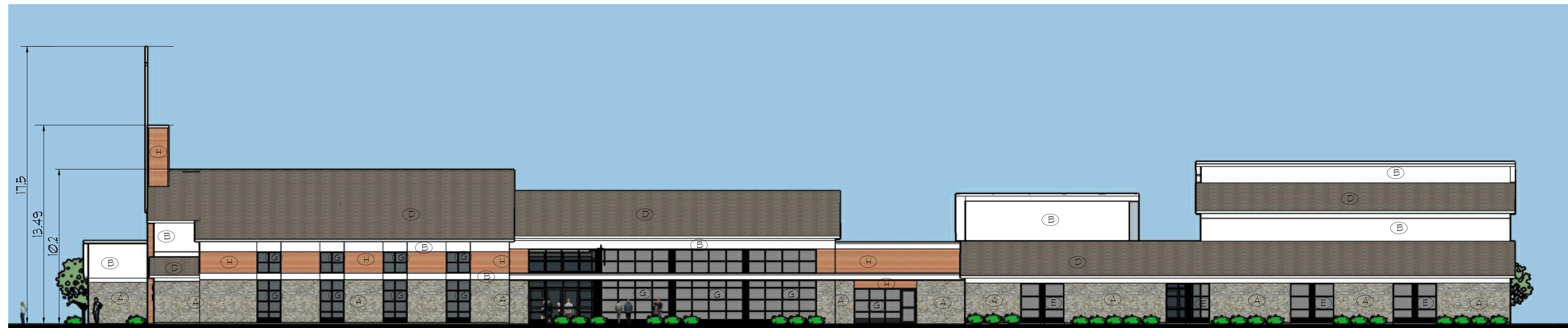
REAR (SOUTHEAST) ELEVATION SCALE 1:150