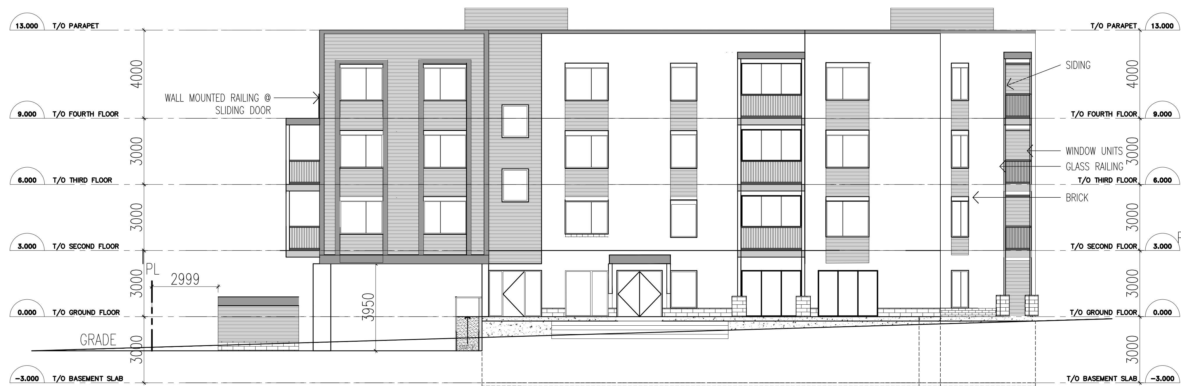
2 SOUTH ELEVATION A201 SCALE 1:100