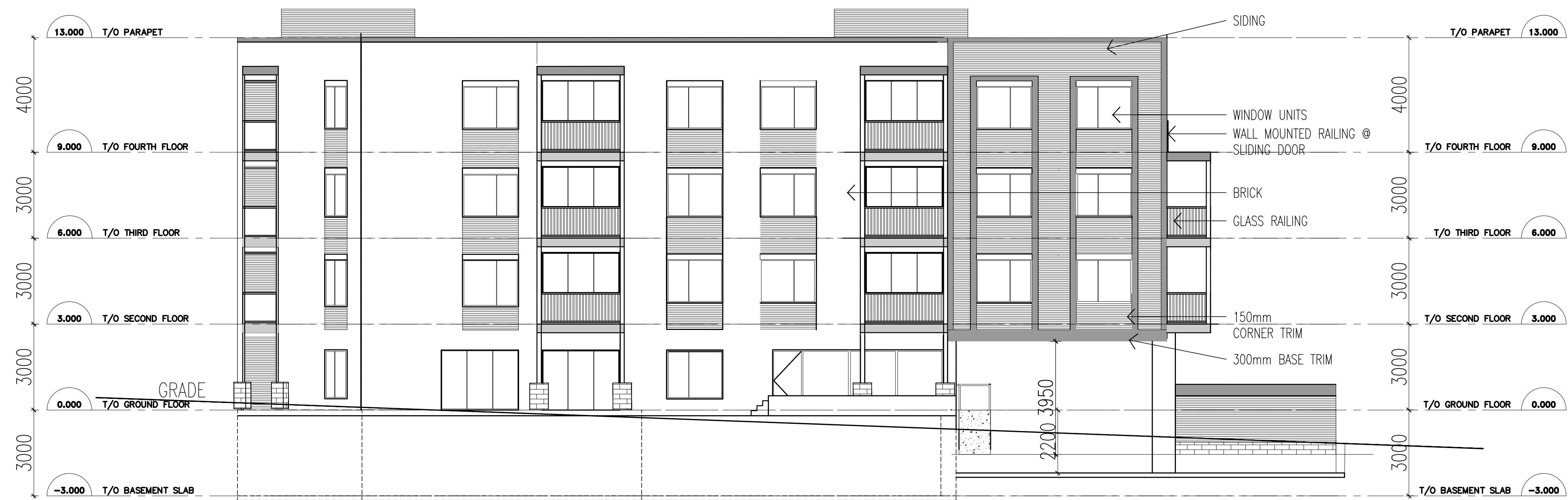
1 NORTH ELEVATION A201 SCALE 1:100