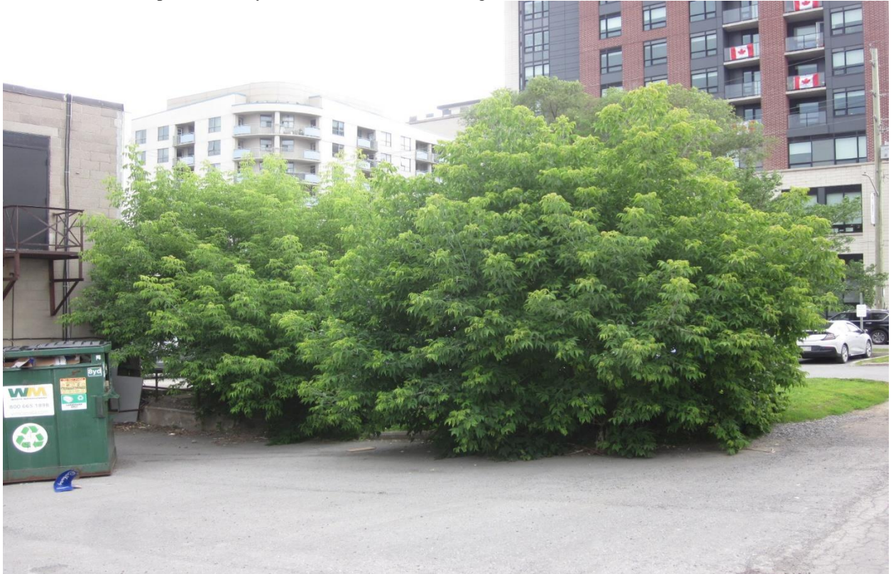
Picture 5. Trees #17 and 18, private Manitoba maples at 1186-1194 Wellington Street