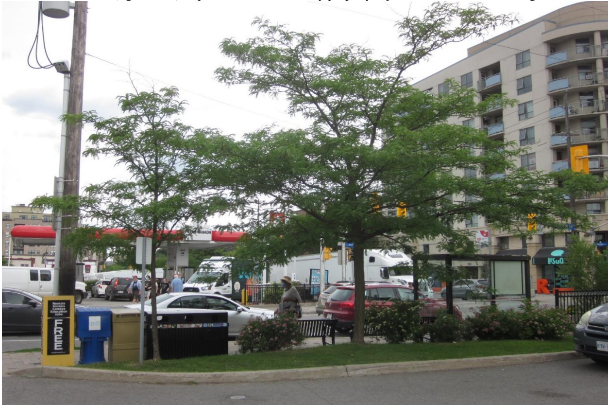
Picture 2. Trees #7 and 8, private Honey-locusts at 1186-1194 Wellington Street