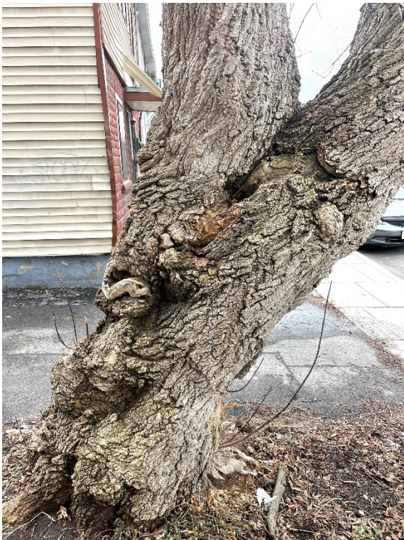
Figure 3: Close up on the east side of tree 1, showing decay and included bark in the main junction of the two stems