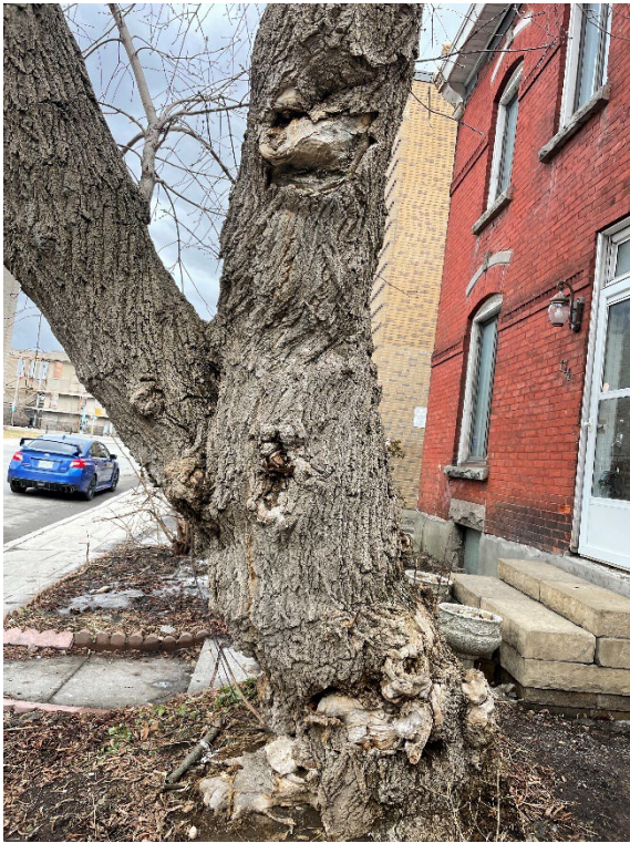
Figure 2: Close up of tree 1 on the west side