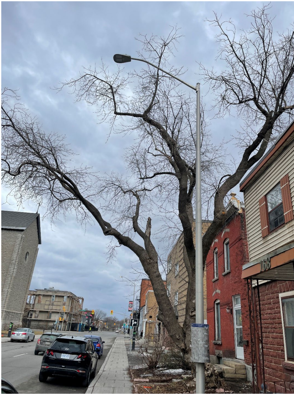
Figure 1: Tree 1, Manitoba maple in poor health to be removed