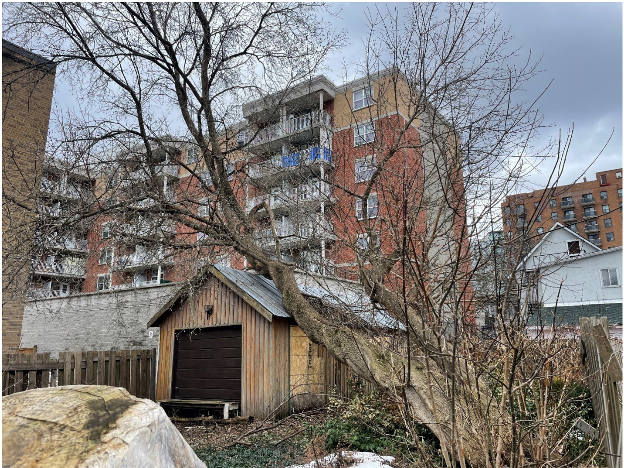
Figure 4: Tree 2, Manitoba maple in rear yard growing at extreme angle on top of existing garage