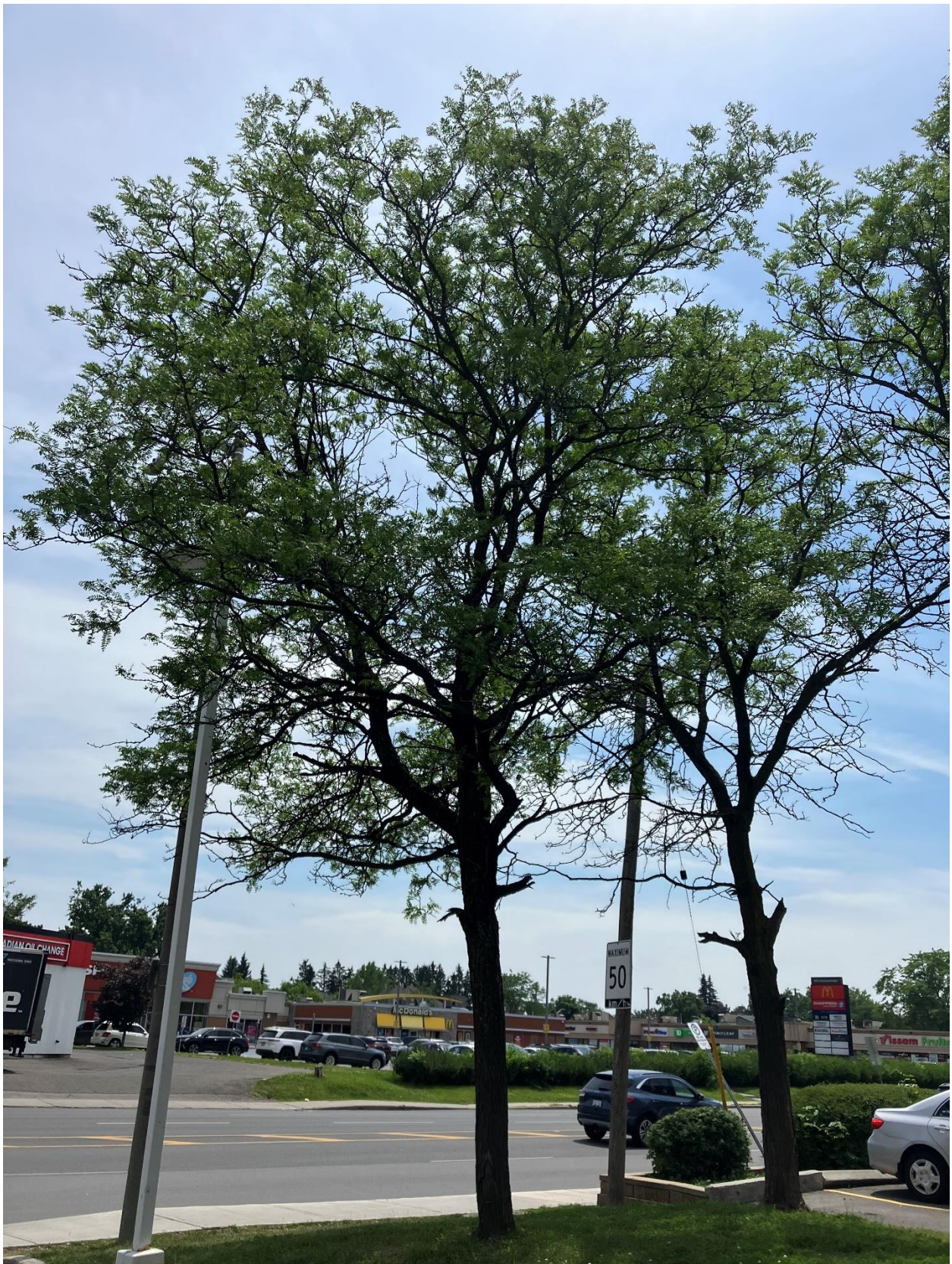
Tree 15 Honey Locust