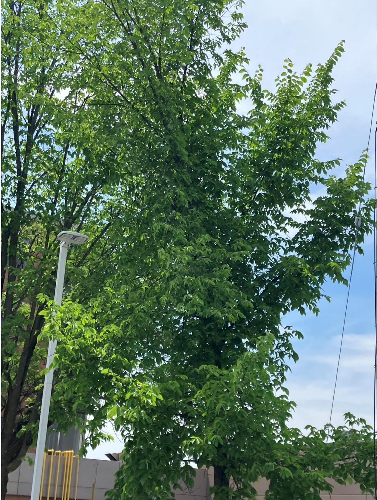
Tree 7 Elm