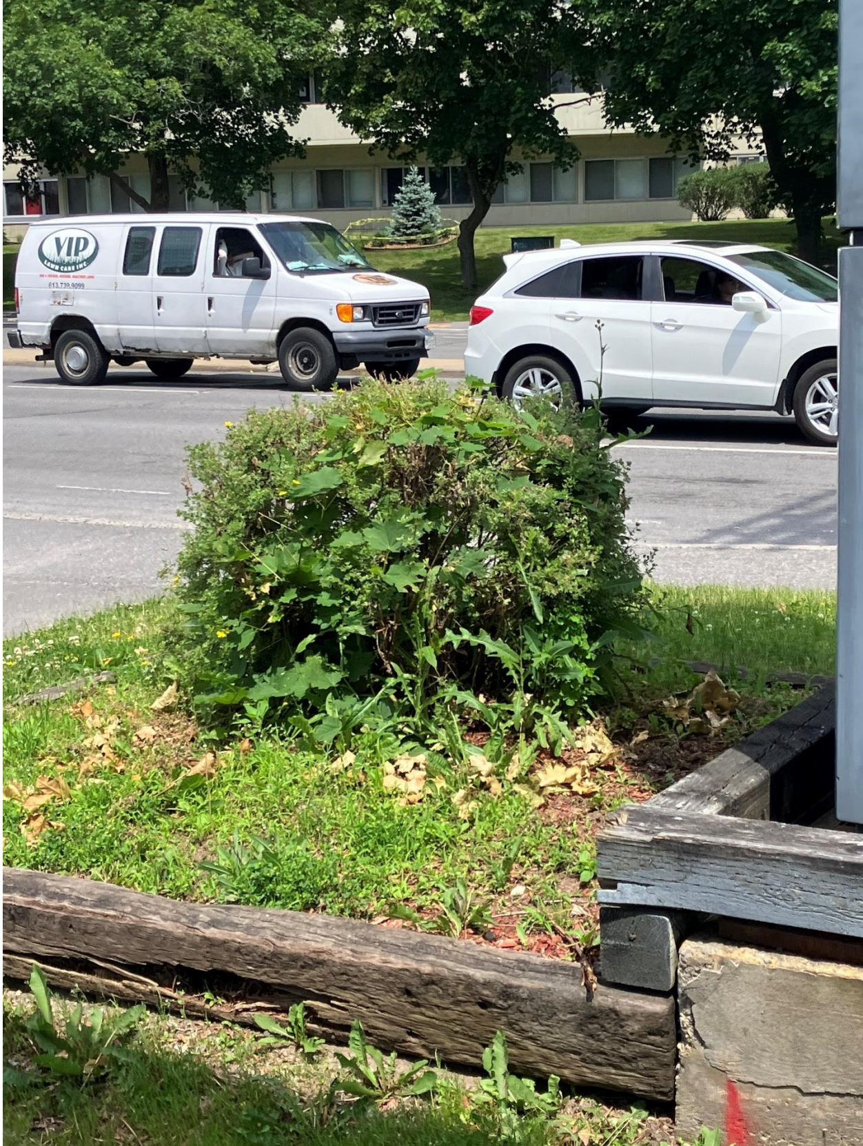
Tree 4 Forsythia