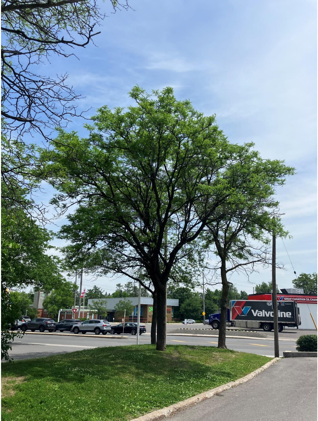
Tree 13 Honey Locust