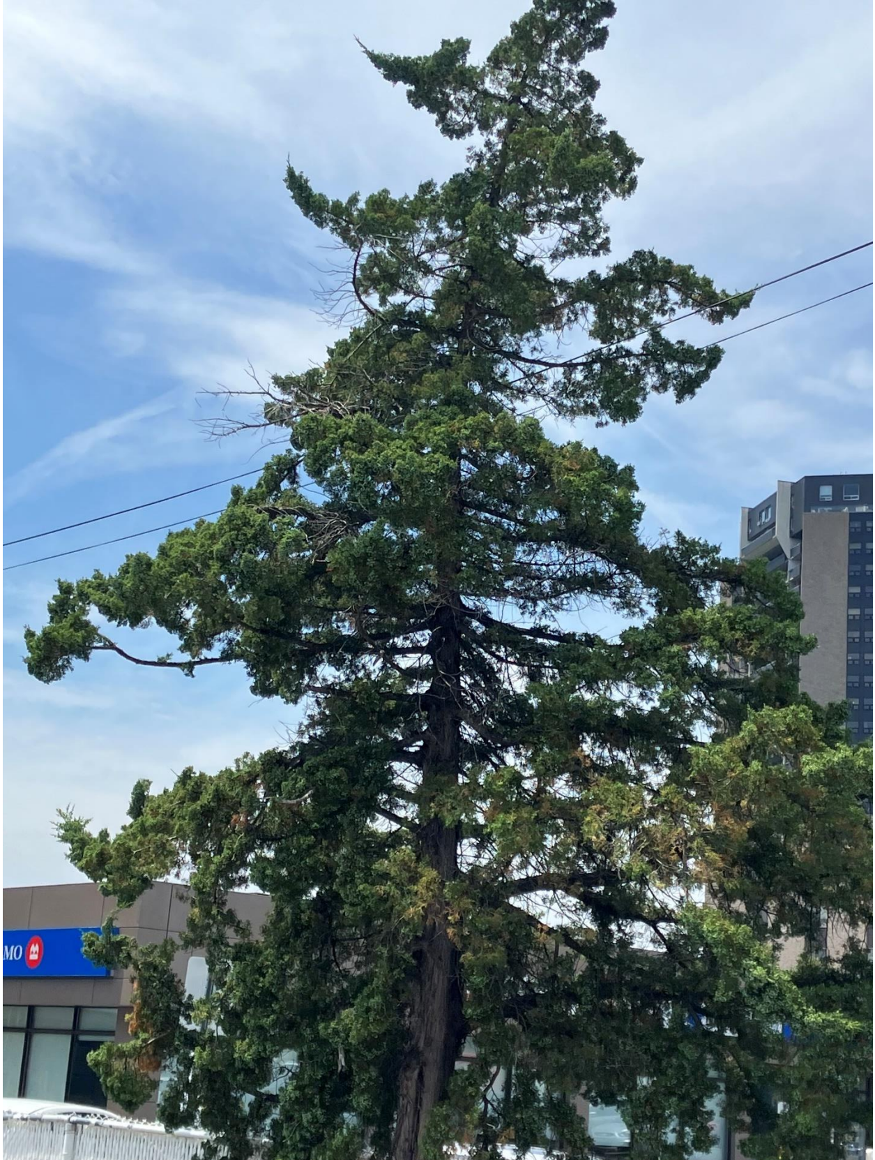
Tree 6 Juniper