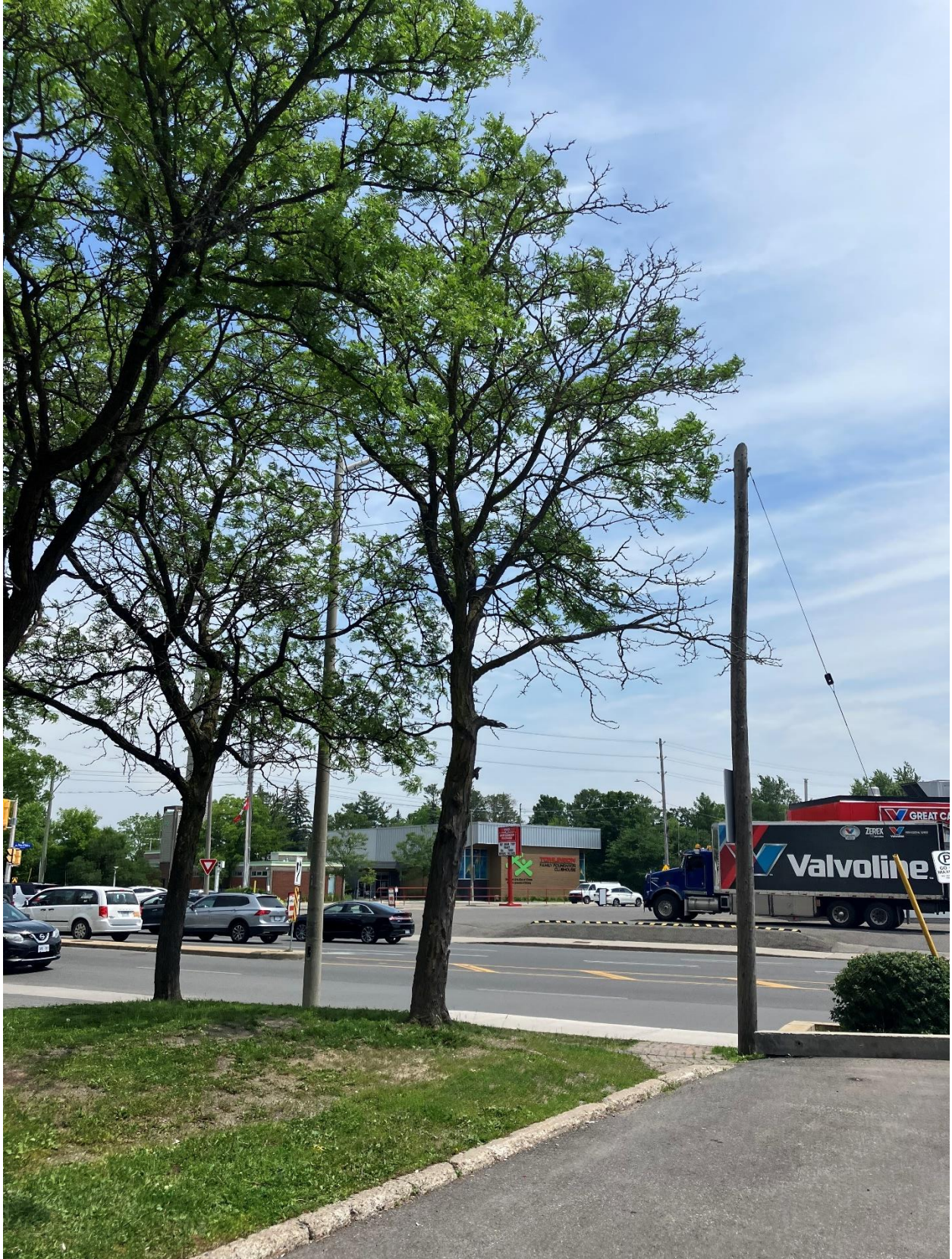
Tree 14 Honey Locust