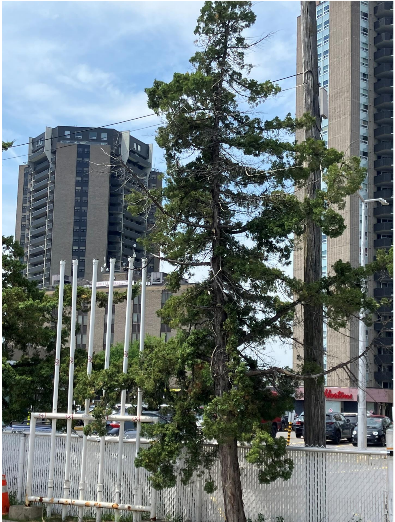
Tree 5 Juniper