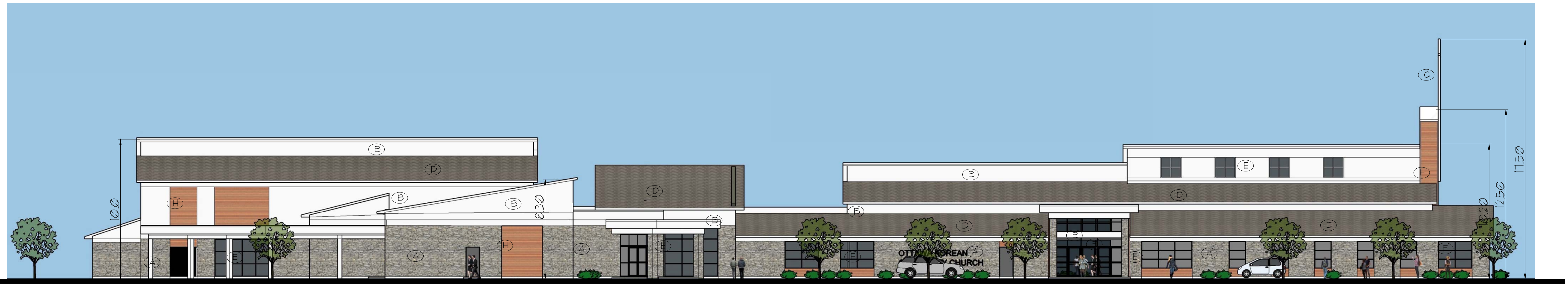
FRONT (NORTHWEST) ELEVATION SCALE 1:150